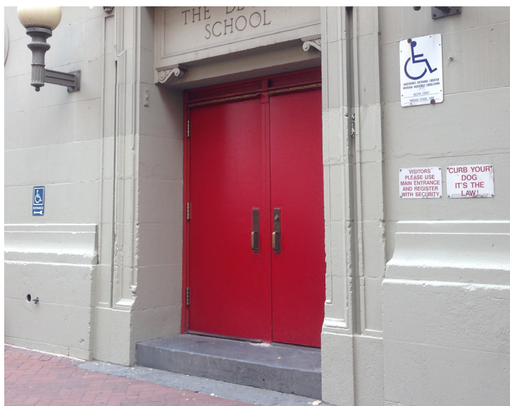
Poll Site Main Voting Entrance on June 24, 2014. Two conflicting signs indicating where the accessible entrance is.

of voters are protected. If the NYC BOE schematics are accurate, up to date and followed, then there would be no barrier issues and privacy issues due to limited space; the two main issues that voters with disabilities currently face beyond the inaccessibility of school facilities. Therefore, since many issues identified by voters with disabilities would be eliminated by the use of the designated room and ensuring that the accessible path remains accessible, these terms can be clearly placed on specific parties and thus place accountability.