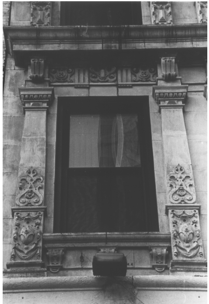
Details of the ground story restaurant entrance and second story window bays