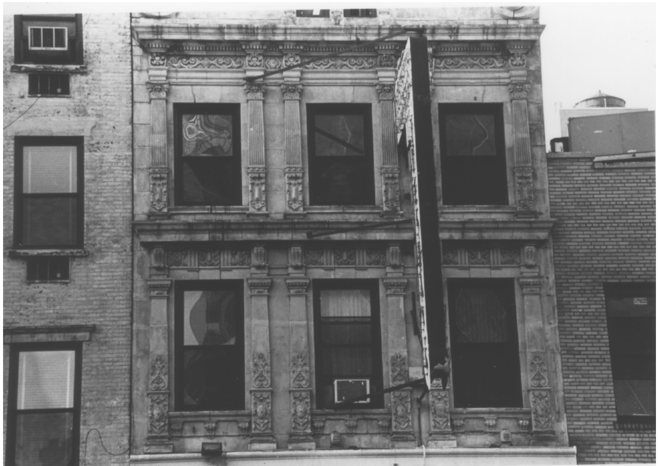
Details of upper stories and attic gable