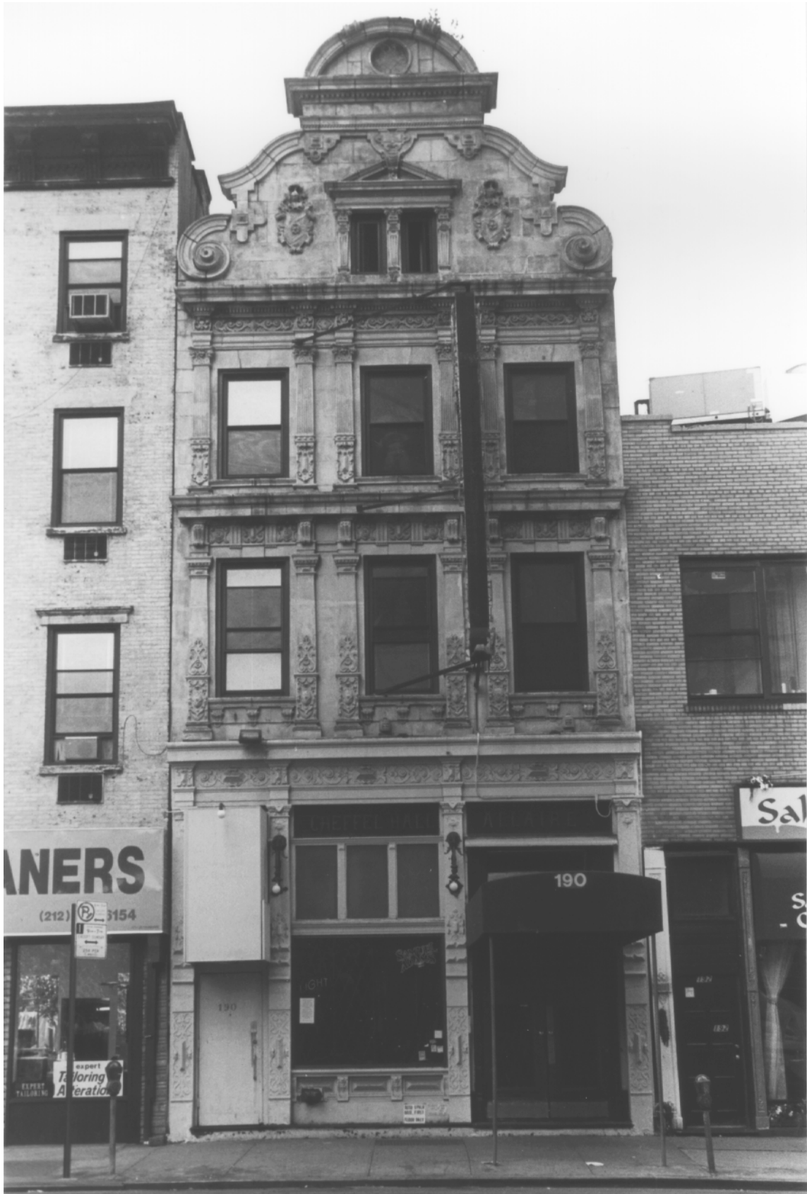
Schefell Hall 190 Third Avenue, Manhattan