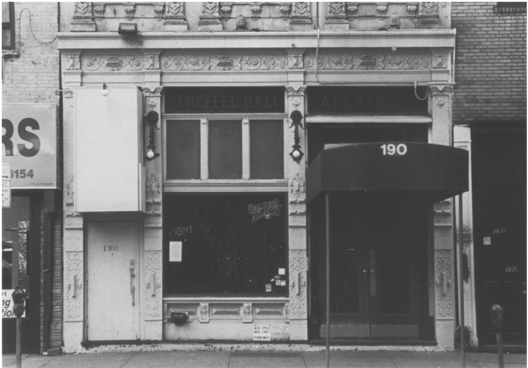
The ground story storefront