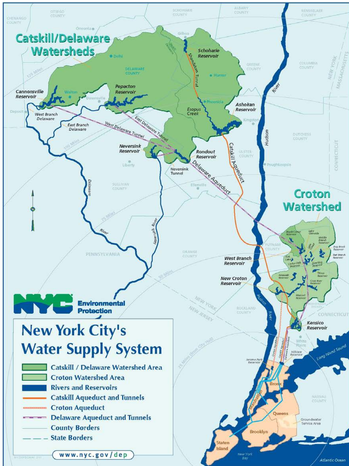
Figure 1. New York City Water Supply Watersheds