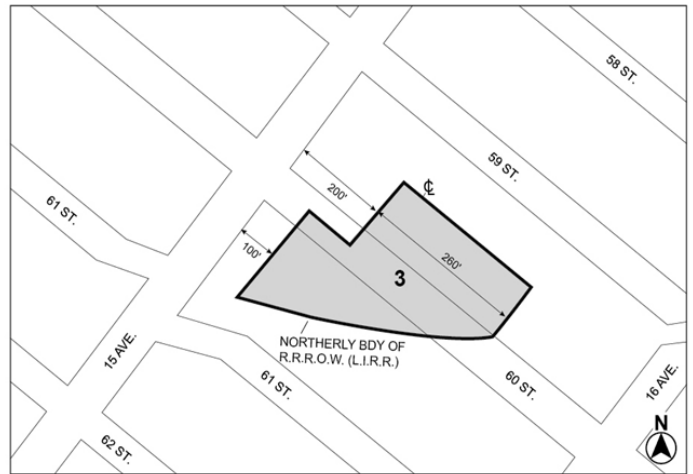
Mandatory Inclusionary Housing Program Area see Section 23-154(d)(3) Area 3—1/6/21 MIH Program Option 1 and Option 2