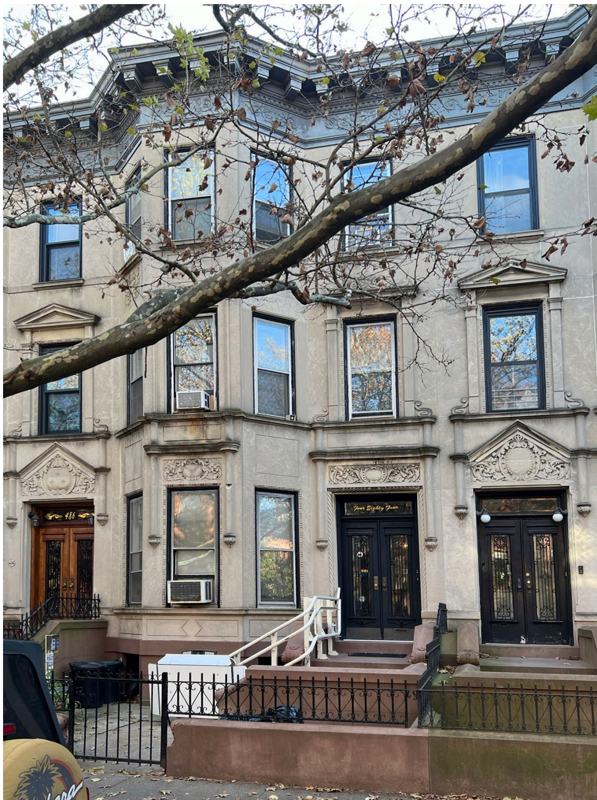
The Lesbian Herstory Archives, 484 14 th Street, Brooklyn