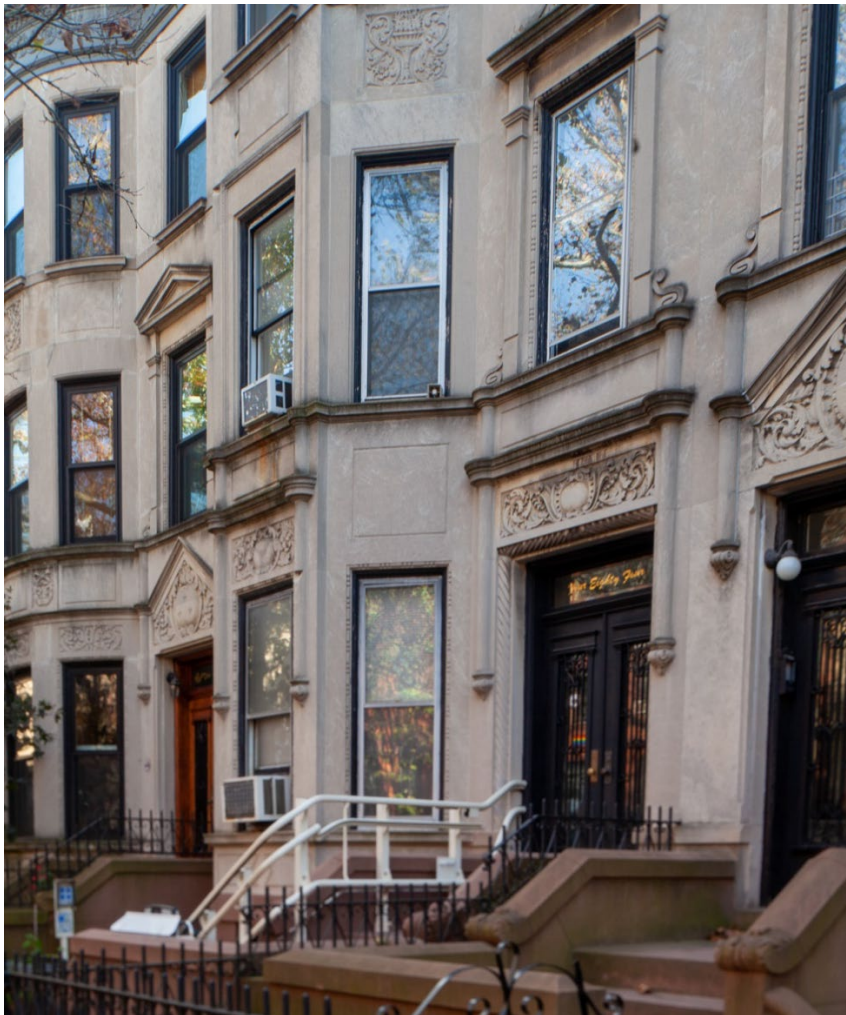
484 14 th Street Bilge Kose, November 2022