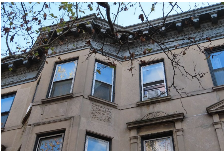
Third Story and Cornice