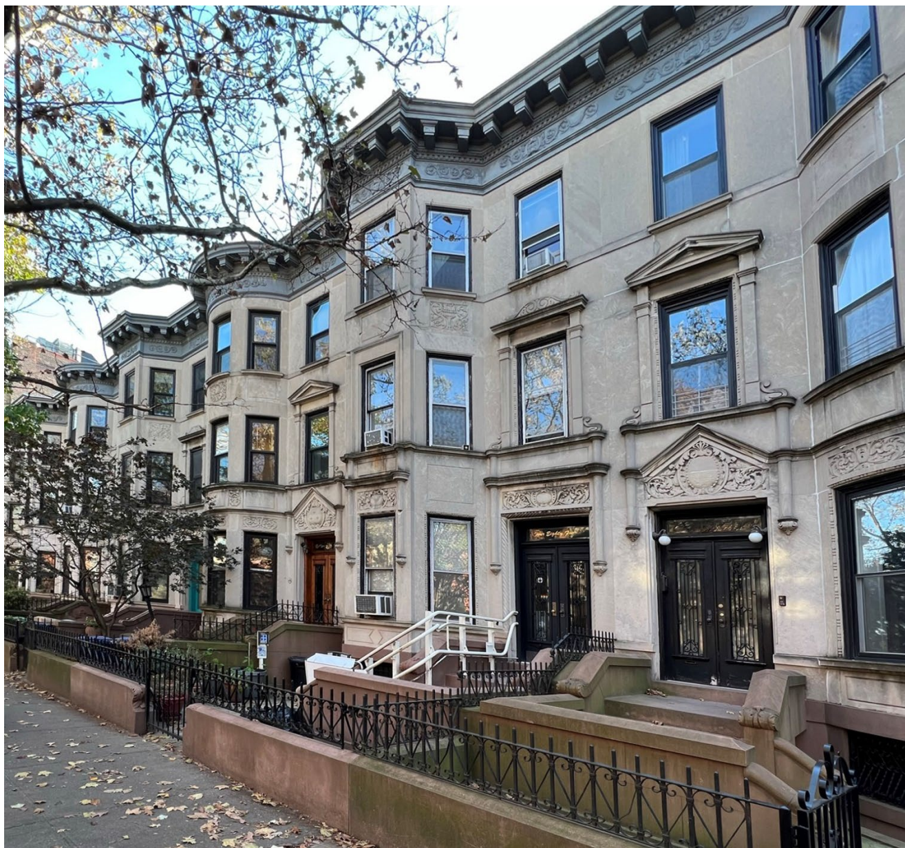
482-486 14 th Street, November 2022