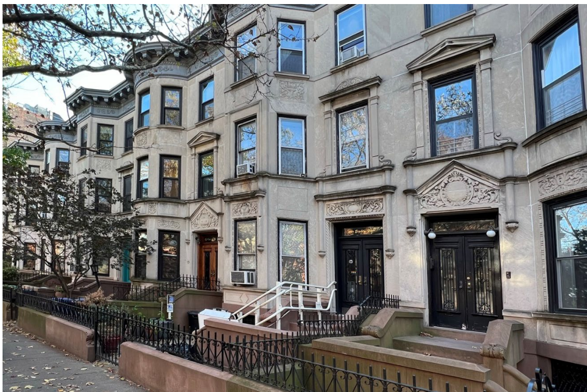
484 14 th Street, Brooklyn 2022