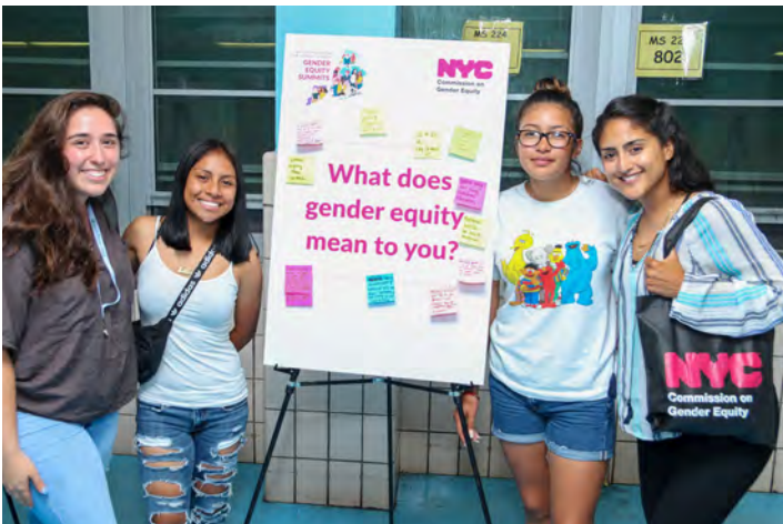
Gender Equity Summit in the Bronx, June 2019

The efforts that were discussed included: