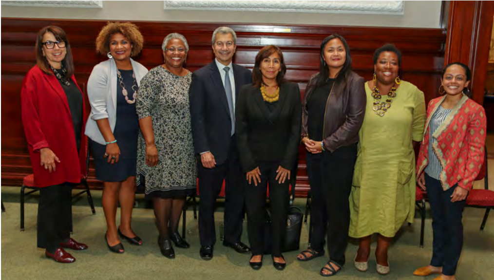
Pay Equity Public Hearing, September 2019

The speakers went on to elucidate some of the factors contributing to those persistent and pernicious pay gaps: