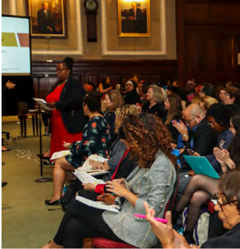
Pay Equity Public Hearing, September 2019

Speakers consistently praised CGE for making pay equity a key initiative and the de Blasio Administration for taking concrete steps to improve the chances that all women and transgender and gender non-binary individuals can achieve genuine pay equity. They also strongly urged action to promote economic equity and justice for workers and their families across sectors, particularly in low-wage fields with higher concentrations of women.