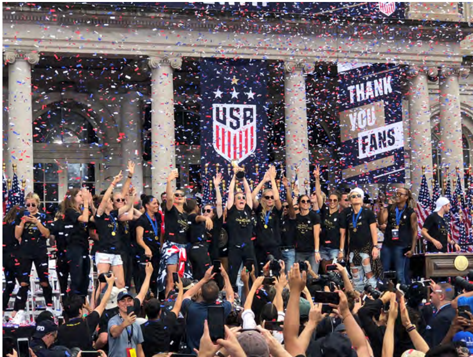
United States Women's National Soccer Team Ticket Tape Parade, July 2019