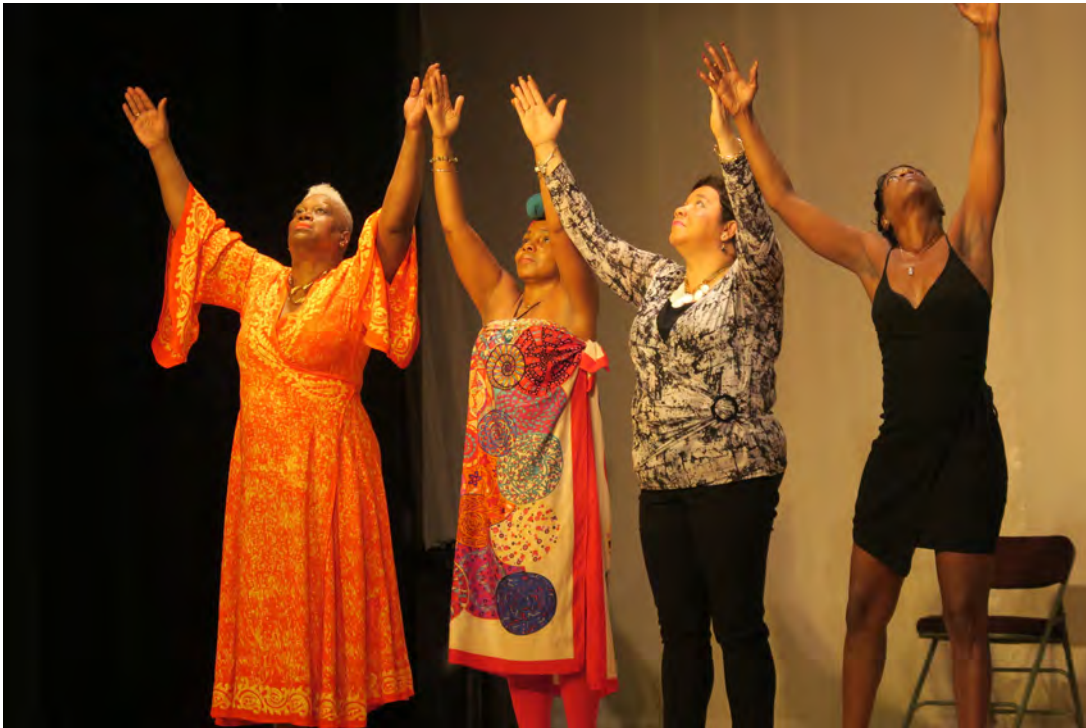
Gibney Dance Survivor Leaders performance, December 2019

10 ( International Human Rights Day ). It kicked off with a video in which First Lady of New York City, Chirlane McCray, called for all New Yorkers to join in the fight against gender-based violence, and then rolled out an impressive range of individual programs representing the many demographic groups and communities of the city.