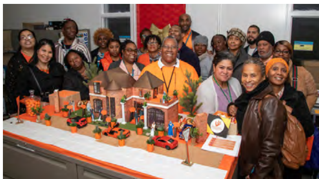
16 Days of Activism against Gender-Based Violence campaign, November 2019

The Campaign took place from November 25 ( International Day for the Elimination of All Forms of Discrimination Against Women ) through December