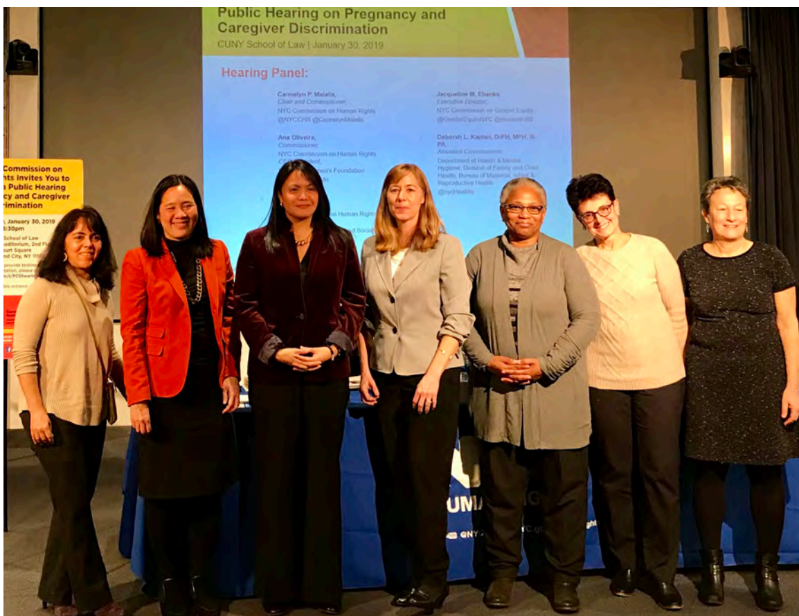
Public Hearing on Pregnancy and Caregiver Discrimination, January 2019

https://www1.nyc.gov/assets/cchr/downloads/pdf/publications/Pregnancy_Report.pdf .