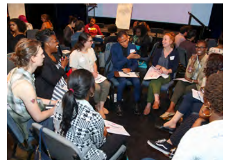
Gender Equity Summit in Brooklyn, June 2019