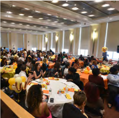
FDNY's Third Annual Woman to Woman Summit, May 2019

2020 is a major anniversary year in the history of gender equity efforts and victories at the global, national, and local levels. Globally, it is the 25th anniversary of the 4th World Conference on Women in Beijing where Secretary Clinton declared that "women's rights are human rights". Nationally, it is the 100 th anniversary of the 19 th Amendment which states a citizen cannot be denied the right to vote based on their sex. And locally, it is the 45 th anniversary of the establishment of the City's first Commission on the Status of Women—the precursor to CGE.