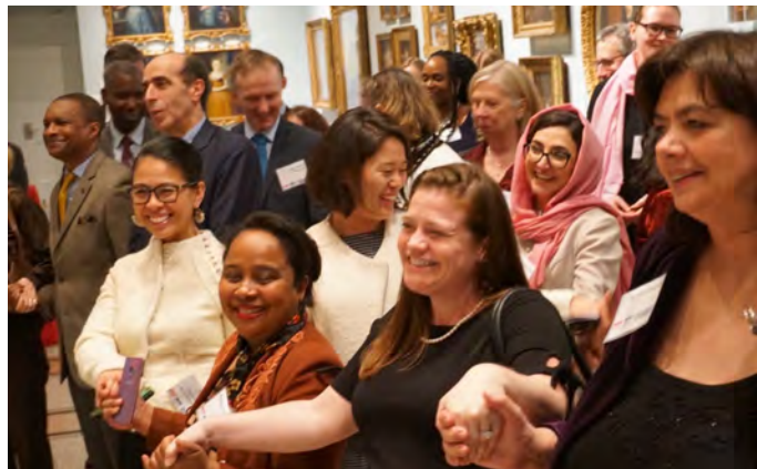
Commission on the Status of Women reception, March 2019

Chirlane McCray First Lady of the City of New York