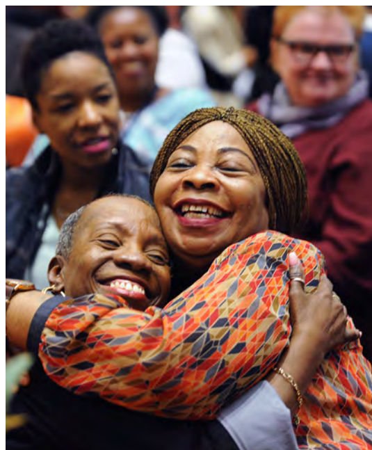
FDNY’s Third Annual Woman to Woman Summit, May 2019

Highlights from CGE’s 2019 accomplishments within its three main focus areas; discussion of CGE’s role within the City’s larger commitment to gender equity; and descriptions of its efforts to ensure sustainable progress and broad impact are presented in this report. Additionally, new to this report , are key New York City budget highlights impacting women and girls, and transgender and gender non-binary New Yorkers, as well as Agency Spotlights demonstrating the Administration-wide commitment to gender equity within CGE’s three focus areas.