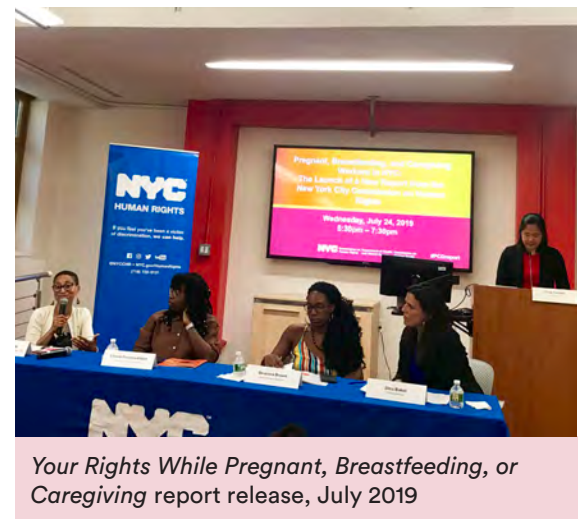
Your Rights While Pregnant, Breastfeeding, or Caregiving report release, July 2019

The report commends the de Blasio Administration for its work: (1) creating laws mandating reasonable accommodation of employees’ pregnancy and lactation needs; (2) enacting specific prohibitions against discrimination on the basis of caregiver status; and (3) supporting the New York State Paid Family Leave Act. It goes on to articulate legislative recommendations that were made by members of the public who offered testimony, and do not necessarily reflect the views of CCHR: