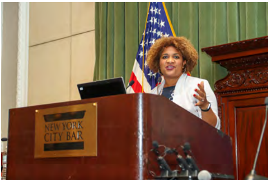
Pay Equity Public Hearing, September 2019

As part of its ongoing commitment to closing the gender pay gap, the Commission on Gender Equity convened a Public Hearing on Pay Equity in partnership with the Commission on Human Rights (CCHR), the Department of Consumer and Worker Protection (DCWP), and the New York City Bar Association on September 18, 2019.