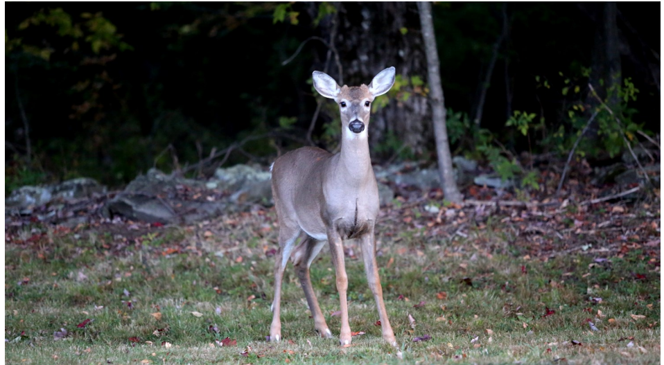
A deer along watershed property in Delaware County

Are deer the only culprit? Deer are surely a key plant consumer in the forest matrix. A single deer can consume 4-6 pounds of buds per day, adding up to a ton or more of missing plants in the forest throughout the year. For example, a healthy sugar maple or red oak tree during a good seed year can translate into hundreds of tiny seedlings beneath it. However, both maple and oak are highly preferred by deer who can wipe out seedlings before the next growing season. When deer significantly remove plants below 5 feet, other wildlife species can also be harmed because this vegetation provides food and cover from predators.