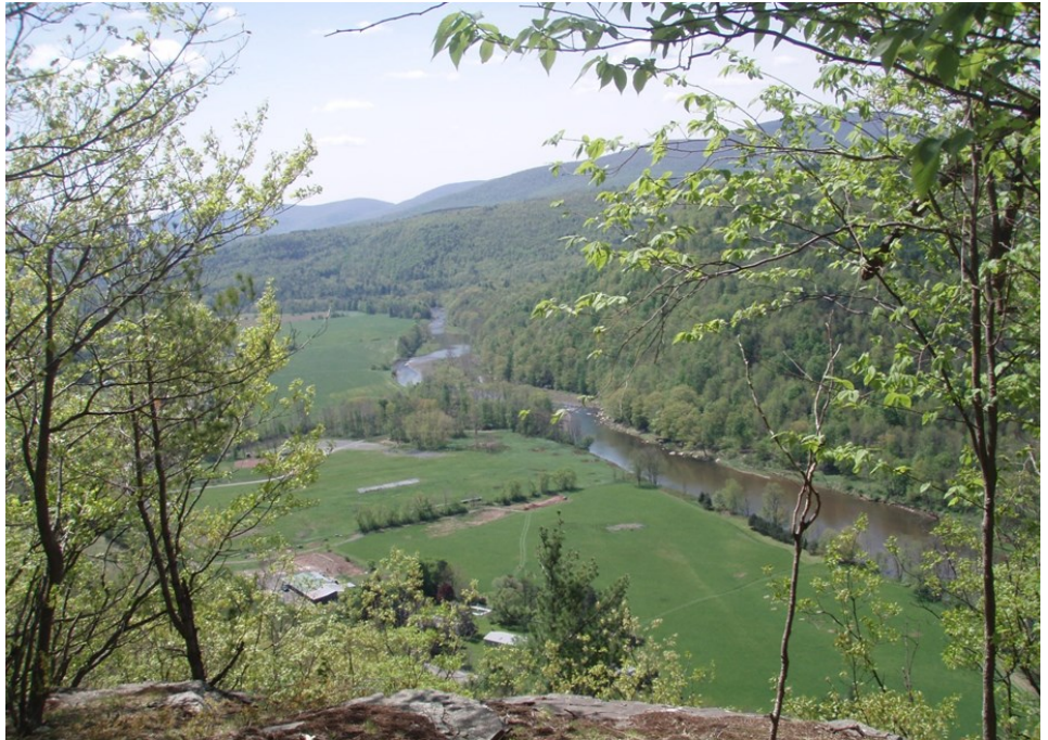
Schoharie Valley from Huntersfield Creek Unit

This piece of the Catskills has it all, from thick forests to open meadows. At the top of the property, hikers are rewarded with a bird's-eye view of the Schoharie Creek as it meanders toward the reservoir. Access to the property is located on a small section of road frontage on Main Street in Prattsville or from Huntersfield Road.