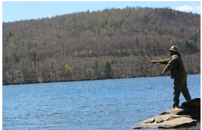
An angler at Rondout Reservoir.

In the interest of protecting the environment, please remember to do your part. If you carry it in, carry it out! I want to wish you a good year of fishing in 2016!