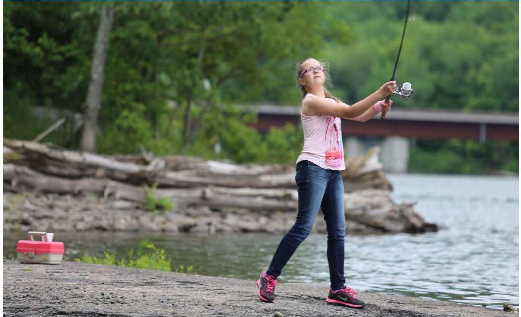
A young angler casts her line into Pepacton Reservoir during Family Fishing Day last June. More than 300 people participated in DEP's public fishing events in 2015.