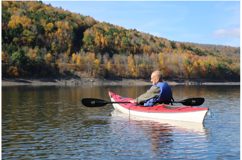
A kayaker enjoys Pepacton Reservoir during autumn.

DEP's recreational boating program attracted a record 1,463 visitors in 2015, the largest year-over-year increase since the program began. More than half those visitors kept boats at the reservoirs and likely used them multiple times during the year. DEP permits the use of kayaks, canoes, sculls and small sailboats on four of its reservoirs in the Catskills - Cannonsville, Neversink, Pepacton and Schoharie. Use of the program has increased by 50 percent since it began in 2012.