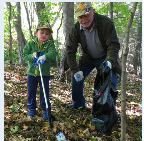
Reservoir Cleanup Day 2015

Are you interested in keeping reservoir shorelines, boat launch areas, and popular fishing spots free of debris? In 2016, DEP is piloting a Watershed Steward Program at Pepacton and Kensico reservoirs to protect the natural resources that surround them. Volunteer watershed stewards will be trained on the Recreation Rules and what they can do to help keep New York City's reservoirs great places to recreate. Once trained, stewards will be asked to adopt a boat area or launch site and keep an eye on it throughout the year. They will report any observed problems like invasive species, trash, problem boats, and more. They will also act as ambassadors to share information with interested anglers and boaters. If you meet any of DEP's volunteer stewards please share your experiences, express your concerns, or ask them questions. For more information on how you can help, contact us at 1-800-575-LAND.