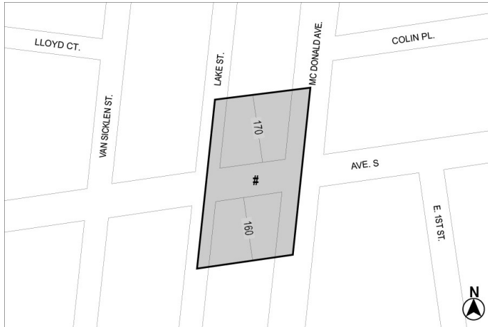
█ Mandatory Inclusionary Housing Program Area see Section 23-154(d)(3) Area # — [date of adoption] MIH Program Option 1 and Option 2

Portion of Community District 11, Brooklyn