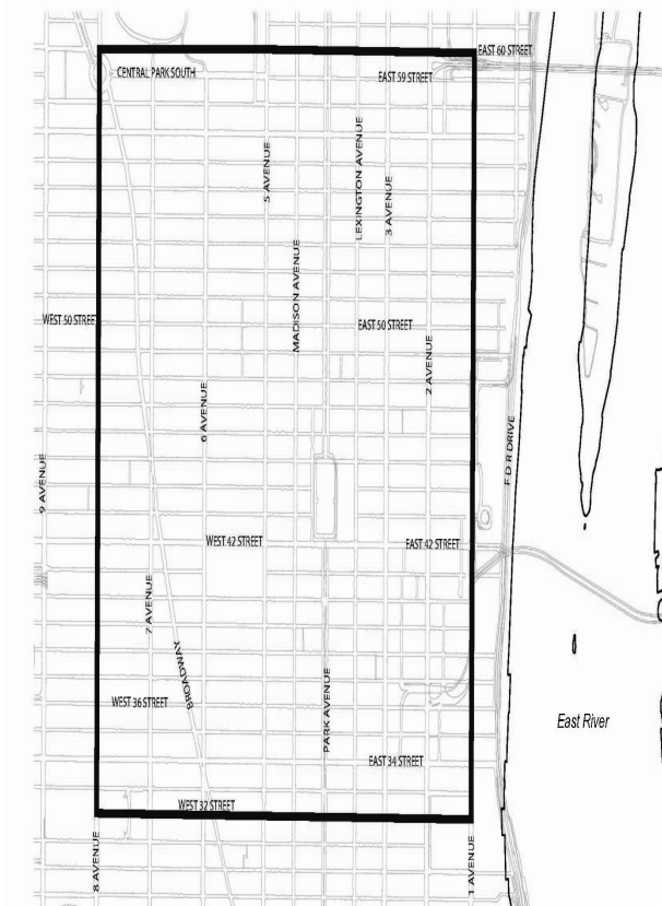
Boundary where public parking lots are not permitted in the Midtown Manhattan Core, except where permitted by Section 13-46 (Special Permits for Additional Parking Spaces)