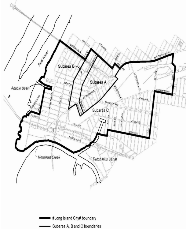
Map 2 - Locations where curb cuts are prohibited