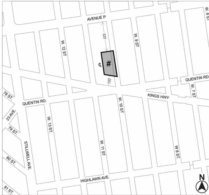
Mandatory Inclusionary Housing Area see Section 23-154(d)(3)

Area # — [date of adoption] — MIH Program Option 1 and Option 2