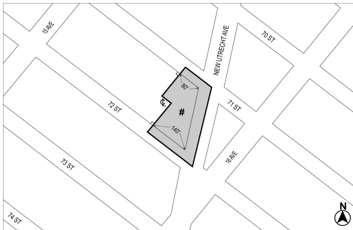
Mandatory Inclusionary Housing Program Area see Section 23-154(d)(3) Area # — [date of adoption] MIH Program Option 1 and Option 2

Portion of Community District 11, Brooklyn