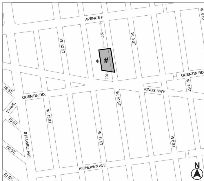
Mandatory Inclusionary Housing Area see Section 23-154(d)(3)

Area # - [date of adoption] - MIH Program Option 1 and Option 2