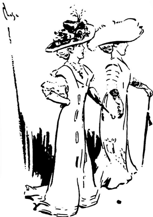
“AIN'T YOU GOT A NICE DUET FOR TWO LADIES?”