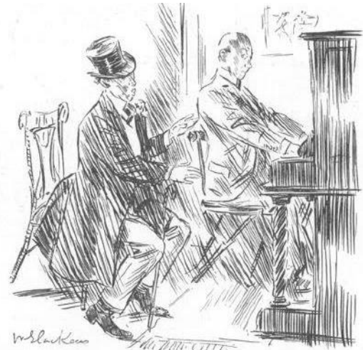
A Rehearsal in the Private Room.

(Right) Vignettes of the Tin Pan Alley streetscape and publishers' offices, William Glackens, Harper's Weekly XLIV, December 8, 1900