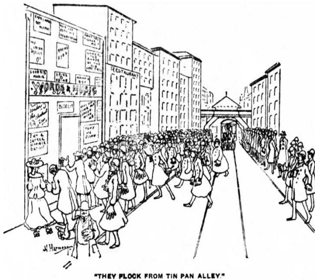
"THEY FLOCK FROM TIN PAN ALLEY."