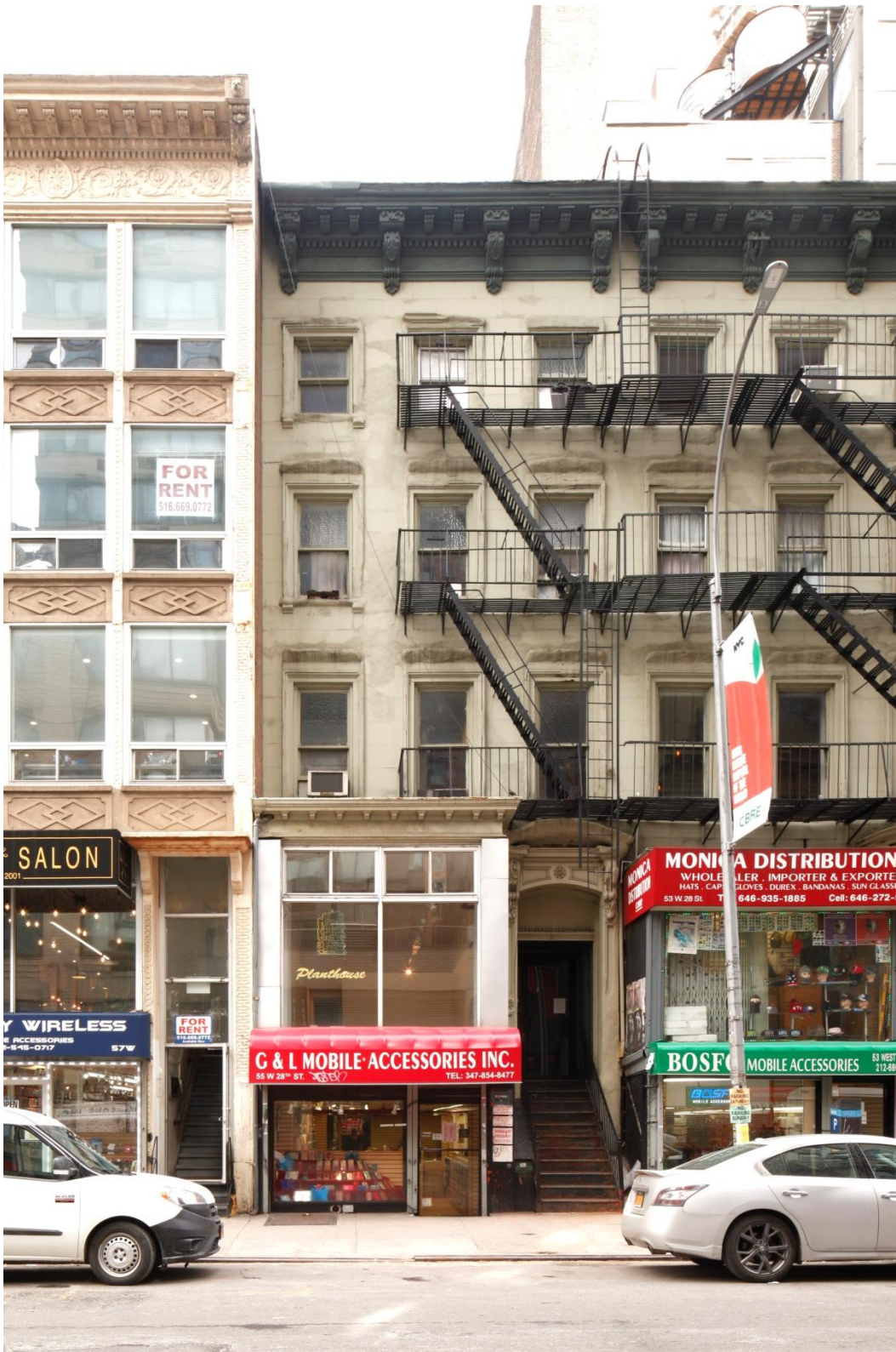
55 West 28th Street, Landmarks Preservation Commission, 2019