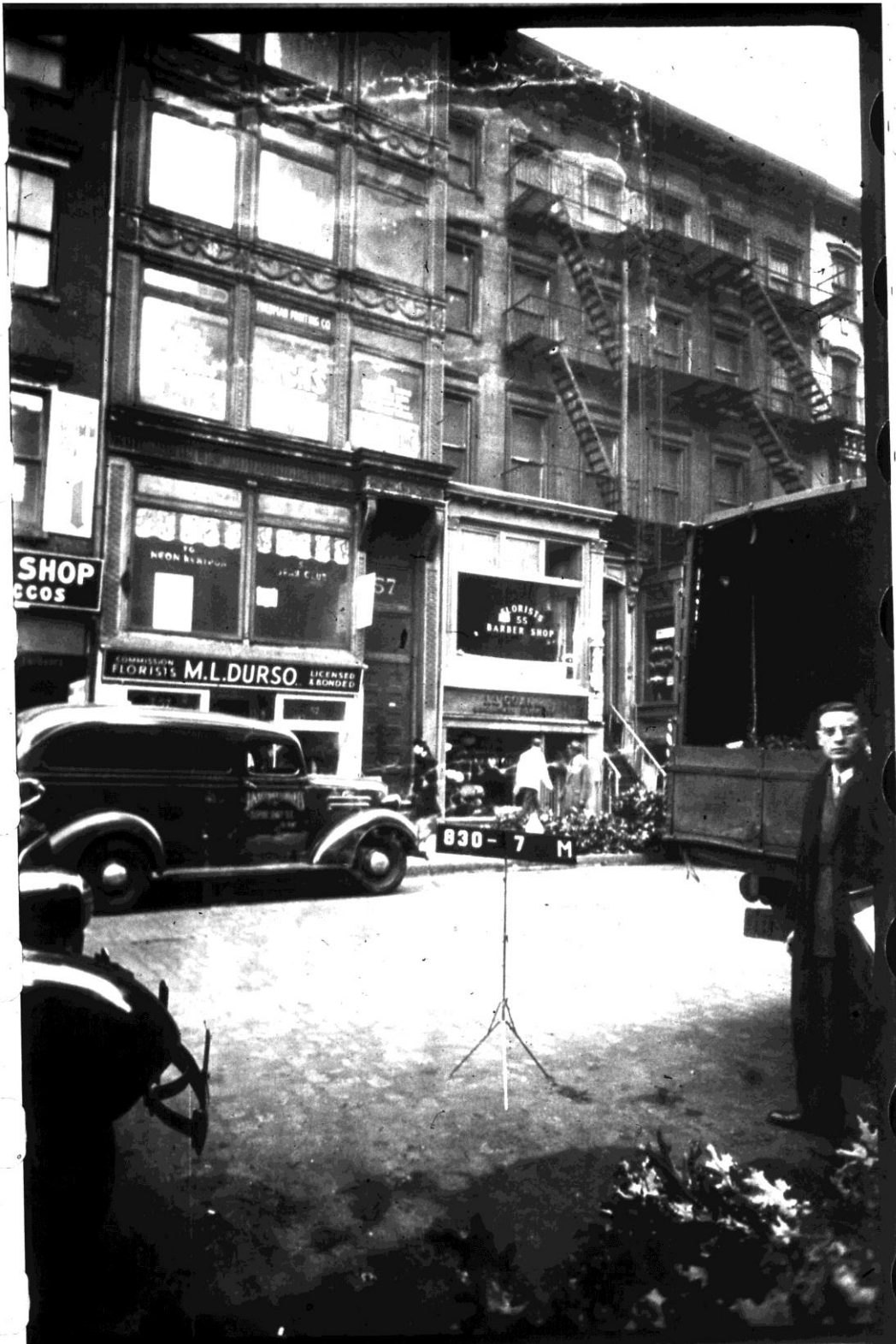
New York City Department of Taxes Photograph (c. 1938-43)