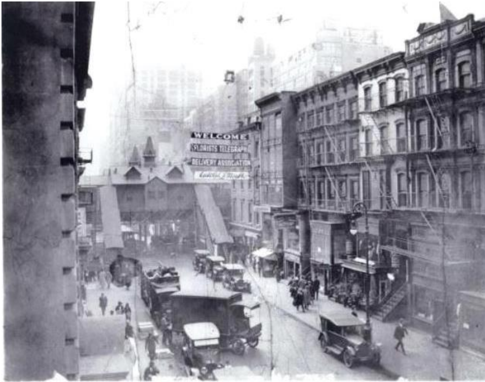
Banners welcome the Florists' Telegraph Delivery Association to West 28th Street in 1920