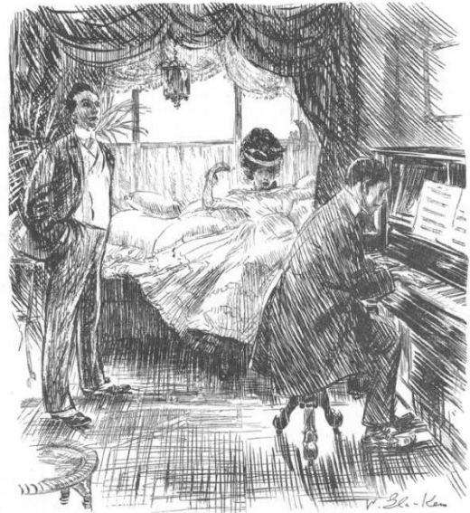
"In the exclusive Music-Room sits the Singer, critically listening."

There are an office and a reception-room, a music-chamber where songs are tried, and a stock-room. Perhaps, in case of the larger publishers, the music-rooms are two or three, but the air of each is much the same. Rugs, divans, imitation palms, make this publishing-house more studio, however, than office. A boy or two serve to bring professional copies at a word. A salaried pianist or two wait to run over pieces which the singer may desire to hear. Arrangers wait to make orchestrations or take down the melody which the popular composer cannot play. ... Into these parlors come the mixed company to this distinctive world—authors who have or have not succeeded; variety-artists who have some