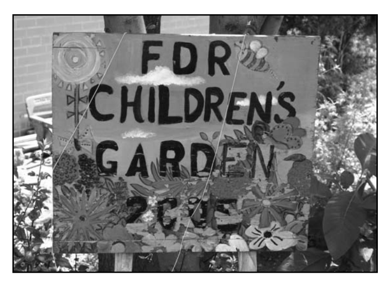
GOLDEN APPLE AWARDS PHOTOS

St. Joseph Hill Academy H.S., Staten Island, Team Up to Clean Up