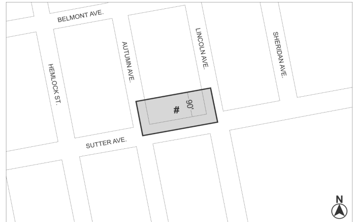
■ Mandatory Inclusionary Housing Area (see Section 23-154(d)(3)) Area # — [date of adoption] — MIH Program Option 1 and Option 2

Portion of Community District 5, Brooklyn