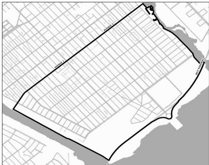
Map 3 Neighborhood Recovery Area in Brooklyn Community District 18