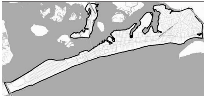
Map 6 Neighborhood Recovery Area in Queens Community District 14