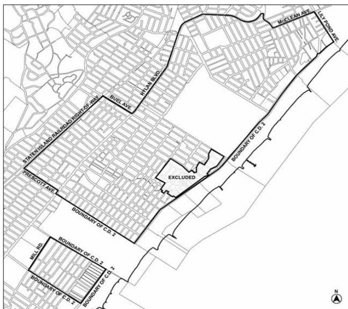
Map 7 Neighborhood Recovery Areas in Staten Island Community District 2

Areas designated by New York State as part of the NYS Enhanced Buyout Area Program are excluded from the neighborhood recovery areas and are designated on this map as "Excluded"