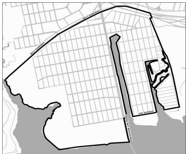
Map 4 Neighborhood Recovery Area in Queens Community District 10