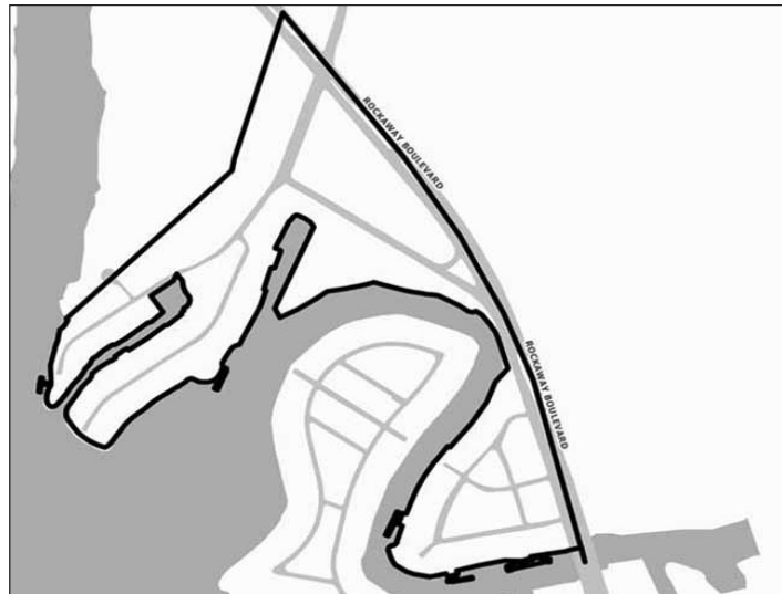
Map 5 Neighborhood Recovery Area in Queens Community District 13