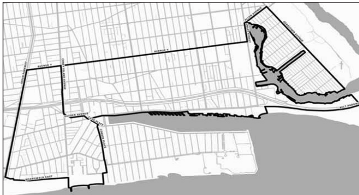
Map 2 Neighborhood Recovery Areas in Brooklyn Community Districts 13 and 15