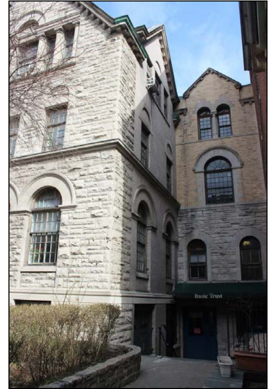
St. Michael's Parish House 225 West 99 th Street, Block 1871 Lot 29