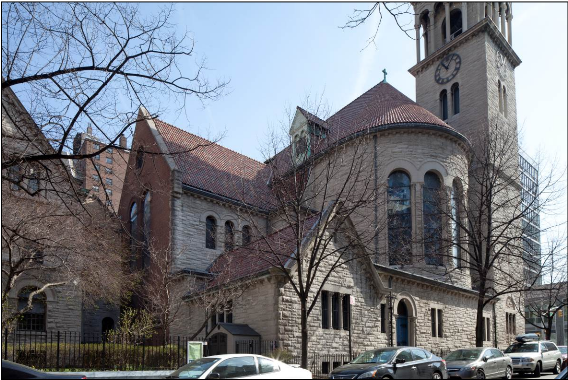
St. Michael's Church, south and west elevations