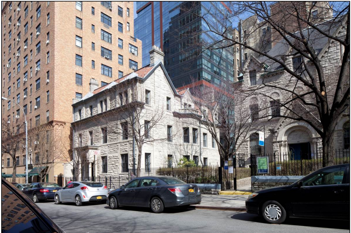
St. Michael's Rectory 227 West 99 th Street, Block 1871 Lot 24