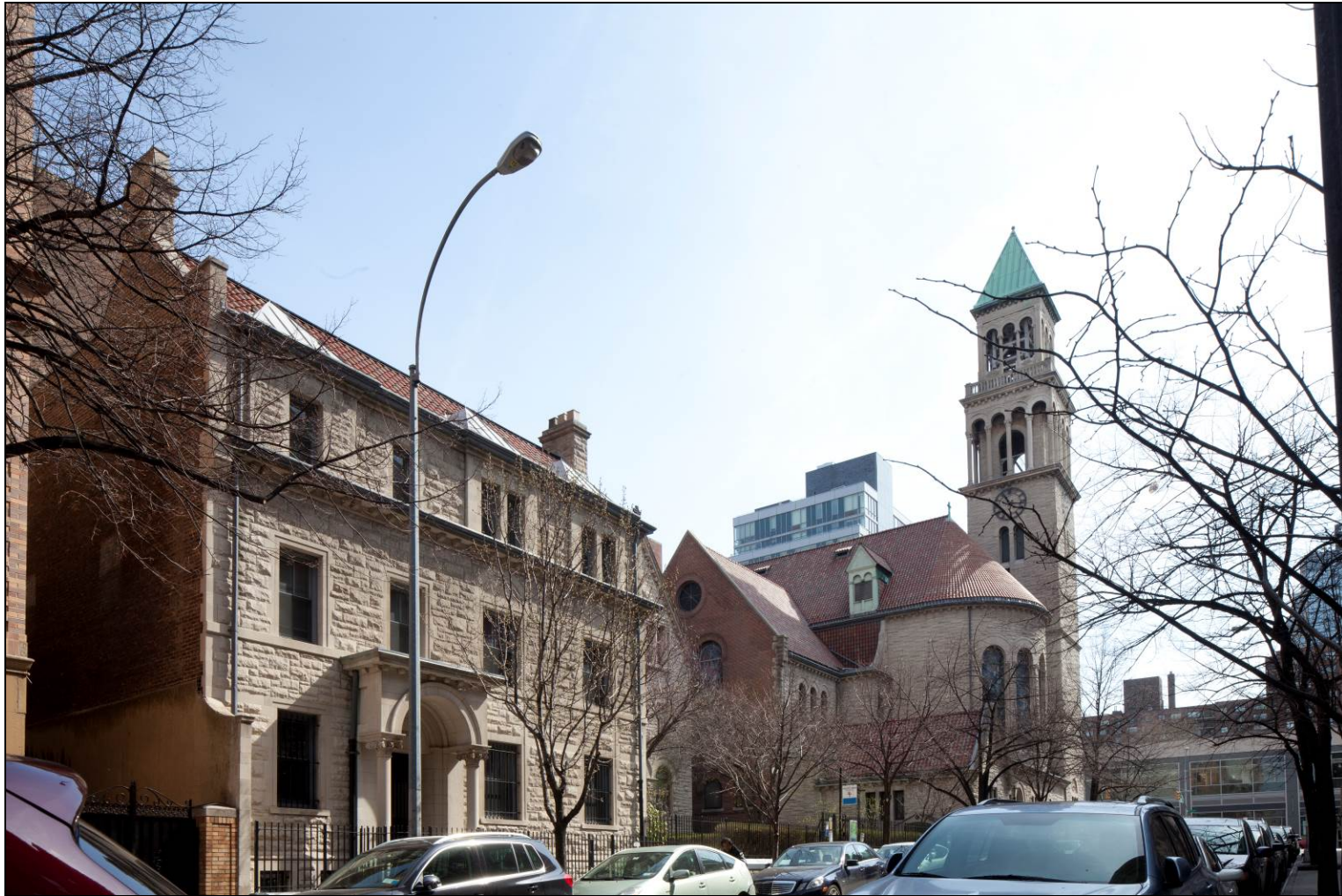
St. Michael's Episcopal Church Complex