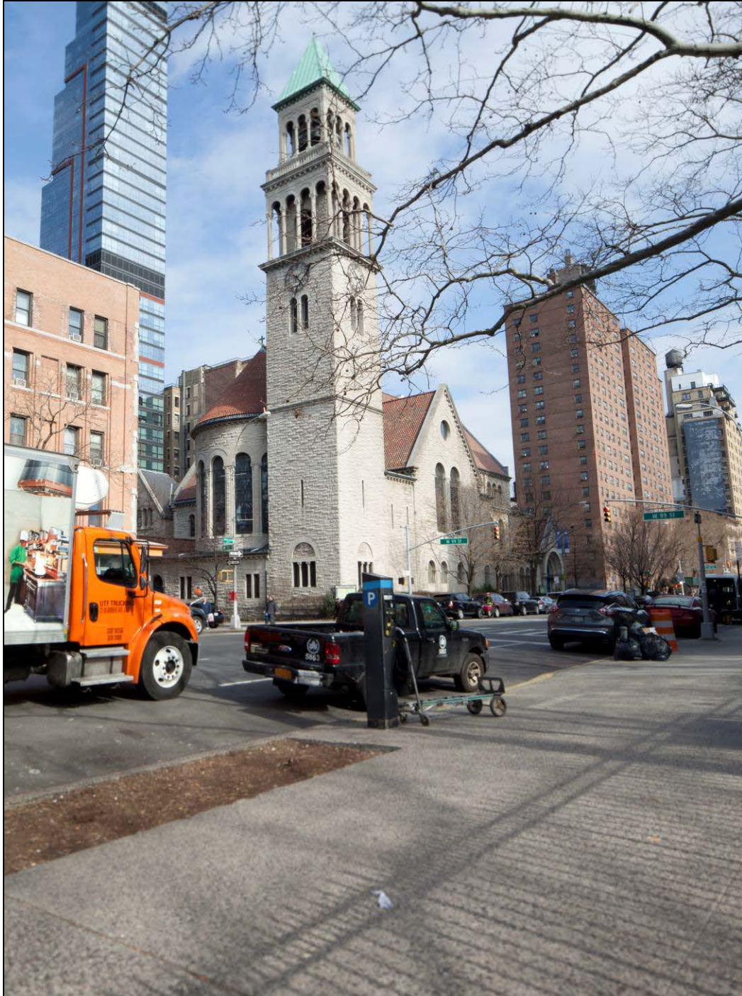
St. Michael's Church 201 West 99 th Street (aka 800-812 Amsterdam Avenue) Block 1871, Lot 29 Photograph: Marianne S. Percival, 2016