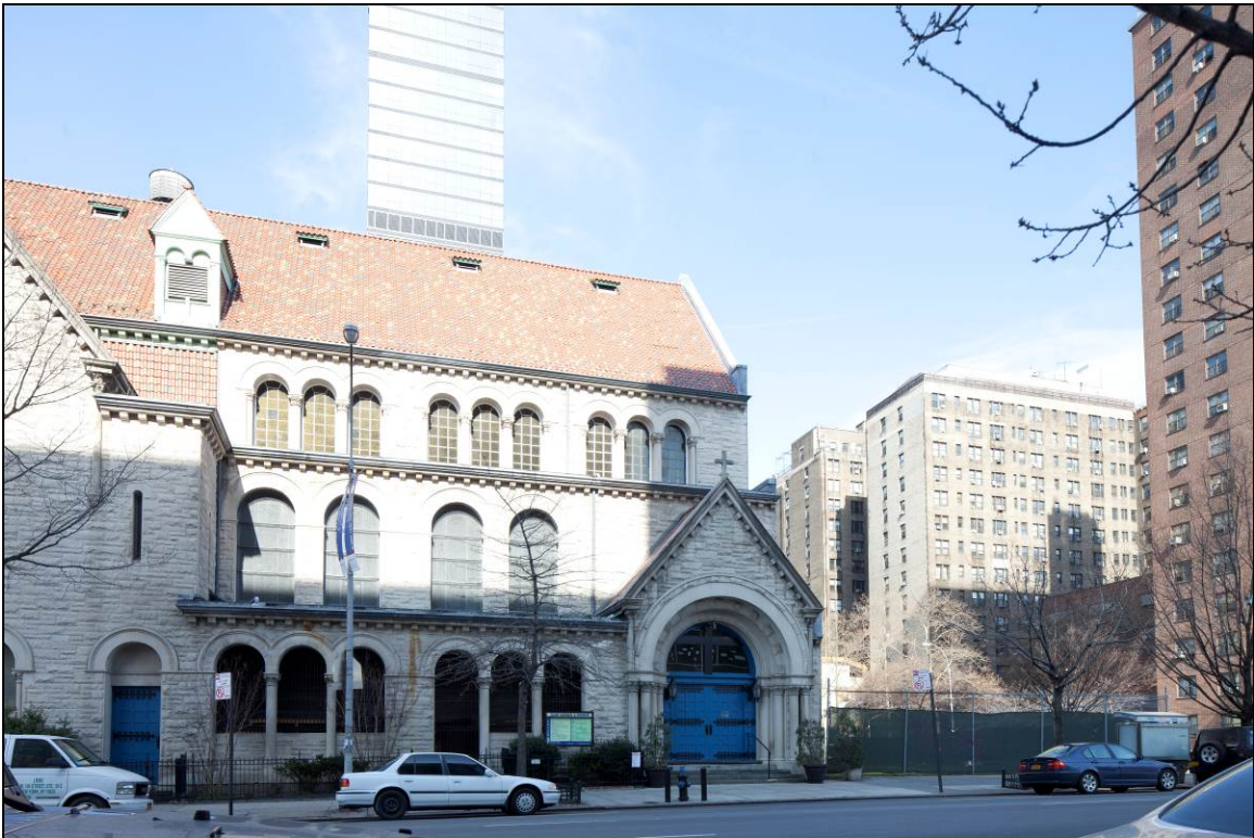
St. Michael's Church, east elevation