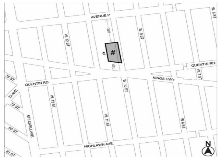
Mandatory Inclusionary Housing Area see Section 23-154(d)(3)

Area # — [date of adoption] — MIH Program Option 1 and Option 2