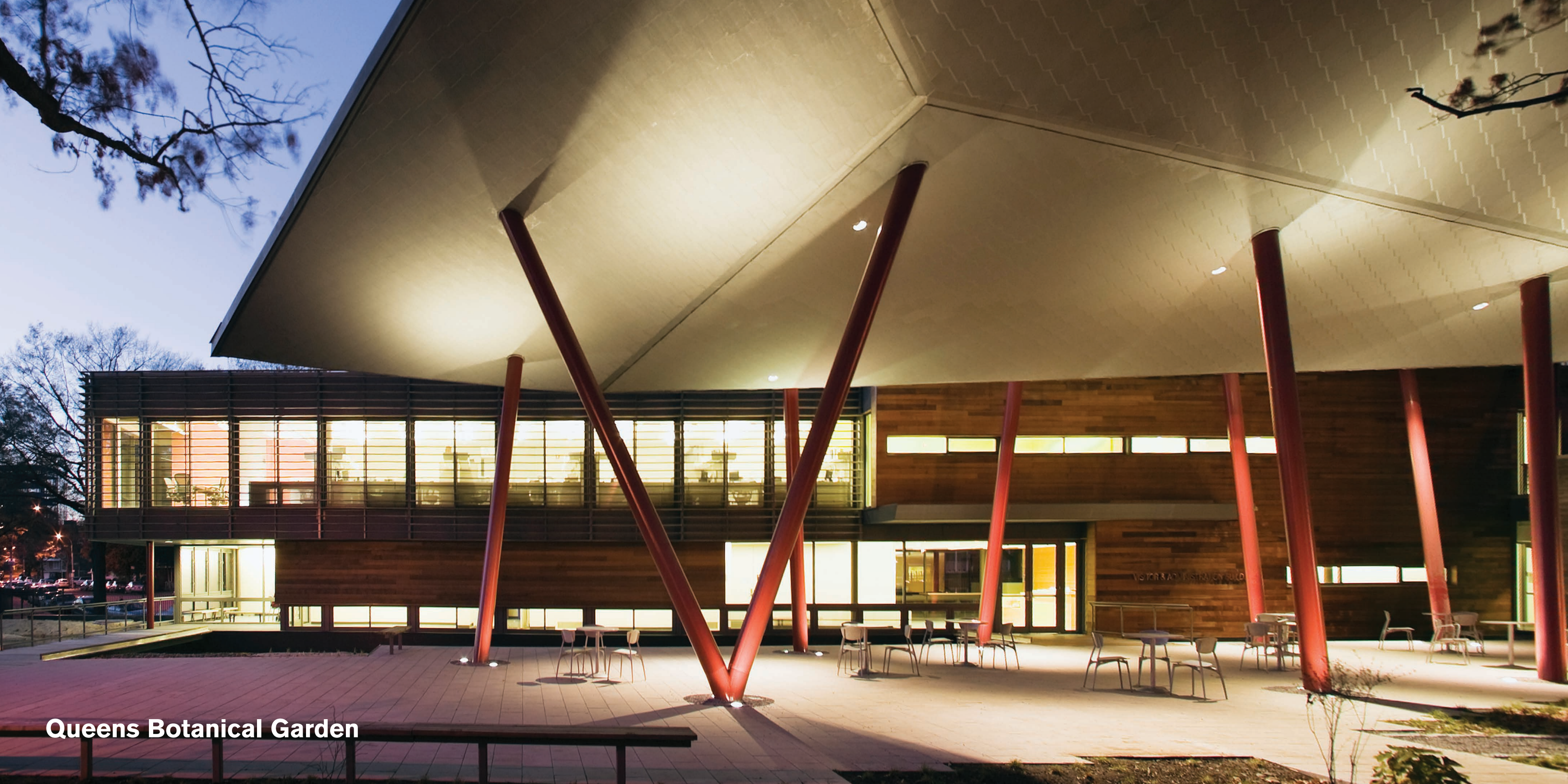
Queens Botanical Garden