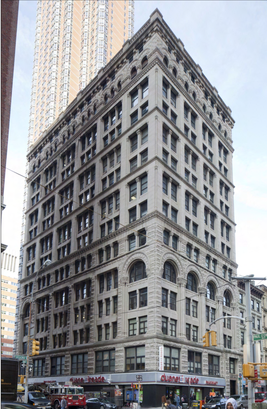
Mutual Reserve Building , 305 Broadway, Manhattan