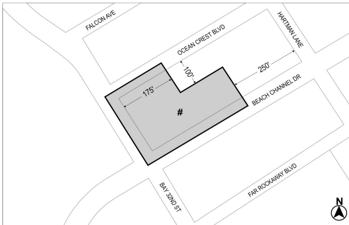
█ Mandatory Inclusionary Housing Program Area see Section 23-154(d)(3) Area # — [date of adoption] MIH Program Option 1

Portion of Community District 14, Queens