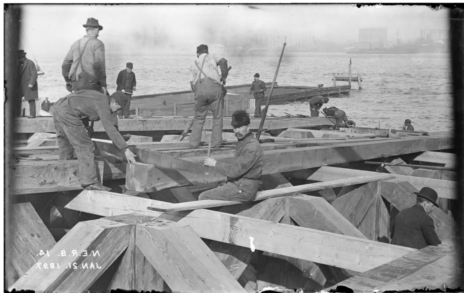
Construction of wooden caisson for New East River Bridge tower (Williamsburg Bridge), January 21, 1897.