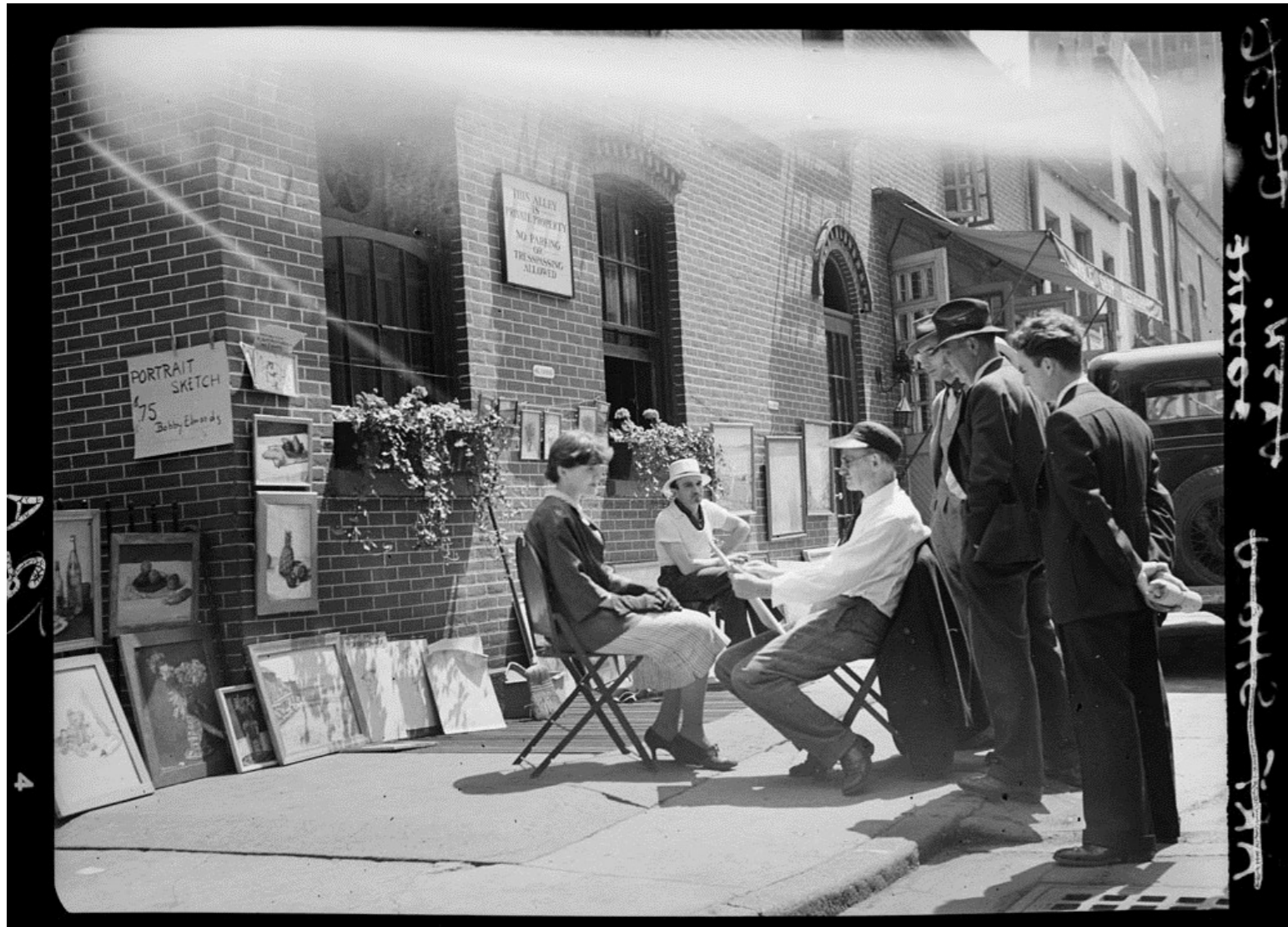
Washington Square Open Air Art Show, 1935-1941, WPA Federal Writers Project