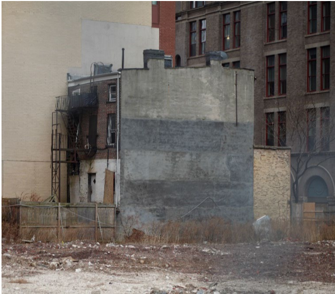
North Facade 227 Duffield Street Brooklyn