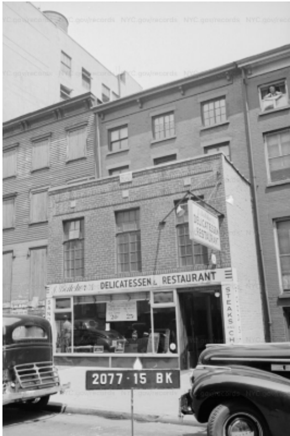
227 Duffield Street 1940s