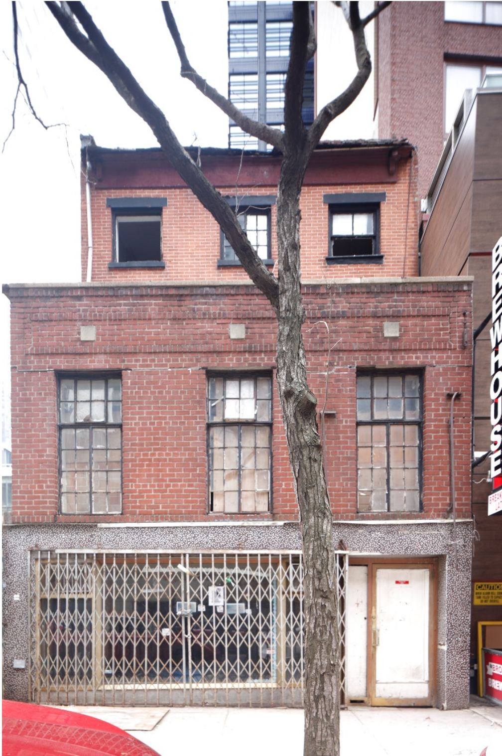
Front Facade, 227 Duffield Street, Brooklyn