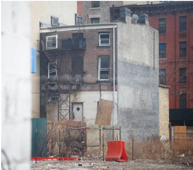
Rear Facade (East) 227 Duffield Street, Brooklyn Jessica Baldwin, January 2021