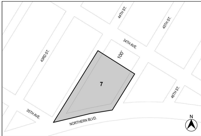
■ Mandatory Inclusionary Housing area see Section 23-154(d)(3) Area 7 – [date of adoption], MIH Program Option 1 and Option 2

Portion of Community District 1, Borough of Queens