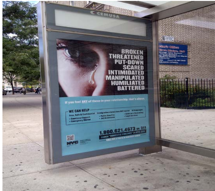
“That’s Abuse” Bus Shelter Poster