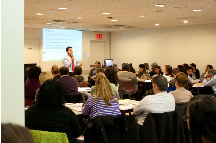
Department of Education Language Access Coordinator Training Session