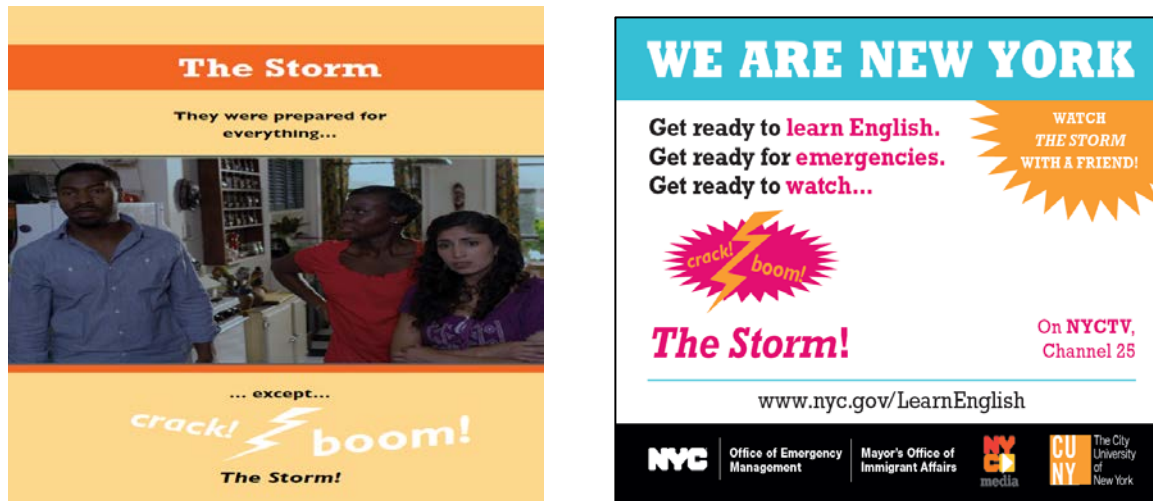
The Storm/We are New York Marketing Posters

The episode produced by NYC Citizen Corps, called " The Storm ," focuses on emergency preparedness and access to City resources during emergencies. The episode is accompanied by various learning materials for beginner and intermediate English-language learners, including a toolkit developed by OEM for use in English for Speakers of Other Languages (ESOL) classrooms and informal conversation groups and by community leaders and community-based organizations.