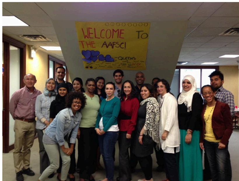
Arab American Family Support Center (AAFSC) Staff

Preventive providers with specialized cultural and linguistic expertise include the Arab American Family Support Center (AAFSC). AAFSC has been a leader in providing culturally-sensitive services to meet the needs of Arab, Middle Eastern, Muslim and South Asian (AMEMSA) immigrants in New York City. They serve nearly 6,000 low-income people annually through seven major programs: Adult Education & Literacy Program, the Youth Program, Anti-Violence Program, Preventive Service Program, Health Program, Legal Services Program and the Disaster Relief Program.