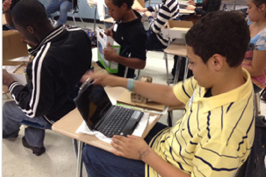
Student Using a Computer Provided through NYC Connected

Initially funded by the Broadband Technology Opportunities Program (BTOP), NYC Connected Communities has received city funding to continue its efforts to increase broadband adoption and provide public computer resources across all five boroughs of New York City. The program's 100 centers, with 1,738 workstations, have offered more than 3 million user sessions.