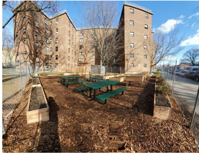
NYCHA Pelham Parkway – After

In 2020, CD funded 17 positions, of which 13 were active. CD also funded food, garden materials, and office and storage supplies.