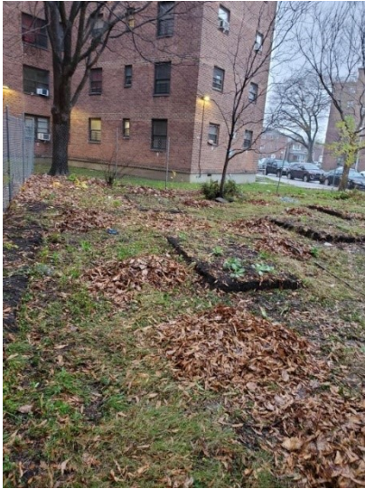
NYCHA Pelham Parkway – Before