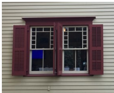
Lewis H. Latimer House – After