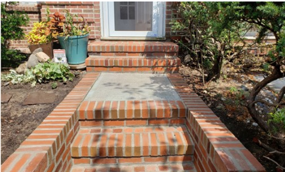
Jackson Heights Historic District - After

Work Scope: CD-funded work involved reconstructing the brick staircase, installing two sets of metal railings, and replacing the copper gutters at the façade. Work was complete and final payment was made in 2020.