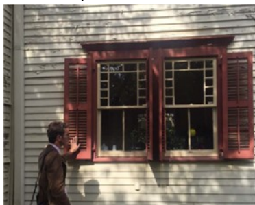
Lewis H. Latimer House – Before

Work Scope: The project involved the restoration and reinstallation of one original historic window and seven replicates for a total of eight windows. The work was completed in 2019 and final payment was made in 2020. Please see before and after photos below: