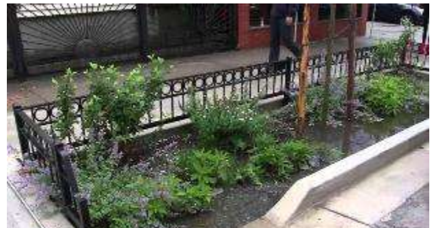
Curbside Rain Garden (Bioswale)

DEP has initially focused primarily on the Area-wide right-of-way contracts building curbside rain gardens, infiltration basins, Stormwater Greenstreets, and porous paving. DEP's standardized designs and procedures have been critical to supporting the systematic implementation of green infrastructure at a wide scale. DEP expects to continue green infrastructure implementation using an expanded array of tools. While right-of-way implementation has been the greatest focus of the first decade of the Program, DEP is making significant advancements into other implementation areas as well,