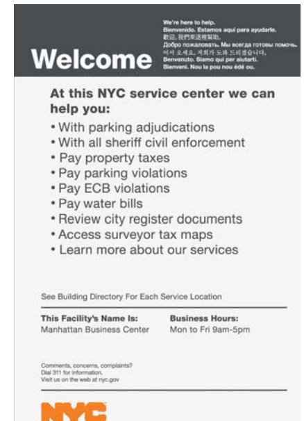
Standardized signage template

For more information contact Craig Hosang at chosang@cityhall.nyc.gov .