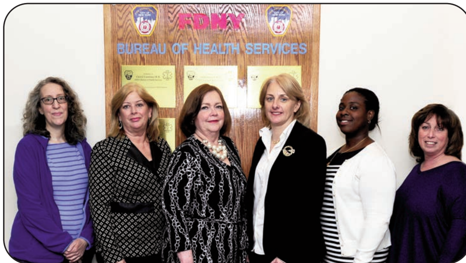
WTC CANCER CARE GROUP Bureau of Health Services