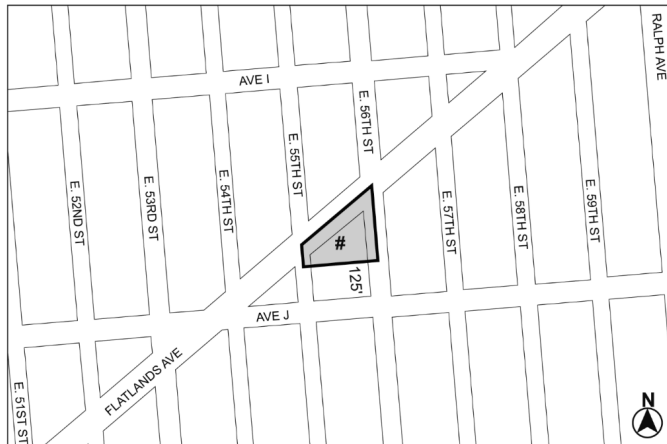
Map 1 – [date of adoption] Portion of Community District 18, Brooklyn