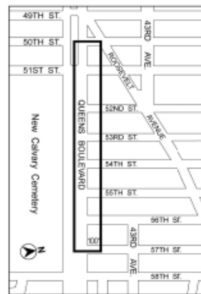
Map 1 - (NEW Map 1, Showing the Extension of the Existing Inclusionary Housing District)

* * * Queens Queens Community District 2 In the R7X Districts within the areas shown on the following Maps 1 and 2: Map 1 - (Existing map 1 to be deleted)