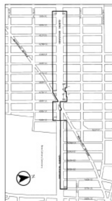
Portion of Community District 2, Queens

* * * SUNNYSIDE/WOODSIDE REZONING QUEENS CB - 2 N 110209 ZRQ Application submitted by the Department of City Planning pursuant to Section 201 of the New York City Charter, for an amendment of the Zoning Resolution of the City of New York, concerning Article 1, Chapter 4 (Sidewalk Café Regulations), relating to the types of sidewalk cafés permitted along portions of Skillman Avenue and Queens Boulevard located in Community District 2, Queens.