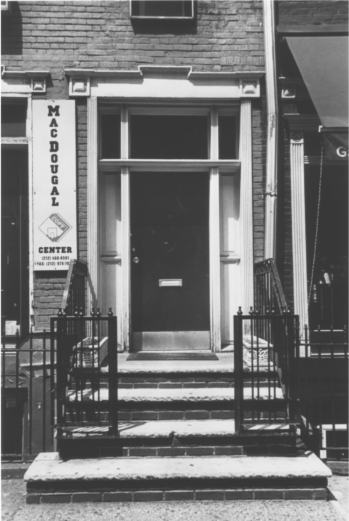
127 MacDougal Street House, entrance