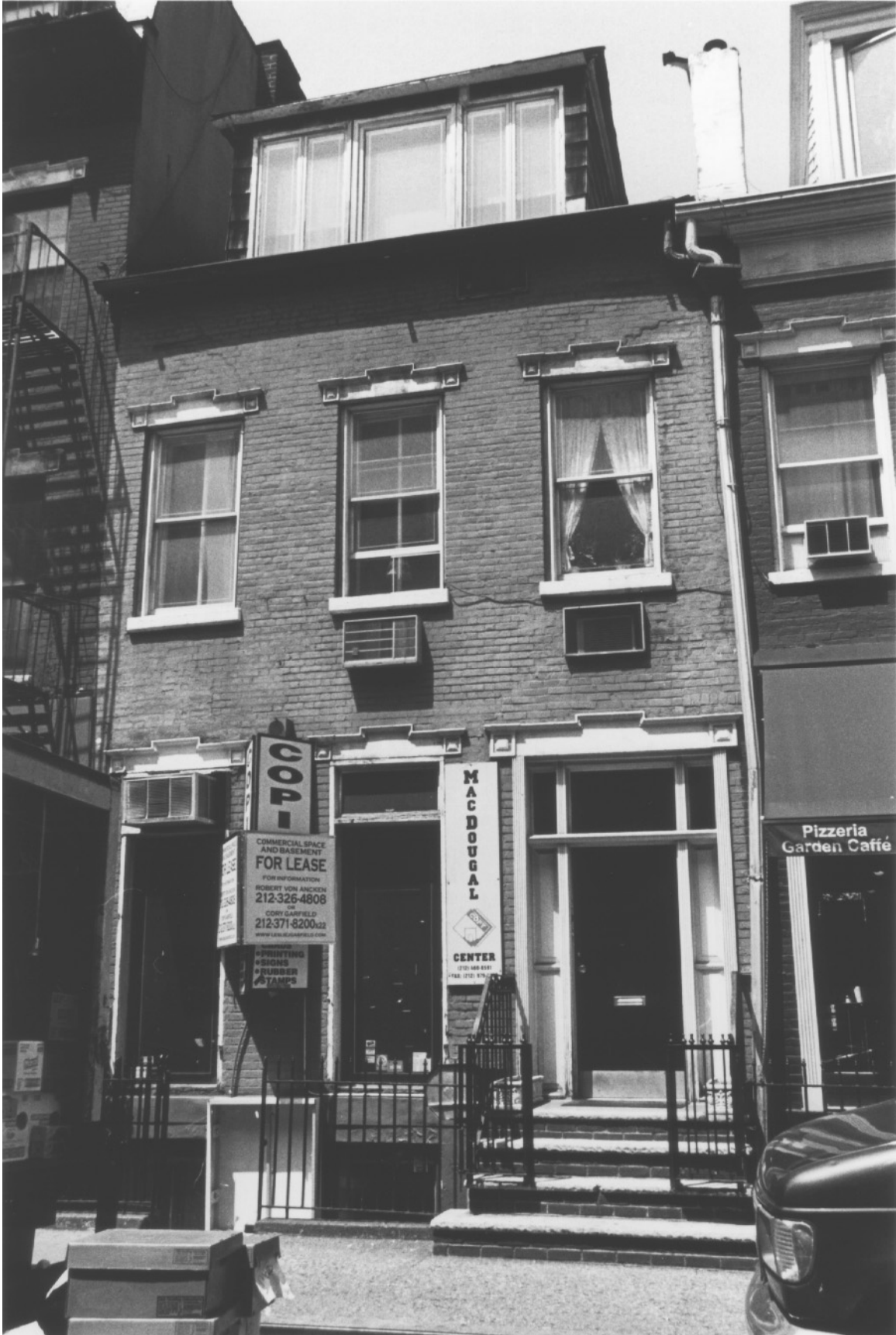
127 MacDougal Street House