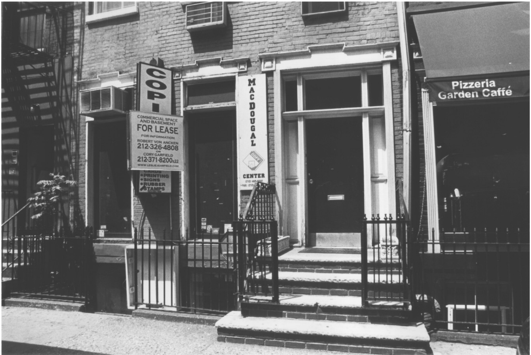
127 MacDougal Street House, first story