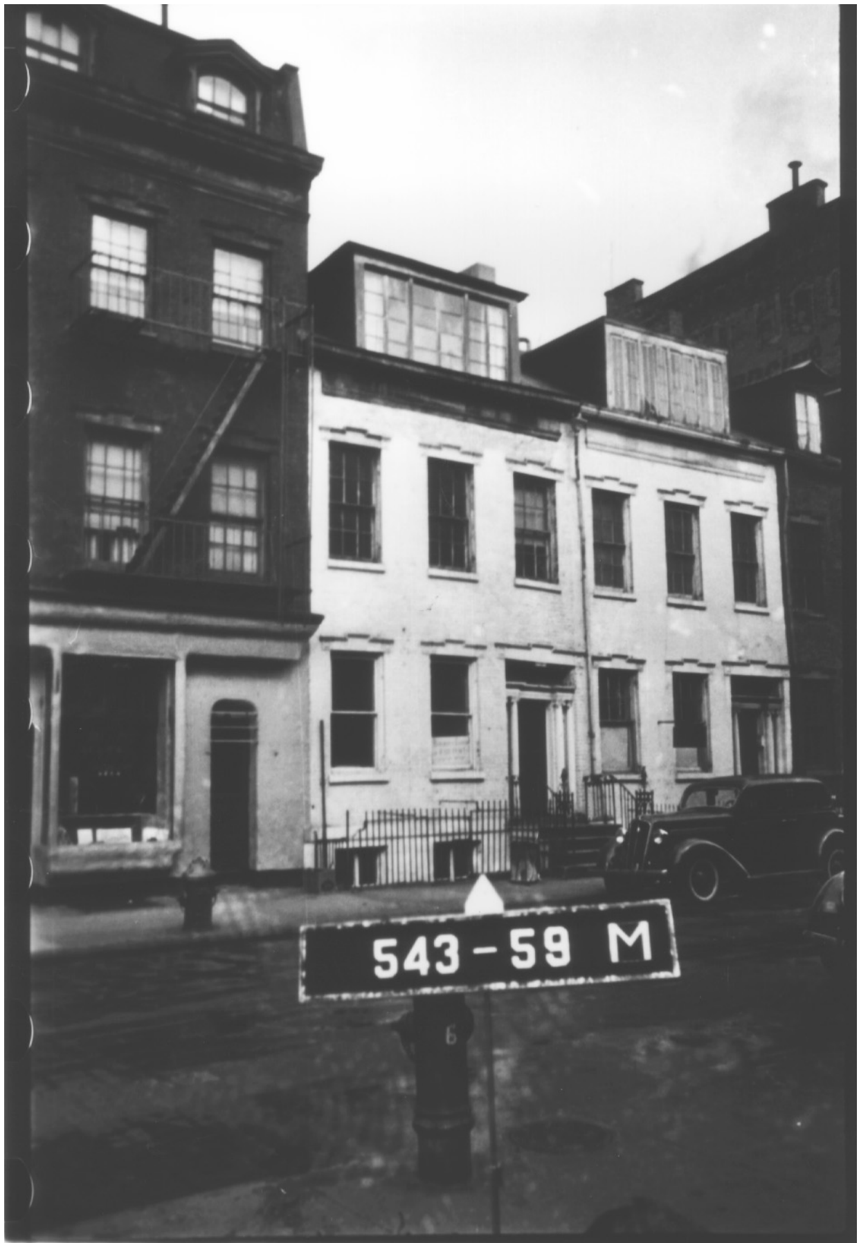
127 MacDougal Street House