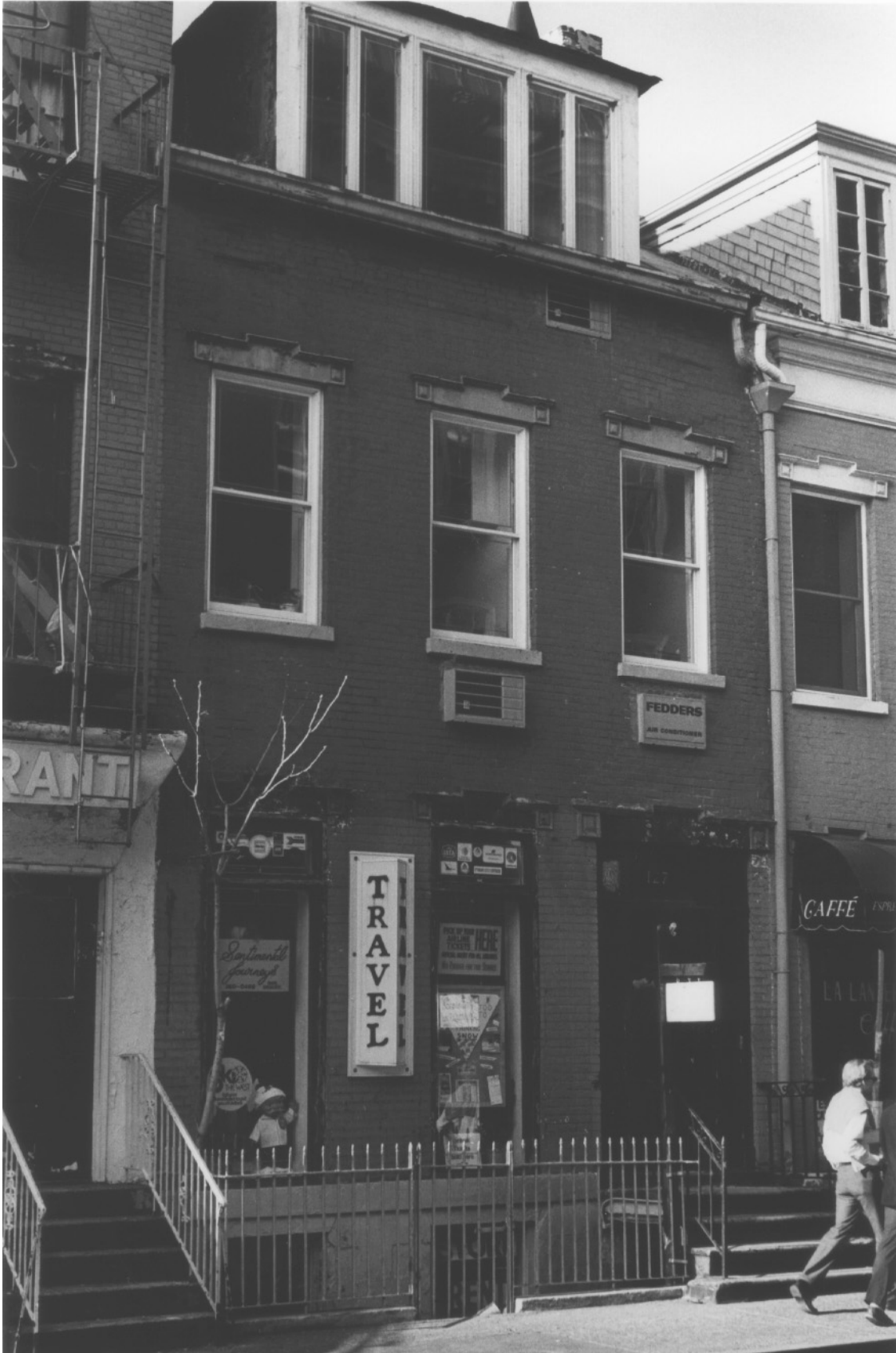
127 MacDougal Street House