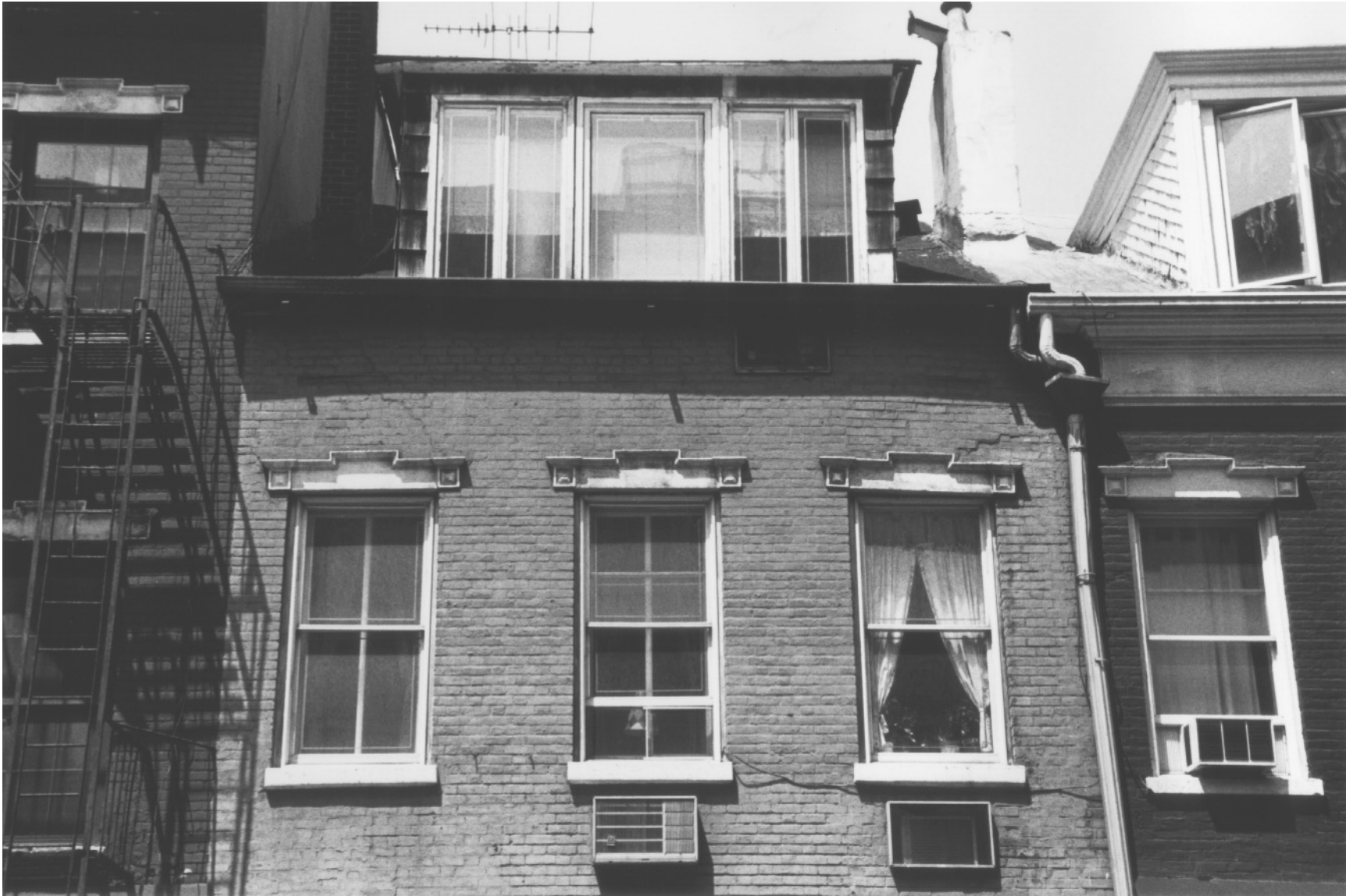
127 MacDougal Street House, upper section