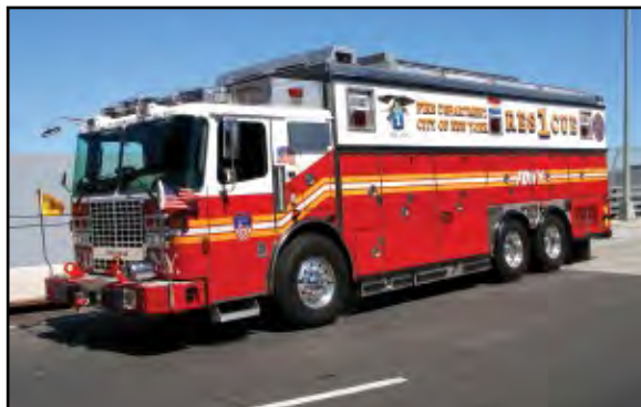
Rescue 1 apparatus.

The members of Rescue 1 operated for approximately four hours in a dangerous, precarious building collapse site, with a constant threat of secondary collapse, to rescue a trapped worker. Through teamwork, cooperation and training, the members effected this rescue. For their outstanding actions, the above-listed Rescue 1 members are awarded the Firefighter Thomas R. Elsasser Memorial Medal.—AP