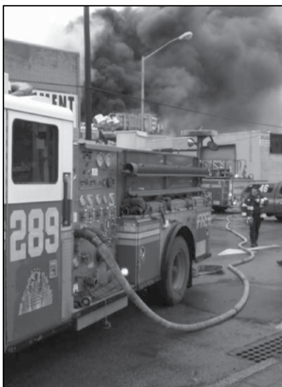
Queens Box 33-9305, 126-12 34th Avenue/126th Place, April 1, 2011.