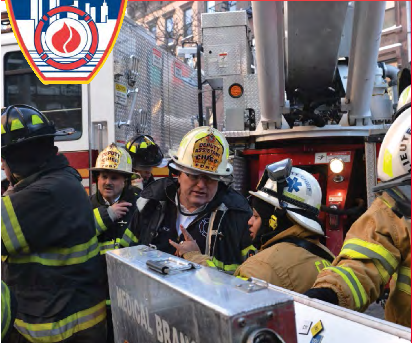
Fire and EMS personnel operate at Manhattan Box 44-0871, January 24, 2016.