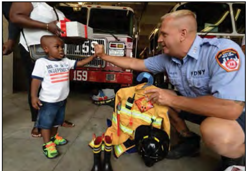
Rescuer and rescuee reunite at Ladder 159's firehouse.