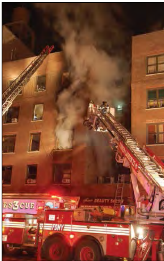
Rescue 3 operates at Manhattan Box 44-1745, January 23, 2013.