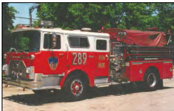
Engine 289 apparatus.

Engine 289 members stabilized the victim, extricated and removed the man to the safety of the subway car, without specialized equipment or additional staffing. Courage and bravery under difficult circumstances, quick thinking and teamwork easily describe the actions taken by Engine 289 members during this extremely difficult operation. The Department is proud to present the Lieutenant James Curran/New York Firefighters Burn Center Foundation Medal to the members of Engine 289.—APM