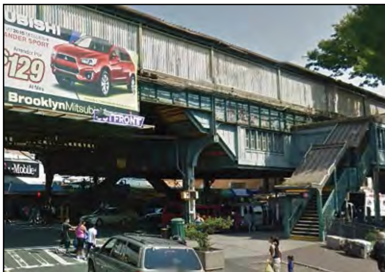
The elevated 7 train tracks in Queens at 103rd Street and Roosevelt Avenue.