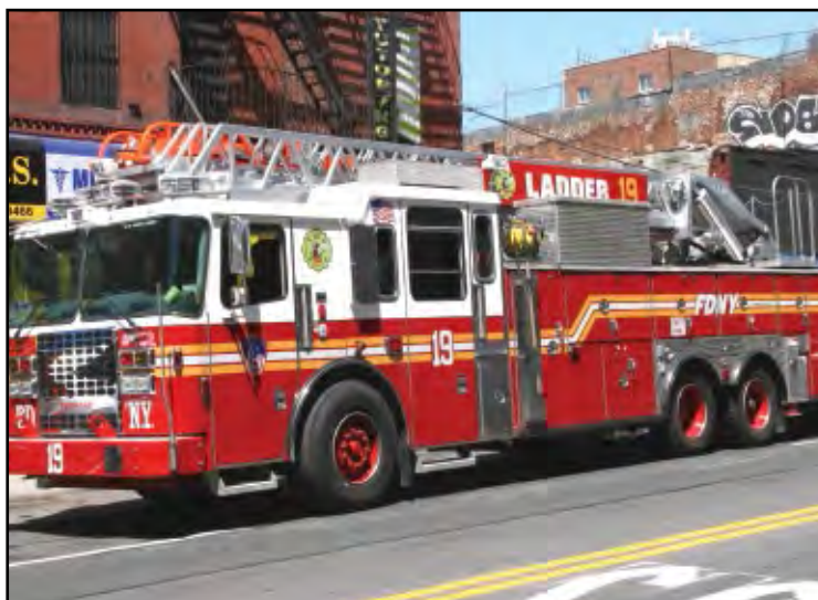
Ladder 19 apparatus.