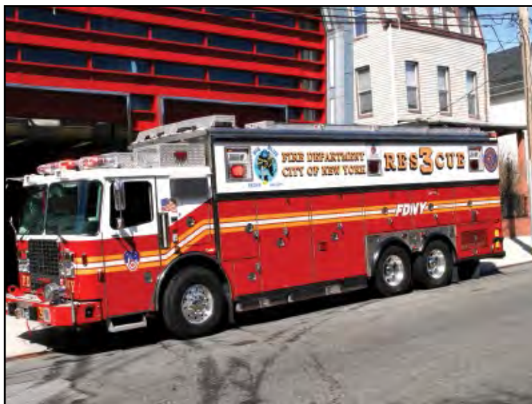
Rescue 3 apparatus.

The camera revealed a female victim in the water, approximately 30 yards from the bulkhead, in the middle of the channel, hanging onto the south pillion (pad or cushion) of the bridge. The air temperature was 33 degrees, while the water temperature was a slightly warmer 38 degrees. The river was moving at a steady three knots and large sheets of ice were flowing south with the current. The victim’s head was just above the surface and she was unable to call out due to advancing hypothermia.