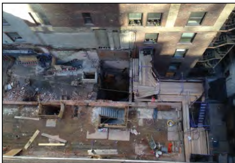
Aerial view of both buildings under demolition showing collapse in the rear section of the building.