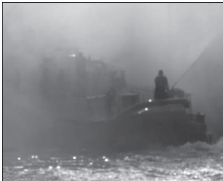
Marine 6 battles both the blaze and near-zero visibility, at Manhattan Box 0913, September 4, 2010.