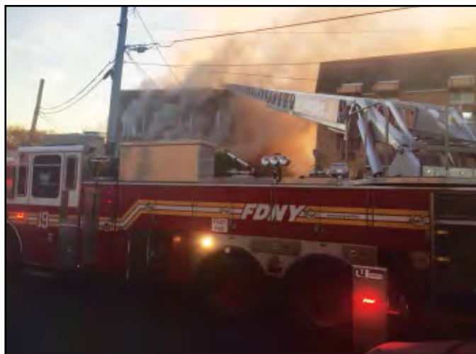
Ladder 19 operating at Box 22-1428 in the Bronx on November 26, 2015.