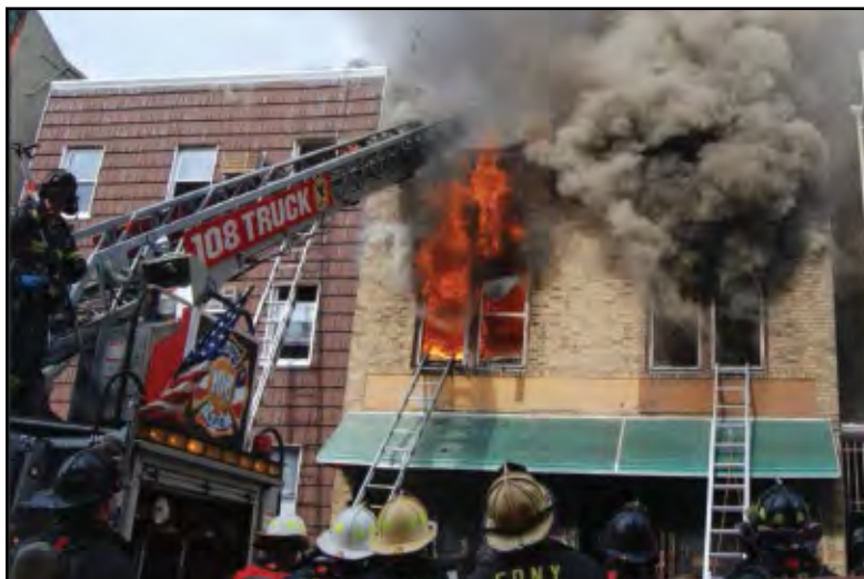
Ladder 108 operates at Brooklyn Box 33-0138, February 7, 2011.