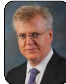
FRANCIS X. GRIBBON Public Information