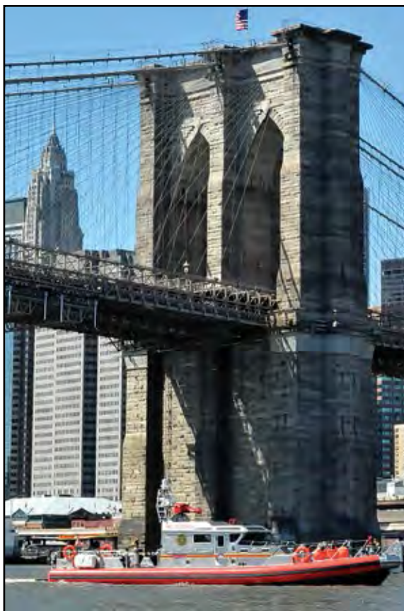
Fireboat Bravest steams under Brooklyn Bridge.