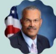
ASAMBLEÍSTA JEFFRION AUBRY