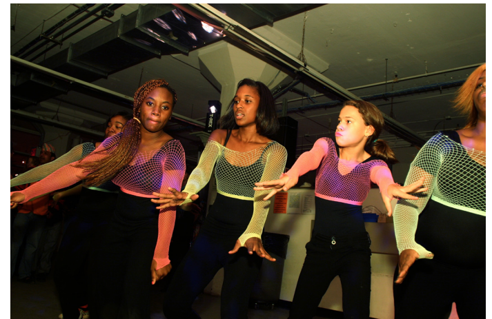
Dancers from Groove With Me performing at the 2011 Masked Marvelous Cocktail Party.