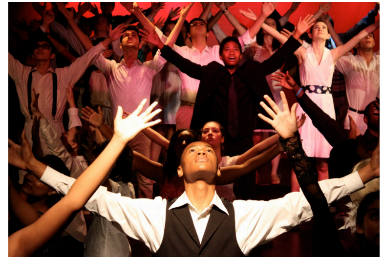
Wingspan Arts Summer Conservatory production of Ragtime.

Wingspan Arts has been an MFTA recipient since 2003, and visited the warehouse four times in 2011. The Wingspan Summer Conservatory is an annual program where 75 students learn theater arts from industry professionals at no cost. Students are involved in every aspect of production. Using fabric, furniture, frames, and props from MFTA, students learned how reusable items can be transformed into sets and costumes. Wingspan Arts is one of MFTA's many recipients that offer valuable educational experiences for New York City students.