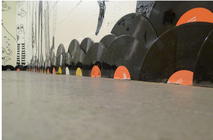
Detail of Creative Reuse in NYC showing Block Party (2011) by MFTA recipient Local Project.

In 2011, the Education Center expanded its outreach to artists with the Materials for the Arts Gallery program. The MFTA Gallery doubles as both an exhibition space and a teaching tool. Works on view incorporate items from the warehouse and show thousands of visitors to MFTA what can be created through reuse. The gallery's inaugural exhibition featured MFTA recipient YOUNITY Arts, a Queens-based artist collective, and was on view through October 7, 2011. The follow up show, Creative Reuse in New York City , opened on October 18, 2011. This exhibition featured work from three MFTA recipients: Local Project, Flux Factory, and Free Style Arts Association. The Education Center offered several public programs related to this exhibition, including a reception, an artists' panel discussion, and a featured artist studio workshop.