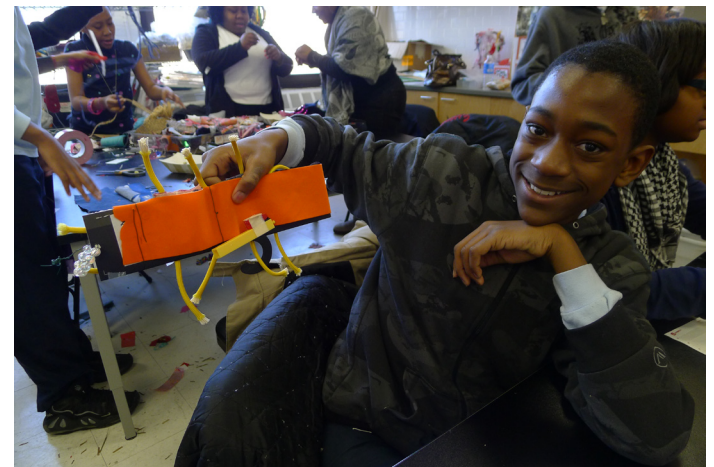
This student shows off his found object sculpture created at the Education Center.

The ever-changing MFTA warehouse inventory is an inspiration to Education Center staff as they plan 2012 programs that continue the mission of teaching all New Yorkers about creative reuse. The Education Center, a cornerstone initiative of Friends of MFTA, is made possible through private financial support.