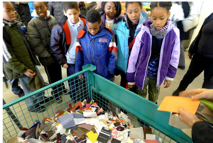
Students view a donation of Coach leather during a school group visit.

In 2011, Friends of MFTA funded a new full-time position in the Education Center, to increase outreach efforts. This resulted in a dramatic increase in educational offerings and student participation. Programming reached 3,896 students, 700 public school teachers, 272 community-based educators, and 1,433 members of the general public , including parents of New York City school children. MFTA hosted 89 group visits, welcoming students and educators to tour the warehouse and participate in hands-on creative reuse activities. Teaching artists led eight MFTA residencies at public schools and after-school programs. MFTA also offered 28 specialized professional development workshops and seven 36-hour “P Credit” courses (certified professional development courses for public school teachers). Education Center staff worked with consultants in math and English language arts to create curricula and professional development workshops to help educators link art-making and the Common Core standards, which New York State adopted in 2011.