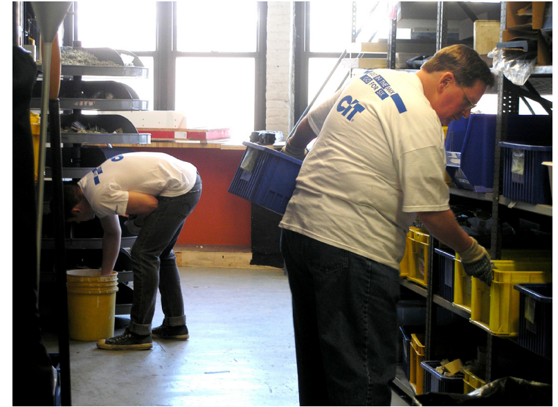
CIT volunteers working in the warehouse.