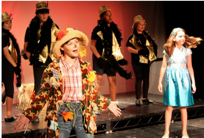
Wingspan Arts Summer Conservatory production of The Wizard of Oz.

Materials for the Arts membership keeps growing, with over 4,200 currently registered recipients. In 2011, 1,875 nonprofit organizations and public schools received items from MFTA for their arts programs. Recipients vary from independent theater organizations and music groups, to neighborhood after-school programs and art therapy programs, to performing arts centers and museums throughout New York City.