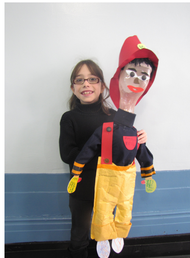
A student with her puppet created from an orange juice carton, a padded envelope, and MFTA supplies.