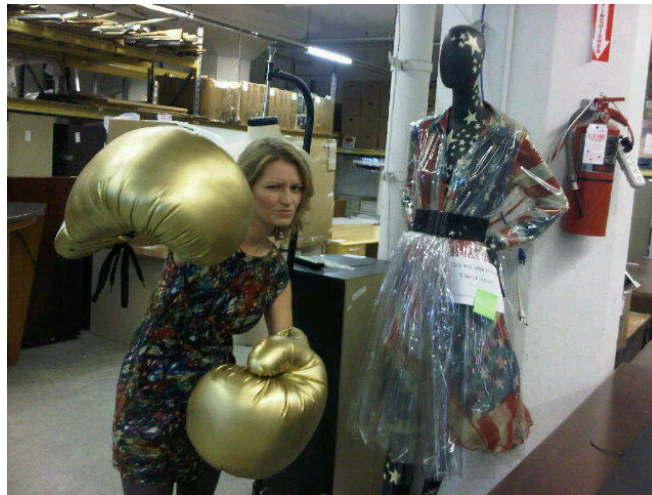
WNBC-TV's Katy Tur during her visit to the warehouse.

In 2011, Materials for the Arts was featured in the New York Times , NHK Television Japan , and Channel 4 NBC New York . MFTA was also covered on blogs such as Why Leave Astoria , Mother Nature Network , and Inhabitat New York .