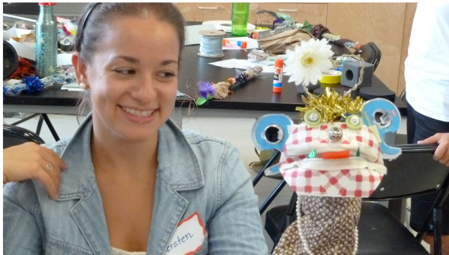
A teacher shows off her puppet created from a food tray, tape dispensers, and items from MFTA.

In 2011, Friends of MFTA created a school residency, with support from Waste Management of New York, to expand students' understanding of reuse. The residency program included a teacher workshop, 18 in-school art workshops, a family art activity, and an all-school assembly. MFTA was proud to host a residency at Growing Up Green and support their mission of empowering "children to be conscious, contributing members of their community through a rigorous curriculum and an engaging green culture."