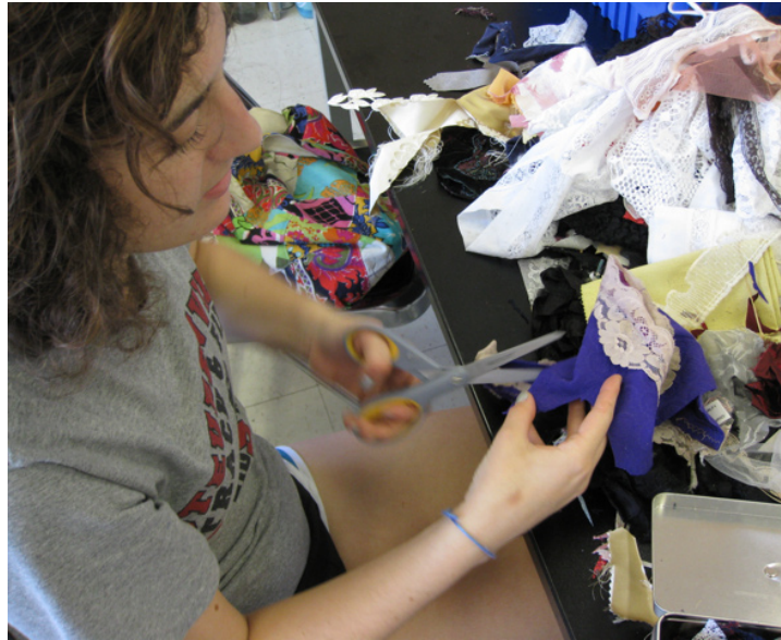
A volunteer prepares materials for the classroom.

Materials for the Arts provides meaningful job training opportunities for students from local high schools, individuals with special needs from day treatment programs such as AHRC and the Young Adult Institute (YAI), and retired and temporarily unemployed career professionals. A dedicated group of 188 volunteers and interns contributed 5,105 hours of their time to MFTA in the warehouse, classroom, and office in 2011. Providing on average an additional 98 hours of person power each week, the combined work of volunteers is equivalent to almost three full-time employees. MFTA also worked with several corporate volunteer groups, including CIT, Bank of America, and Macy's.