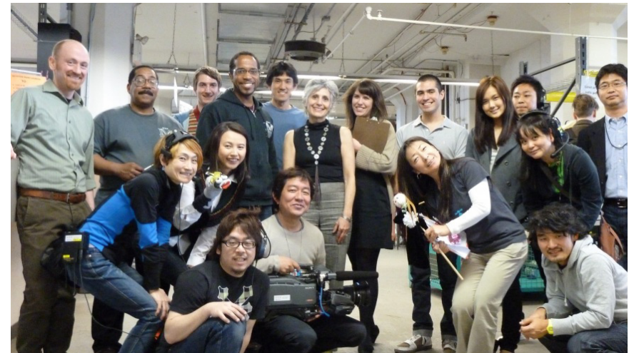
NHK and MFTA staff pose after the live broadcast to Japan.

MFTA increased its online presence and strengthened connections with recipients, donors, volunteers, and funders using Facebook, Twitter, and the MFTA blog. The blog, featuring artwork and events from MFTA recipients, saw 77,000 visits throughout 2011. MFTA saw increases in traffic and community interactions through its Twitter, which highlights current inventory and craft ideas, as well as its Facebook page, which offers a glimpse into the warehouse.