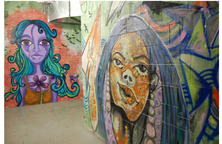
Murals by MFTA recipient YOUNITY Arts in the gallery.