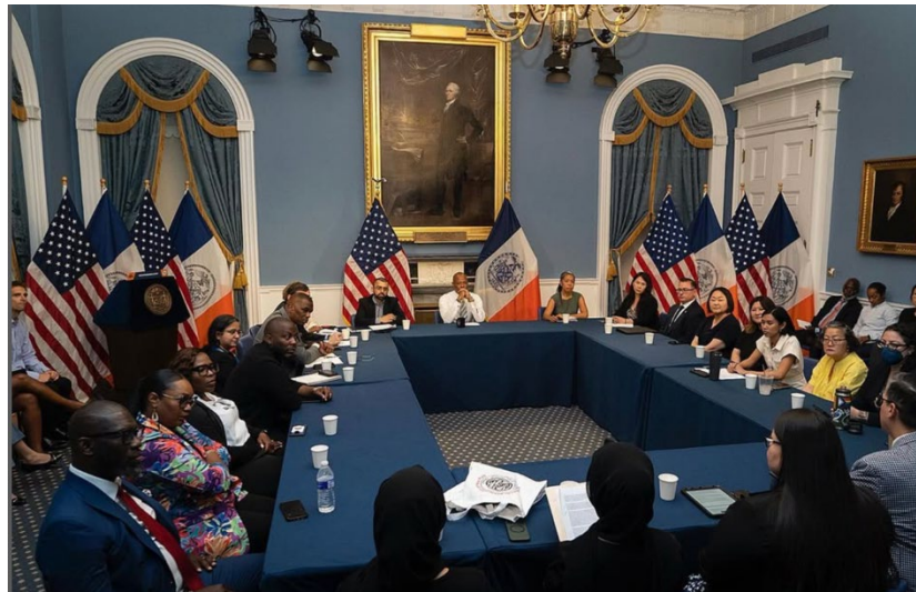
ABOVE: OPHC's Partners Against the Hate (P.A.T.H.) Initiative met with Mayor Eric Adams.

The P.A.T.H. Forward Initiative was launched in May 2021 and provides support to organizations that serve communities most vulnerable to bias and hate with funds for programs and services in the following areas: neighborhood safety, community relations, strategies to enhance hate crime reporting, education (including bystander intervention training), victim services, and data collection.