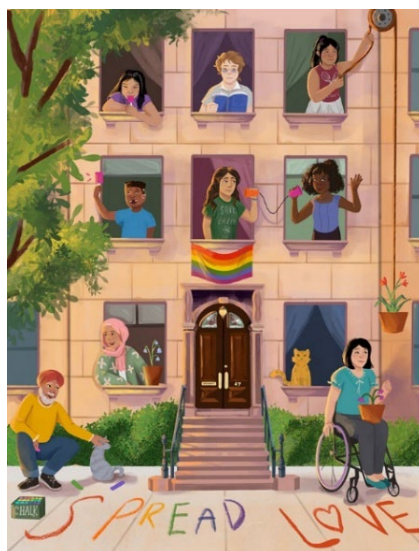
Grades 6-8: 1st Place Winner