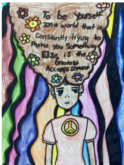
Grades 3-5: 1st Place Winner

OPHC launched its third annual “HeARTwork Against Hate” art contest and campaign for New York City youth. Participants in grades 3 – 12 shared their voices with communities citywide and used various artforms to express the positive values of respect, unity, and diversity. The campaign is a platform to support local students in building self-esteem and emotional well-being through creative expression.