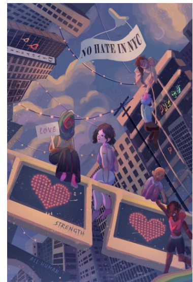
Grades 9-12: 1 st Place Winner