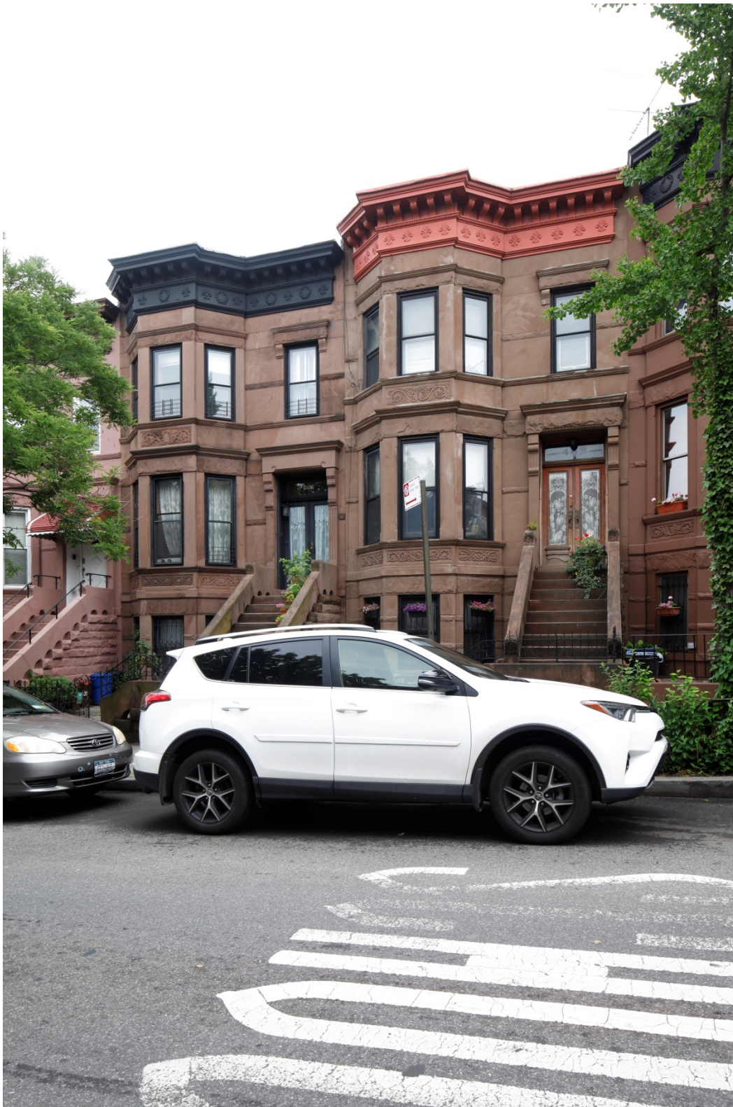
Figure 4 463 and 465 50th Street LPC, 2019