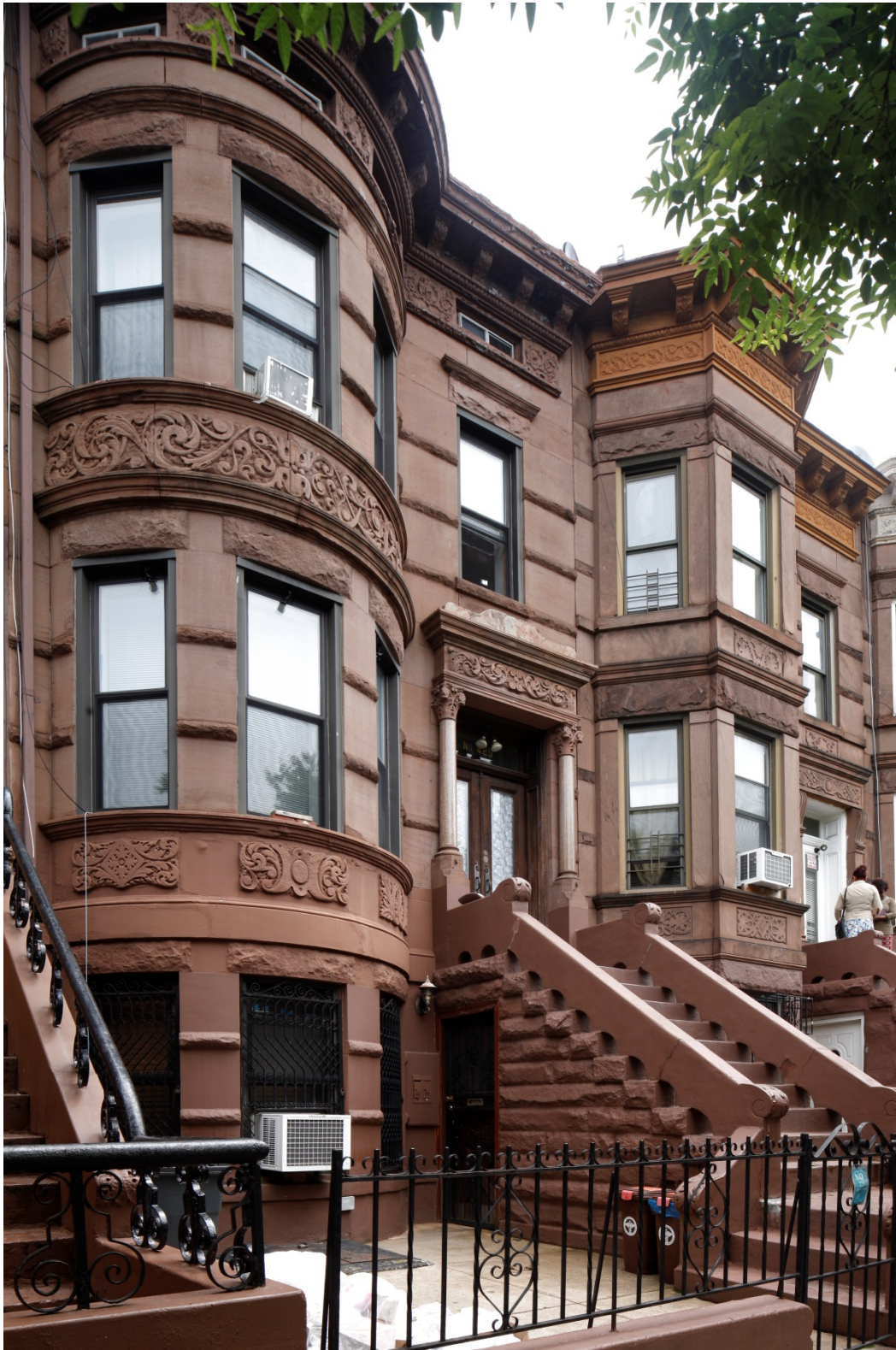
Figure 6 425 and 427 50th Street LPC, 2019