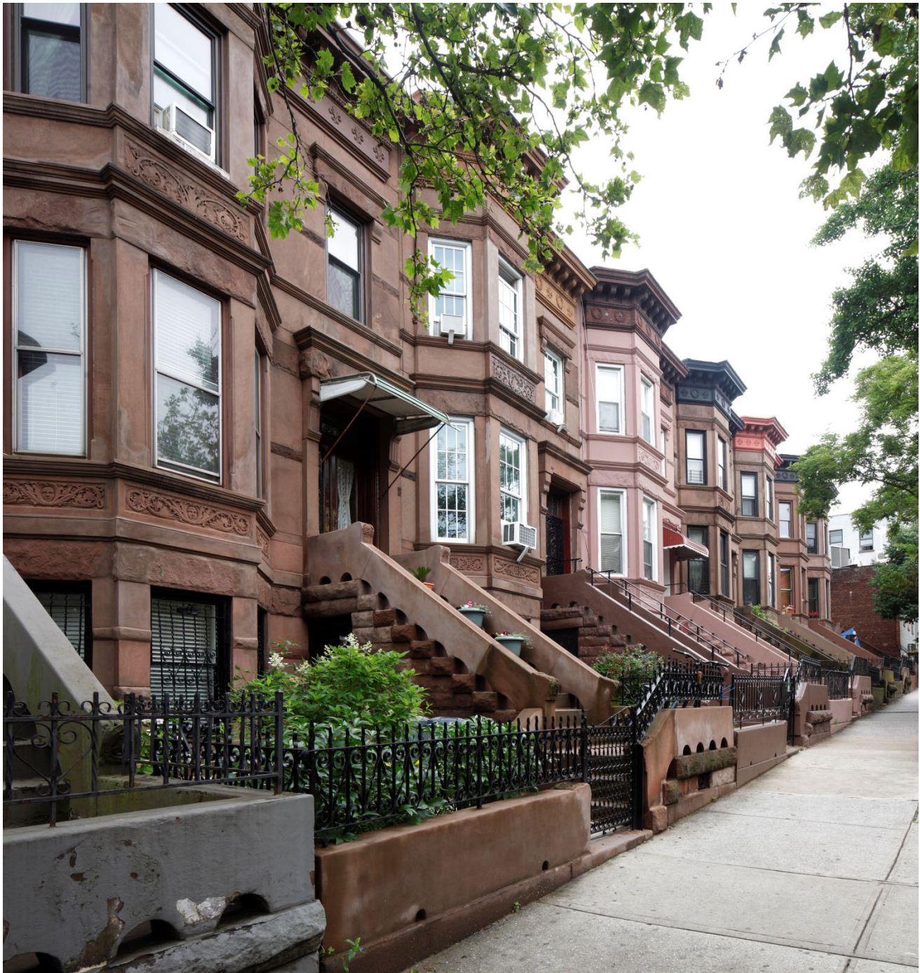
Figure 3 Portion of the row at 449 to 471 50th Street (Henry L. Spicer, 1897-98) LPC, 2019