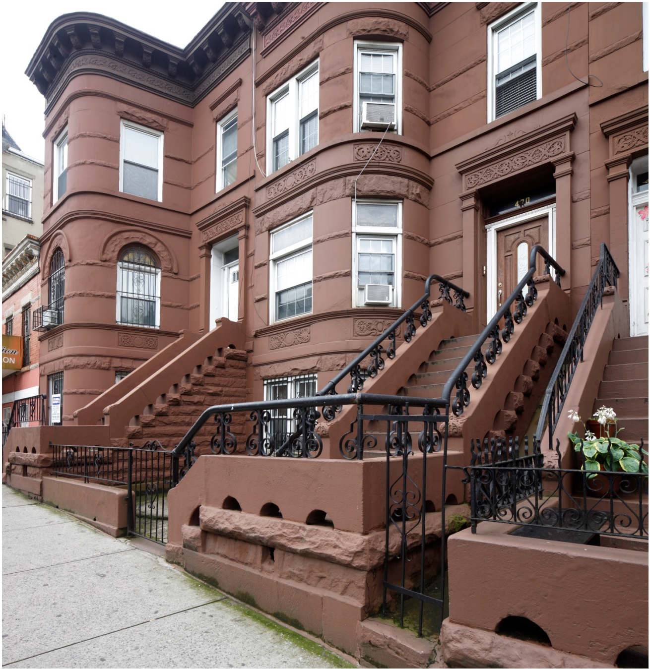
Figure 8 470 and 472 50th Street LPC, 2019