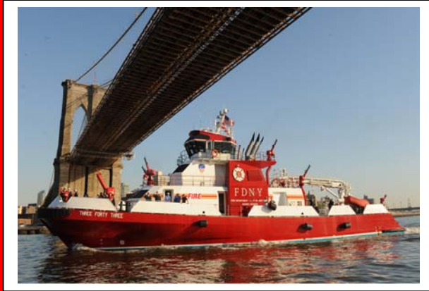
FDNY Fireboat Three Forty Three was commissioned into service on May 26 th , 2010. She is proudly named in commemoration of the 343 FDNY members who made the Supreme Sacrifice at the World Trade Center on September 11, 2001.