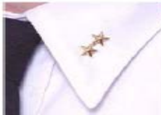
Deputy Assistant Chief