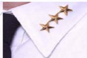
Assistant Chief of Department