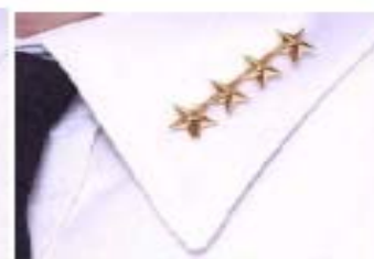
Chief of Operations