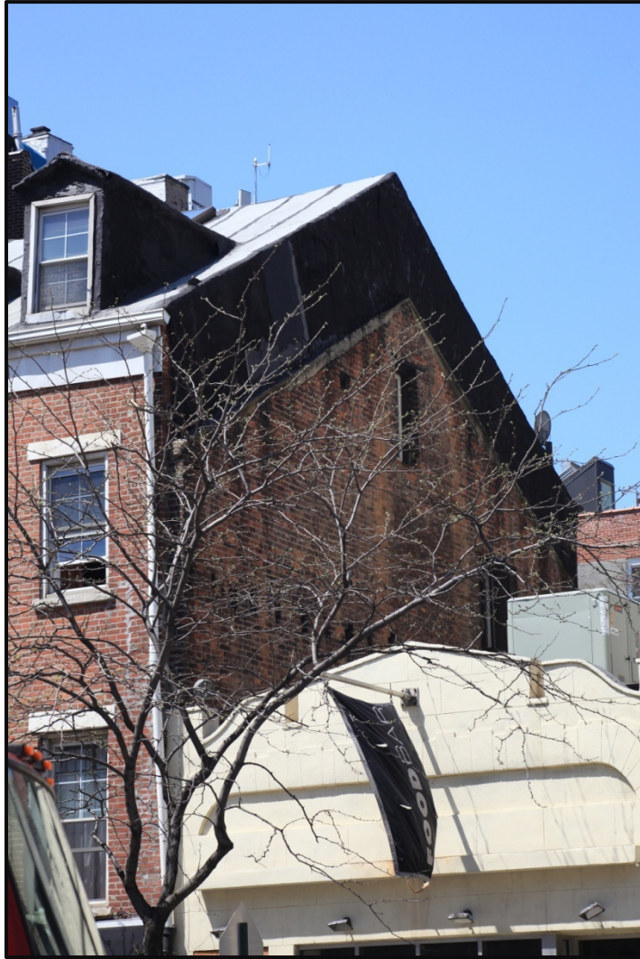
145 Eighth Avenue Roof Detail