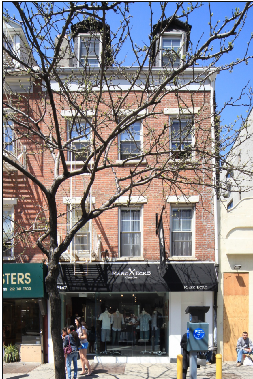
145 Eighth Avenue, Manhattan Borough of Manhattan Tax Map Block 741, Lot 32 Photo: Christopher D. Brazee, 2009