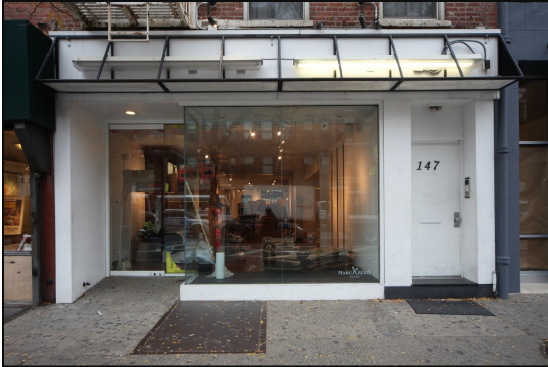
145 Eighth Avenue Storefront Detail