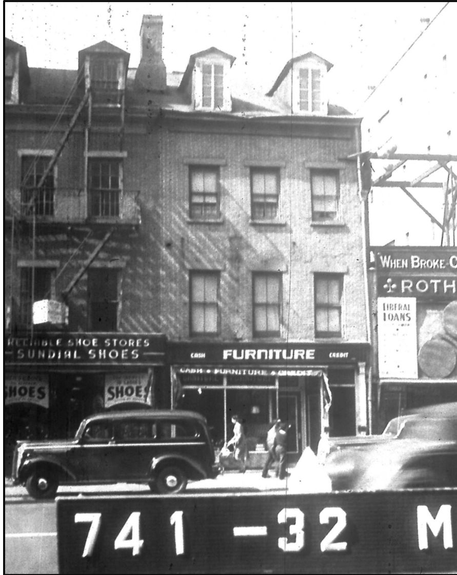
New York City Dept. of Taxes Photo c.1939