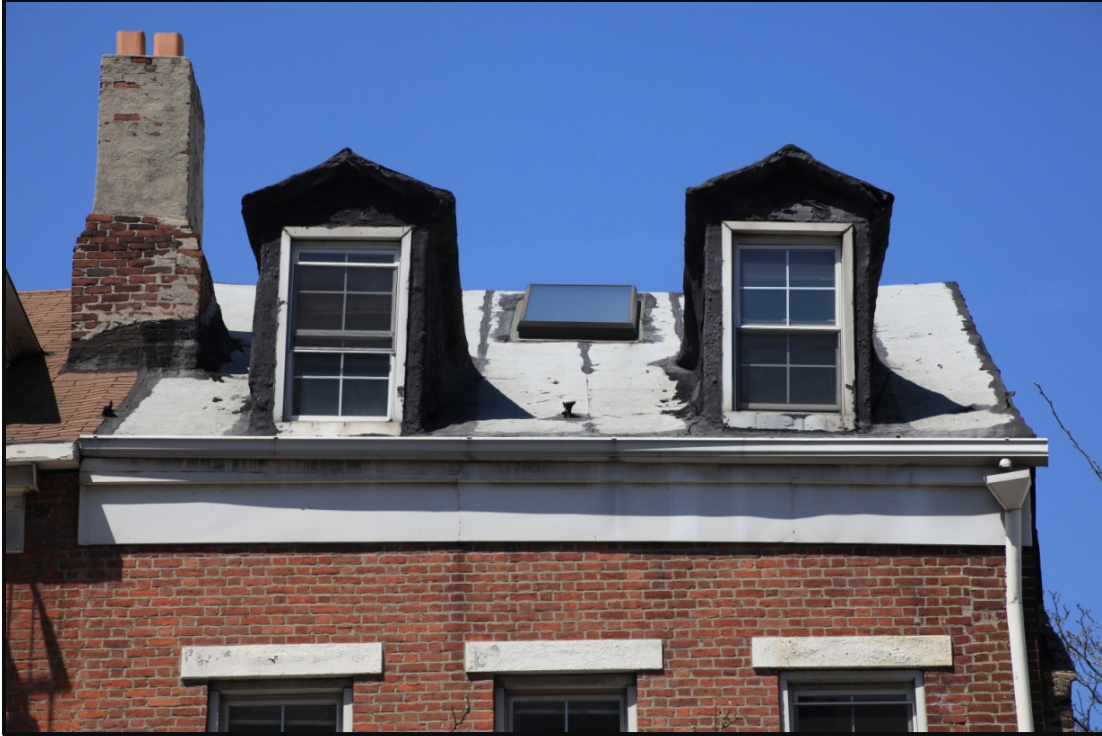
145 Eighth Avenue Roof Detail