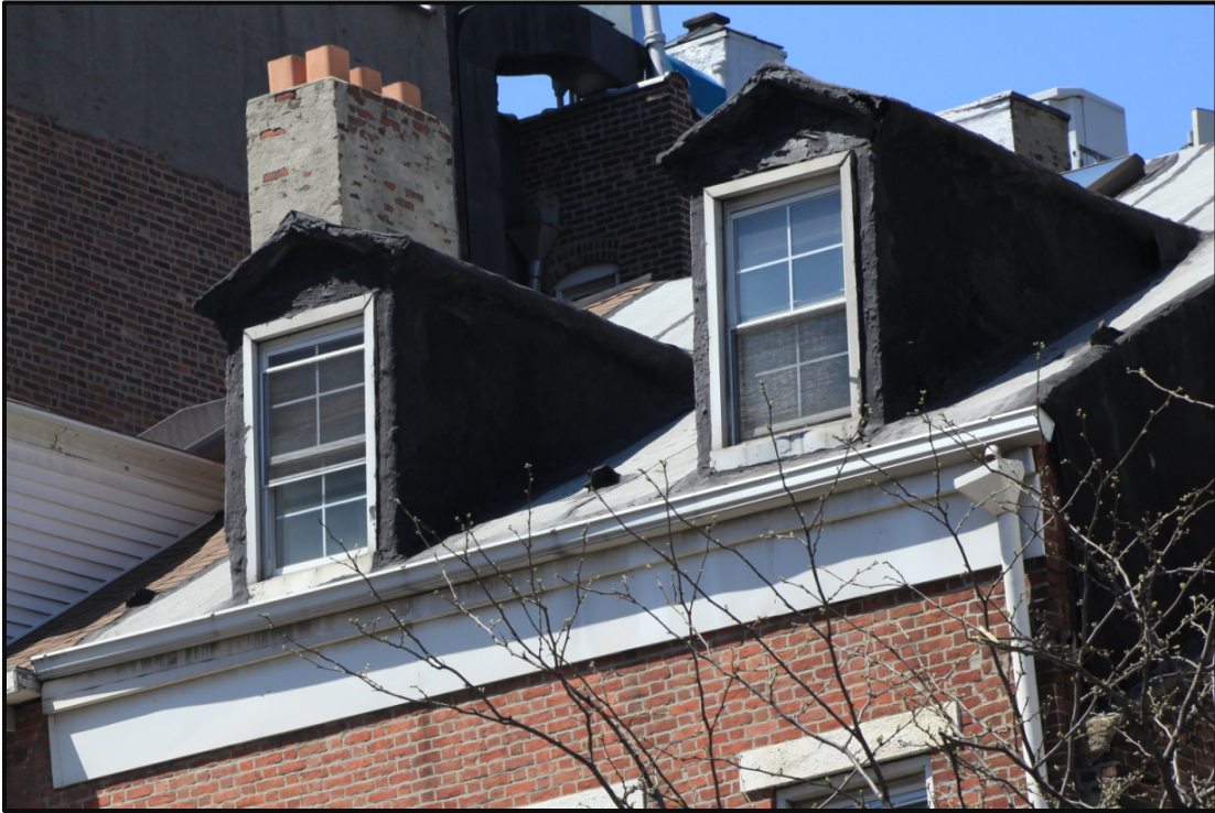
145 Eighth Avenue Roof Detail