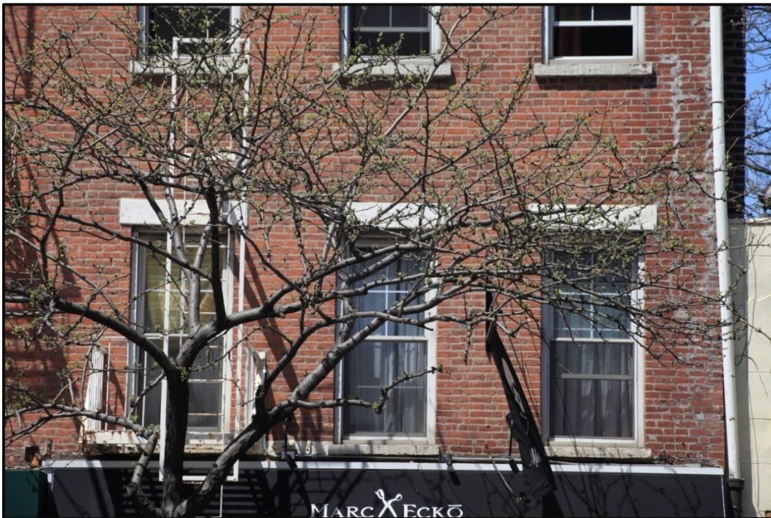
145 Eighth Avenue Second Floor Detail Photo: Christopher D. Braze, 2009