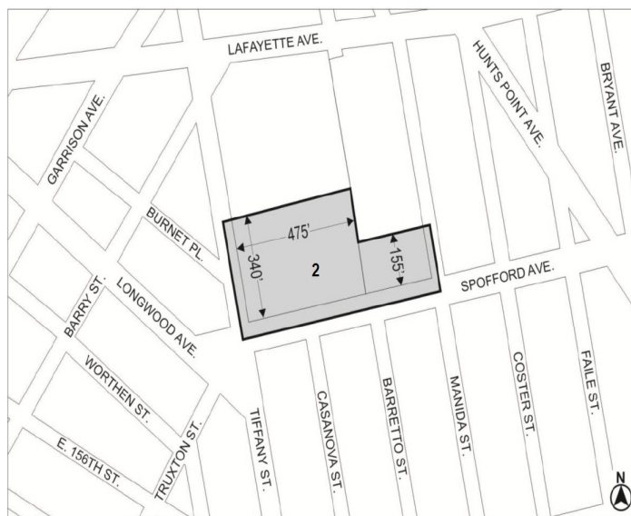
Mandatory Inclusionary Housing Program Area see Section 23-154(d)(3)