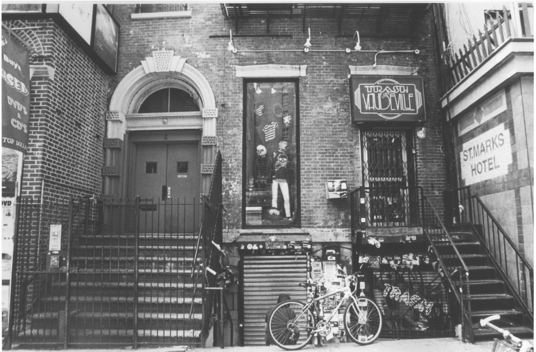
Hamilton-Holly House , base and first story