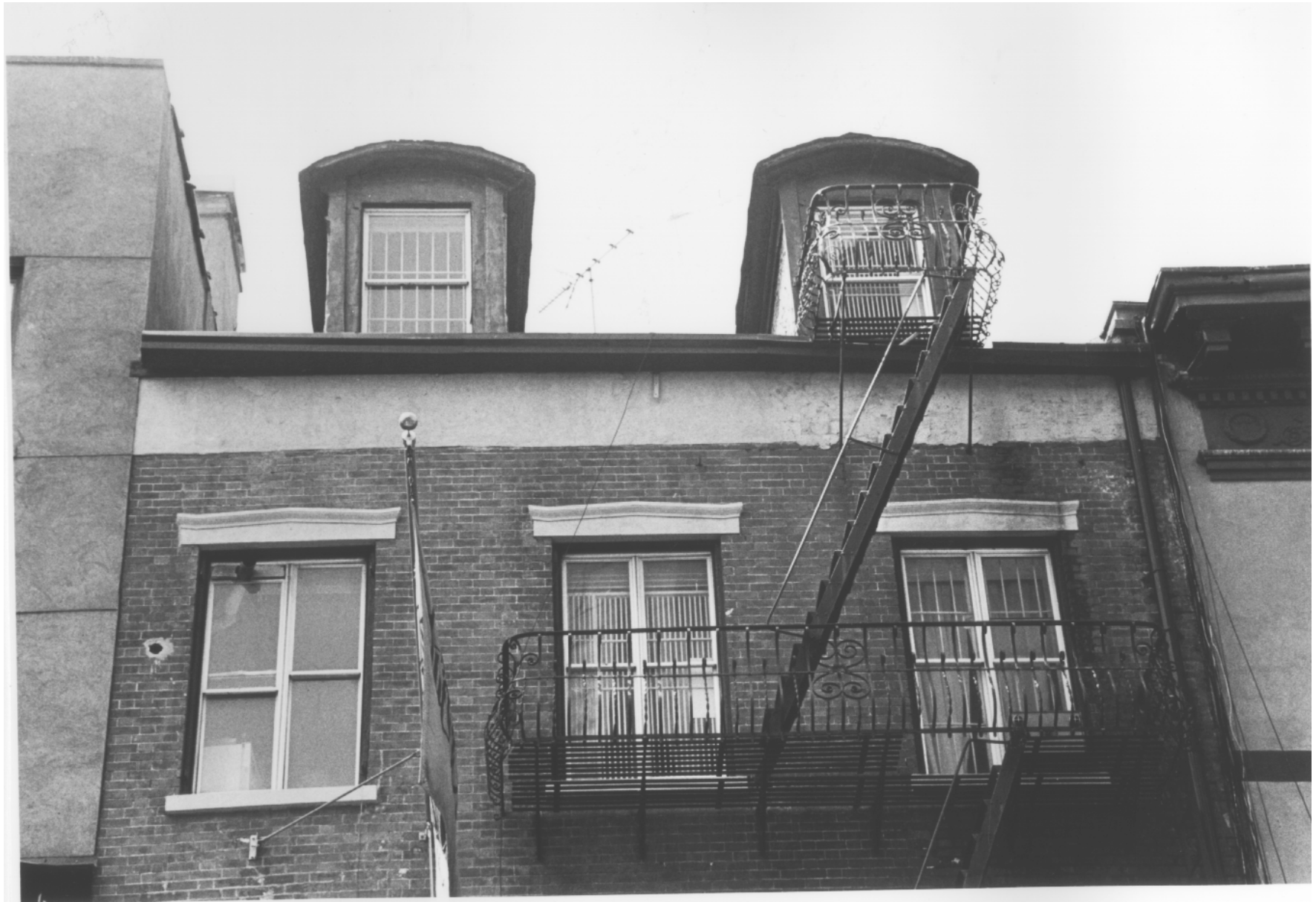
Hamilton-Holly House , third story and dormers