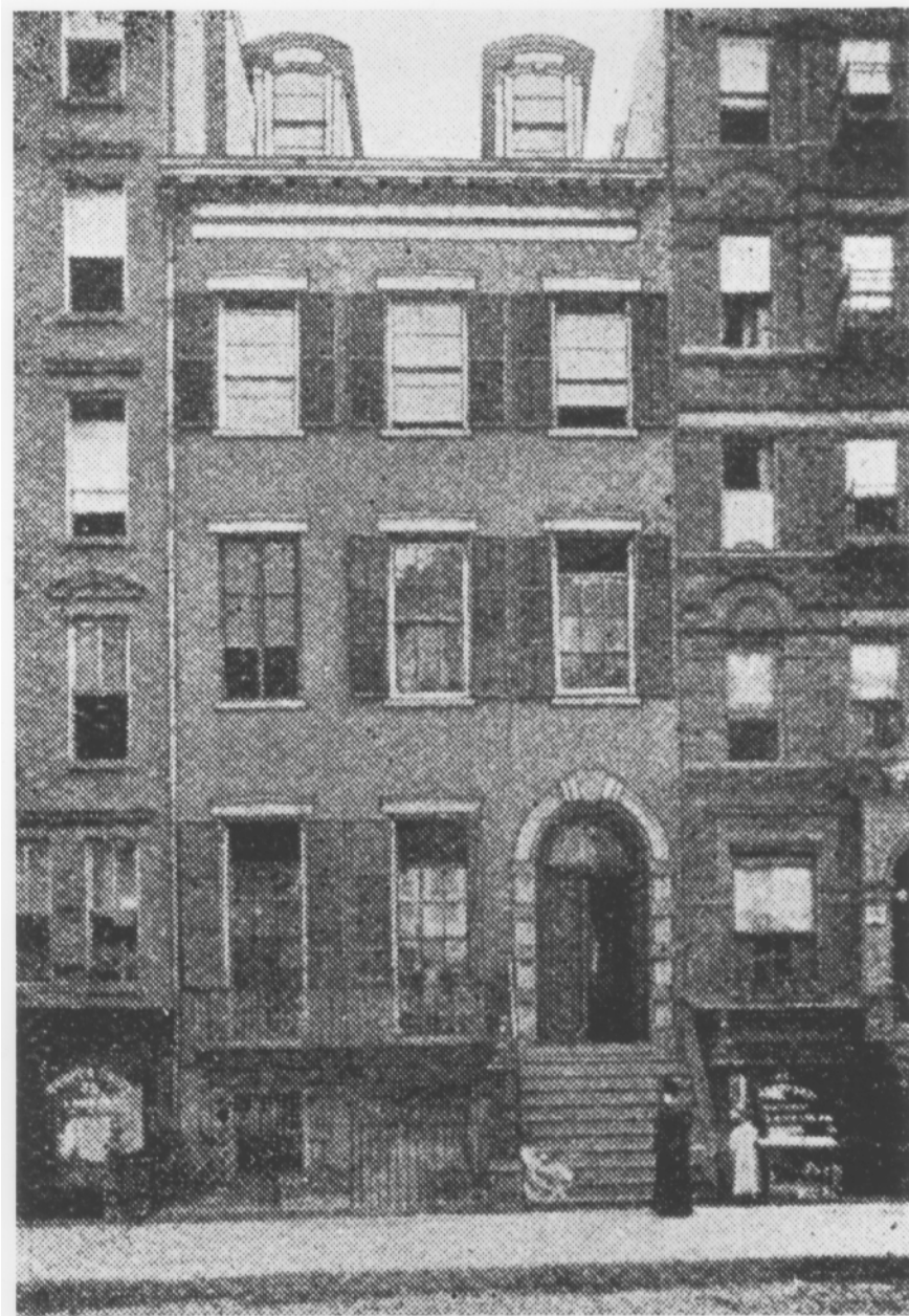
No. 24 St. Mark's Place , showing original architectural details of the houses on this block