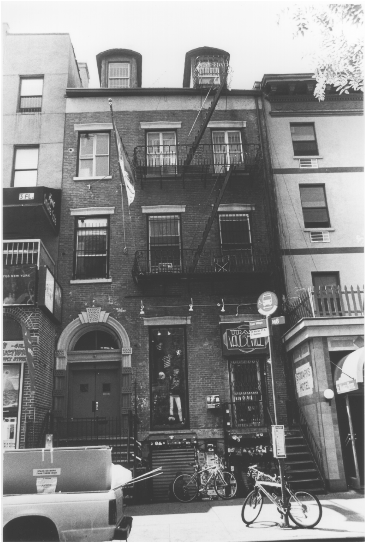
Hamilton-Holly House, 4 St. Mark's Place, Manhattan