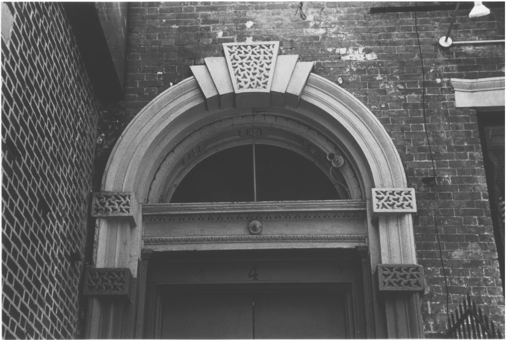
Hamilton-Holly House , entrance surround