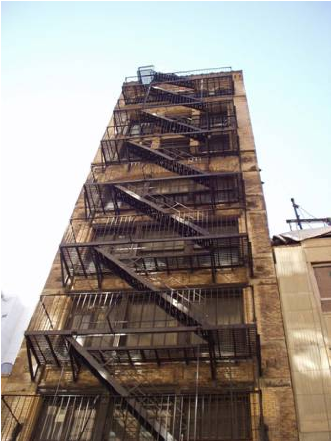
Keuffel & Esser Company Building Ann Street facade