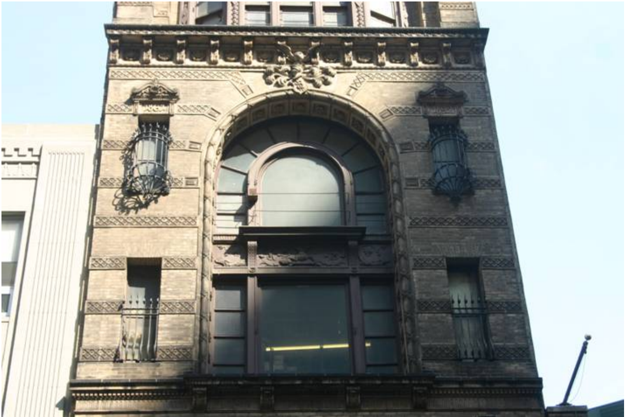
Keuffel & Esser Company Building Midsection