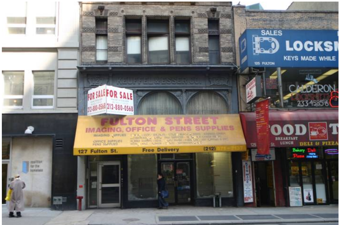
Keuffel & Esser Company Building Cast-iron storefront