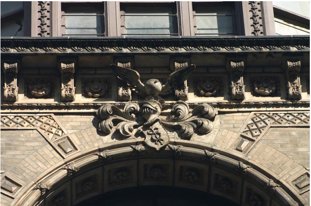
Keuffel & Esser Company Building Foliated sculptural relief with knight's helmet, shield, and winged orb