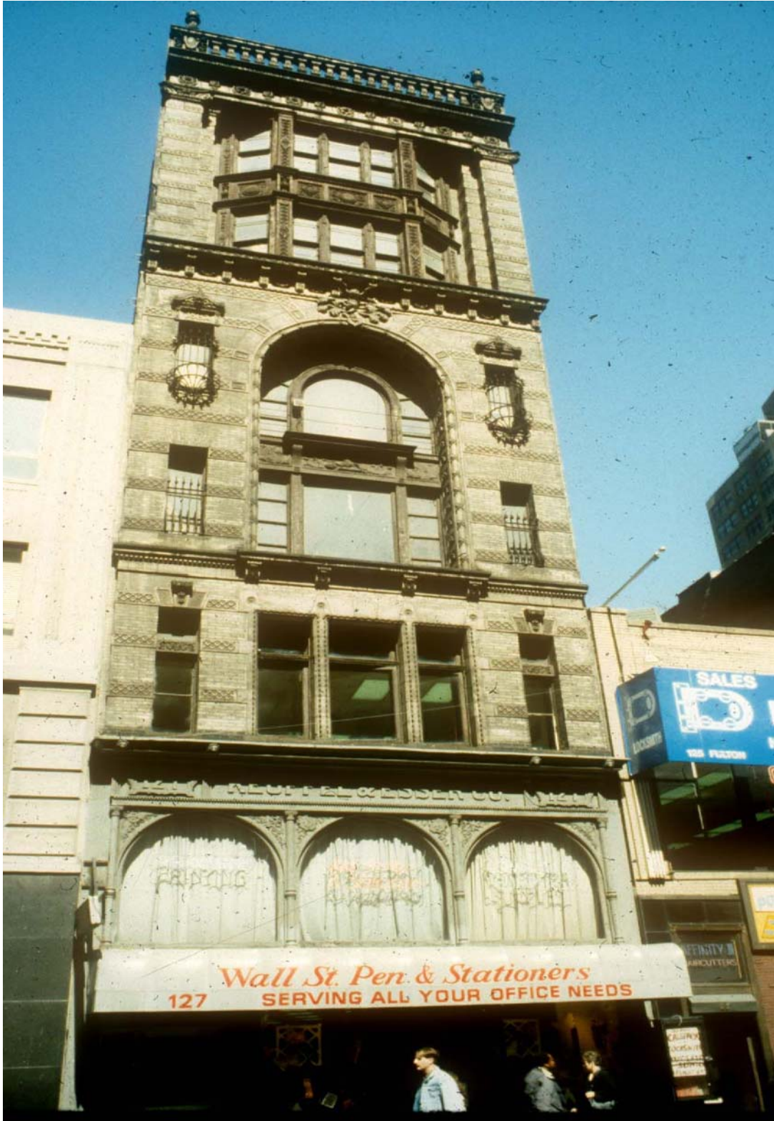
Keuffel & Esser Company Building Fulton Street facade Photo: Pat Garbe (1991)