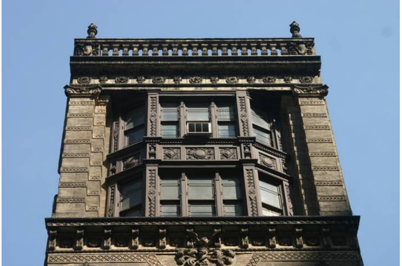
Keuffel & Esser Company Building Upper section