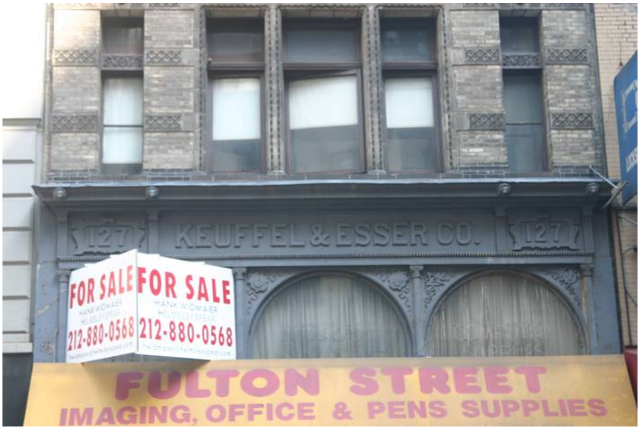
Keuffel & Esser Company Building Cast-iron storefront entablature with company name and address number plaques