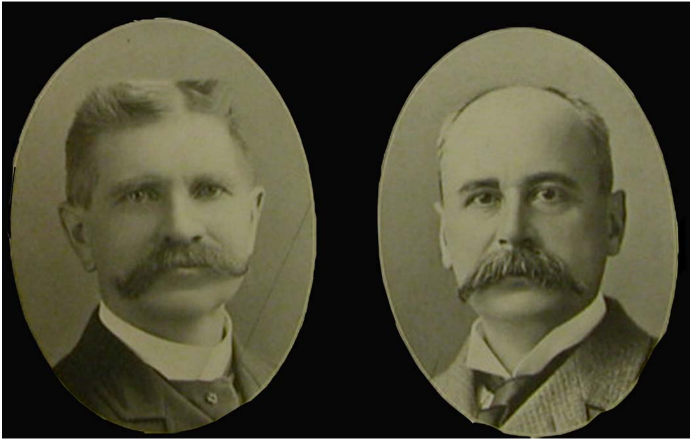
De Lemos and Cordes