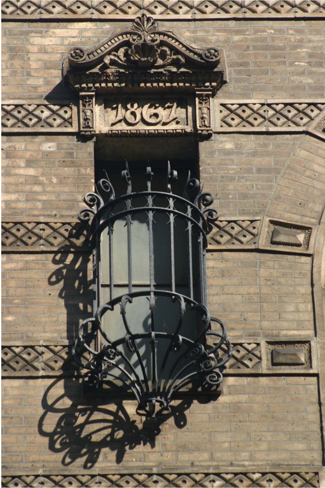
Keuffel & Esser Company Building 5th-story window detail