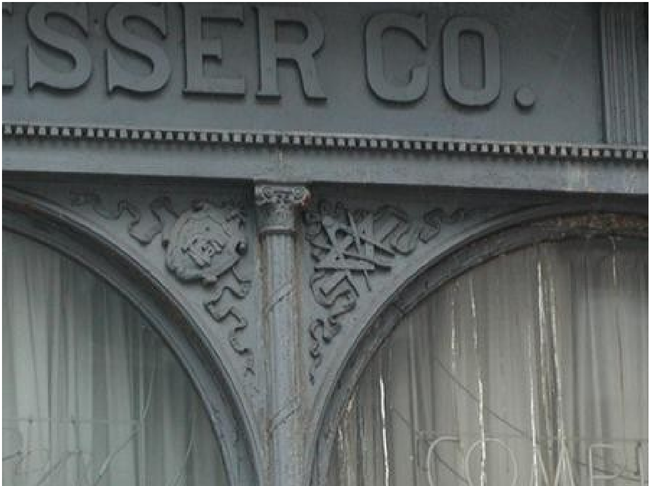
Keuffel & Esser Company Building Cast-iron storefront with shield with company initials and representation of products