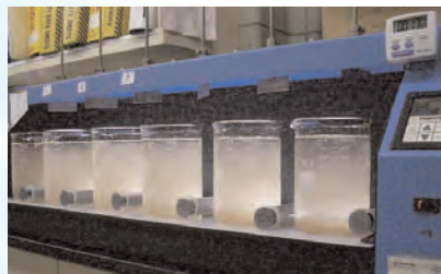
Testing at DEP water quality lab to determine alum dose

Turbidity has no health effect. However, turbidity can interfere with disinfection and provide a medium for microbial growth. Turbidity may indicate the presence of disease-causing organisms. These organisms include bacteria, viruses, and parasites that can cause symptoms such as nausea, cramps, diarrhea, and associated headaches. Please pay special attention to the additional statement in this document regarding Cryptosporidium.