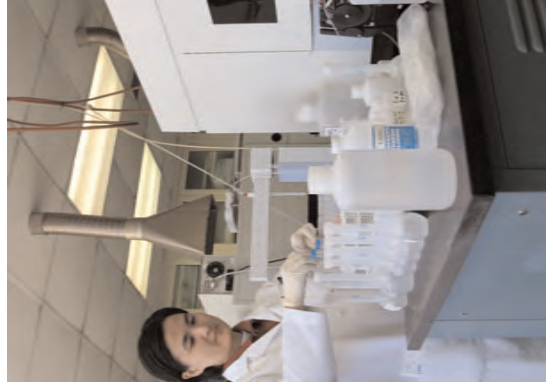
Drinking Water Quality Control Distribution Laboratory