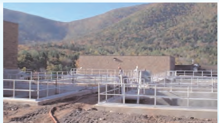
Hunter WWTP, Hunter, NY

At the City's expense, more than 100 non-City-owned WWTPs in the watershed are being upgraded to provide state-of-the-art treatment to eliminate pathogens and substantially reduce nutrients in their waste streams. To date, plants accounting for 97% of the West-of-Hudson WWTP flow have been upgraded. In 2005, DEP determined that several existing east of Hudson WWTPs whose effluents had been slated to be diverted off the watershed now require on-site upgrades. These facilities were enrolled in the City's Upgrade Program. The addition of these plants caused a decrease in the percentage of flow upgraded to date and percentage of flow under construction. In the Croton watershed, plants that account for 14% of the flow have been fully upgraded and plants accounting for 36% of the flow are under construction. The remaining facilities are in the design phase.