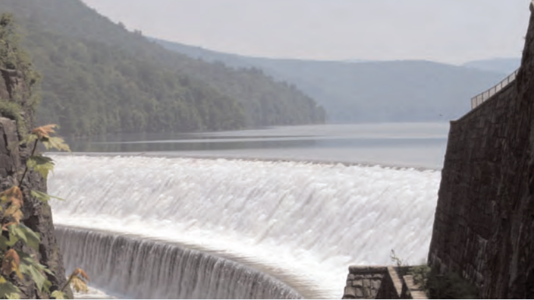
Pepacton Reservoir Spillway, Delaware County, NY