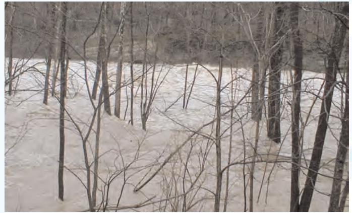
Flooding at Rondout Creek, High Falls, NY

In the weeks following a significant storm event on April 2 and 3, 2005, water quality in the City's reservoirs experienced high turbidity levels, especially in the Catskill System. During the storm event, near-record rain fell across the Tri-State region. In the watersheds, precipitation averaged between 2 and 4 inches, with some areas receiving up to 6 inches. This event followed more than 2 inches of rain on March 27 and 28, and generally wet conditions in the preceding months which left the ground saturated and led to significant subsequent flooding. Runoff from the April 2-3 storm scoured soils and stream beds in the watershed, creating high turbidity in adjacent streams and creeks, which in turn led to high turbidity levels. DEP requested, and received permission from the State Departments of Health and Environmental Conservation (NYSDOH and NYSDEC) to add aluminum sulfate (alum) and sodium hydroxide to Catskill water as it enters Kensico Reservoir on an emergency basis to reduce turbidity levels within the reservoir. Alum is a coagulant