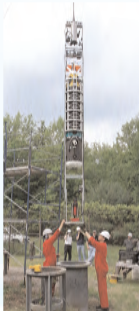
Automated Underwater Vehicle (AUV)

As the Dependability Study has advanced, it has come to focus on seeking solutions in both the short term and the long term. Short-term planning will ask the question, "What can be achieved quickly and cost-effectively to guarantee the sufficiency of the City's water supply?" Longer-term dependability planning will explore options that include water tunnel construction and development of alternative drinking water sources. Measures being considered include demand reduction incentives,