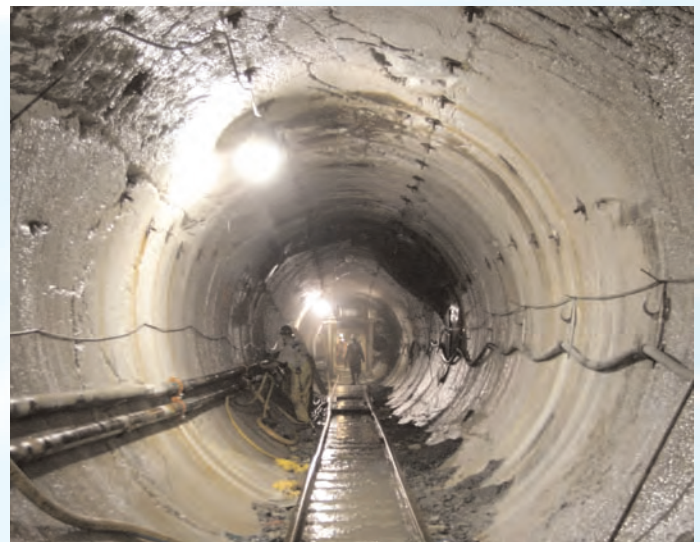
Tunnel No. 3, Manhattan, NY

The City remains committed to maintaining a comprehensive watershed protection program for the Croton system. Until DEP begins to filter Croton water, we are required to make the following statement: Inadequately treated water may contain disease-causing organisms. These organisms include bacteria, viruses, and parasites, which can cause symptoms such as nausea, cramps, diarrhea, and associated headaches.