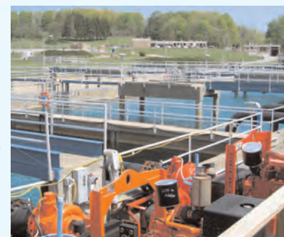
UV Validation & Research Center of New York, Johnstown, NY

EPA finalized new regulations in December 2005, specifically the Long Term 2 Enhanced Surface Water Treatment Rule (LT2ESWTR), to improve control of microbial pathogens. In preparation for the new rule which was first proposed in August 2003, New York City has been designing an ultraviolet (UV) light disinfection plant for the Catskill/Delaware system. In November 2005, DEP produced a final design of the UV facility. The plant will be located at the New York City-owned Eastview site, a 153-acre property situated in the towns of Mount Pleasant and Greenburgh in Westchester County, New York. When built, this plant will provide an additional barrier of microbiological protection by inactivating potentially harmful organisms such as Cryptosporidium or Giardia . This treatment will supplement DEP's existing microbial disinfection programs.