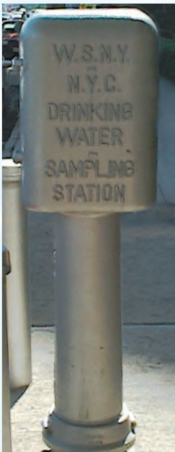
Drinking Water Supply Sampling Station

The results of the tests conducted in 2005 on distribution water samples under DEP's Distribution System Monitoring Program are summarized in the tables in this Report. These tables reflect the compliance monitoring results for all regulated and non-regulated parameters. The tables present both the federal and State standard for each parameter (if applicable), the number of samples collected, the range of values detected, the average of the values detected, and the possible sources of the parameters. The monitoring frequency of each parameter varies and is parameter specific. Data are presented separately for the Catskill/Delaware, Croton, and Groundwater Systems. Whether a particular user receives water from the Catskill/Delaware, Croton, or Groundwater supplies, or a mixture, depends on location, system operations, and consumer demand. Those parameters monitored but not detected in any sample are presented in a separate box. The State requires