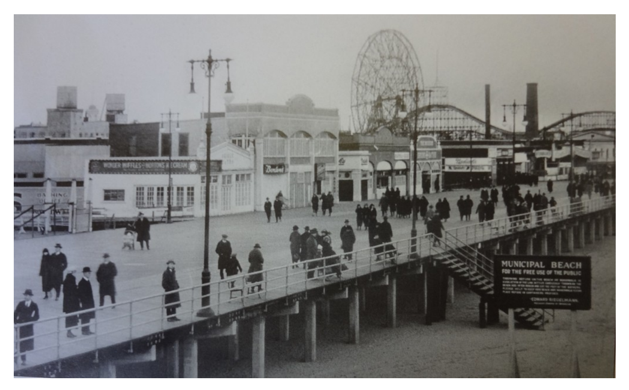
Coney Island (Riegelmann) Boardwalk, east of Stillwell Avenue 1923