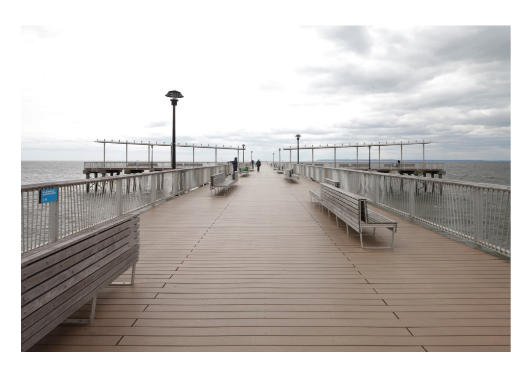
Coney Island (Riegelmann) Boardwalk, south end of Steeplechase Pier