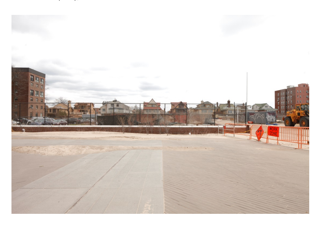
Coney Island (Riegelmann) Boardwalk , east end at Brighton 15th Street Sarah Moses (LPC), 2018