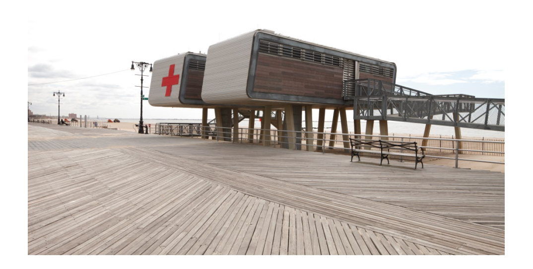
Coney Island (Riegelmann) Boardwalk , life guard station near Surf Avenue Sarah Moses (LPC), 2018