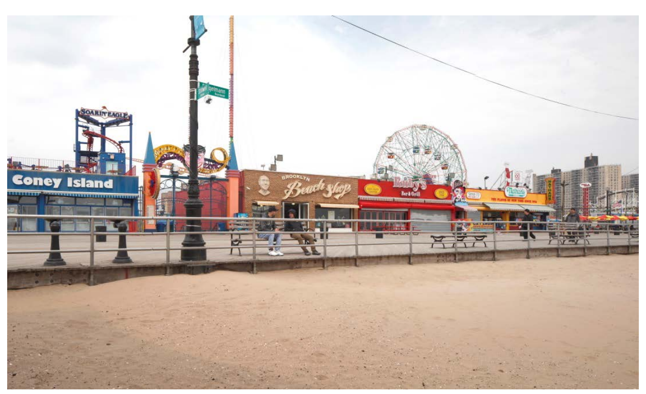
Coney Island (Riegelmann) Boardwalk, east of Stillwell Avenue 2018, LPC