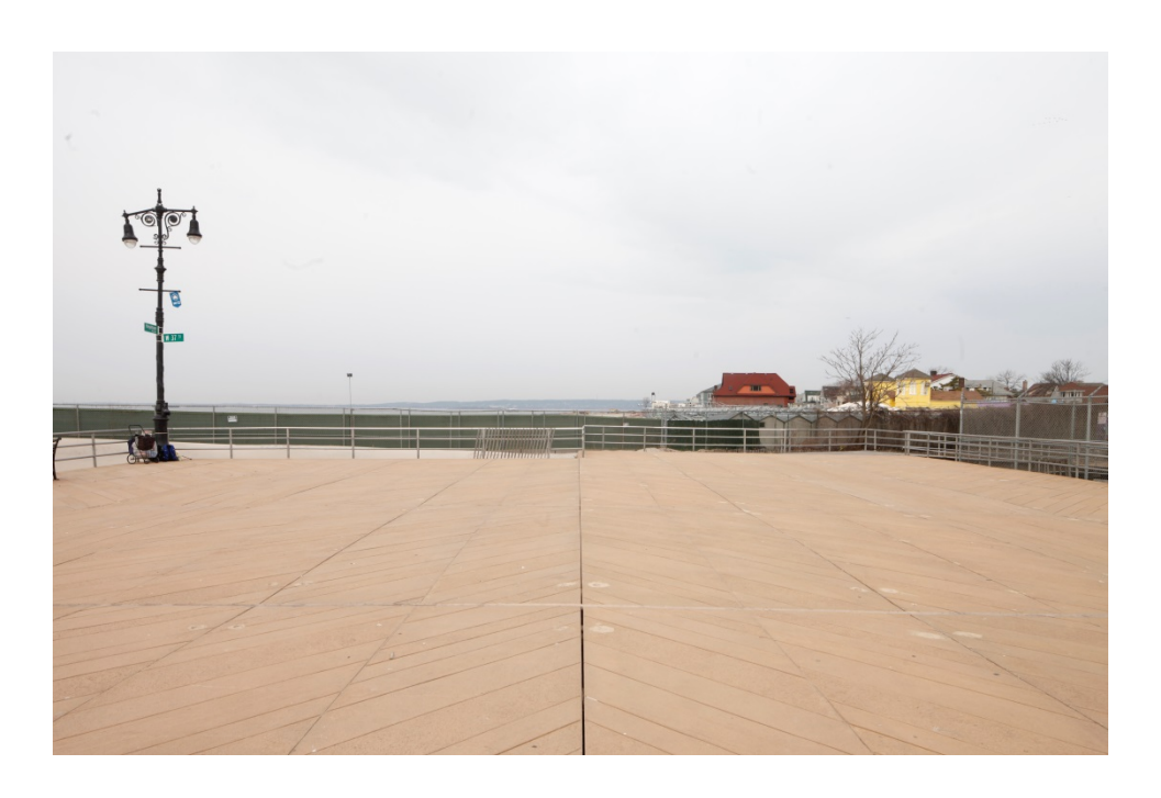
Coney Island (Riegelmann) Boardwalk, west end at West 37th Street