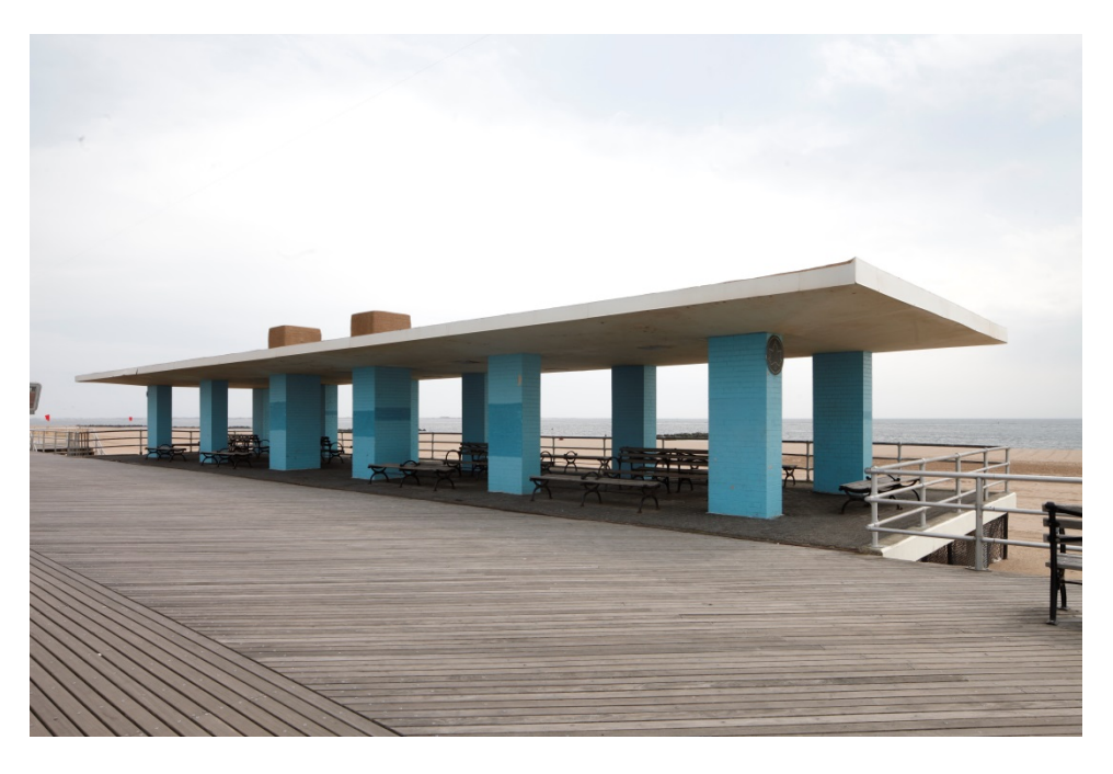
Coney Island (Riegelmann) Boardwalk , shade pavilion and comfort station near West 10th Street Sarah Moses (LPC), 2018