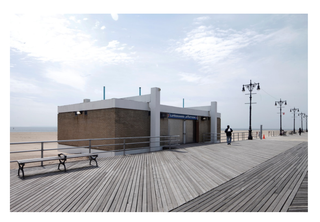
Coney Island (Riegelmann) Boardwalk , lifeguard station near West 22nd Street Sarah Moses (LPC), 2018