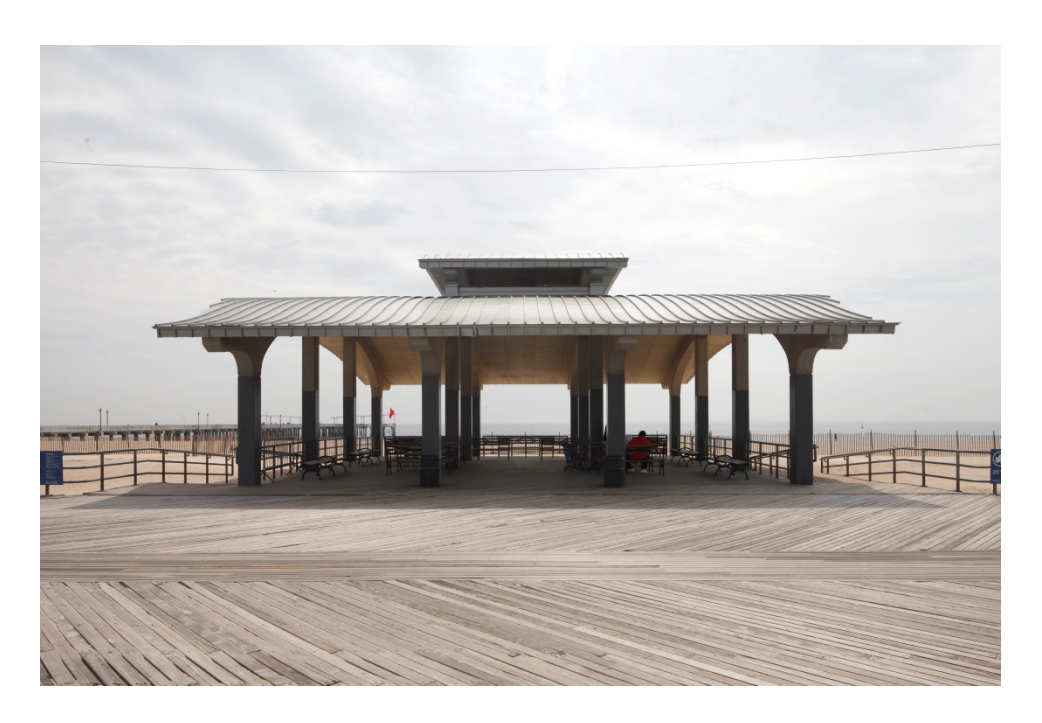
Coney Island (Riegelmann) Boardwalk , shade pavilion near Parachute Jump Sarah Moses (LPC), 2018