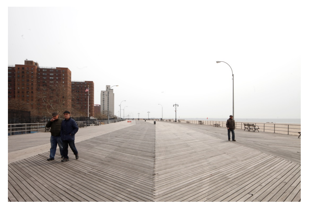
Coney Island (Riegelmann) Boardwalk , close to west end, near West 32^{\rm nd} Street Sarah Moses (LPC), 2018