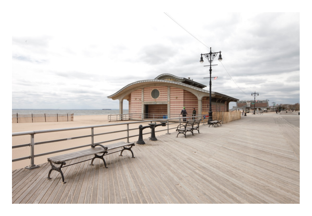
Coney Island (Riegelmann) Boardwalk, comfort station near Brighton 2^{\rm nd} Street Sarah Moses (LPC), 2018