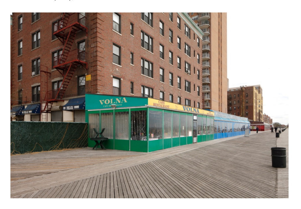
Coney Island (Riegelmann) Boardwalk , restaurants near Brighton 4th Street Sarah Moses (LPC), 2018