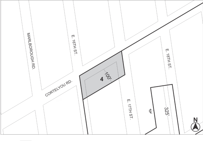
Map\ 6-[date\ of\ adoption]