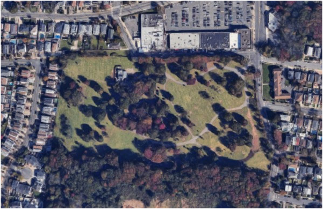
Aerial View looking north, Google Maps, September 2022