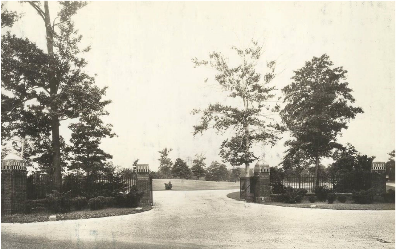
Entrance to Frederick Douglass Memorial Park