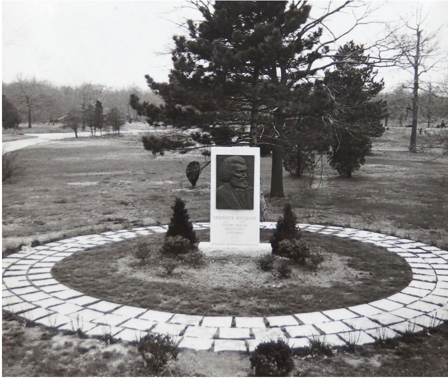
Frederick Douglass monument Cemetery Archives, 1961