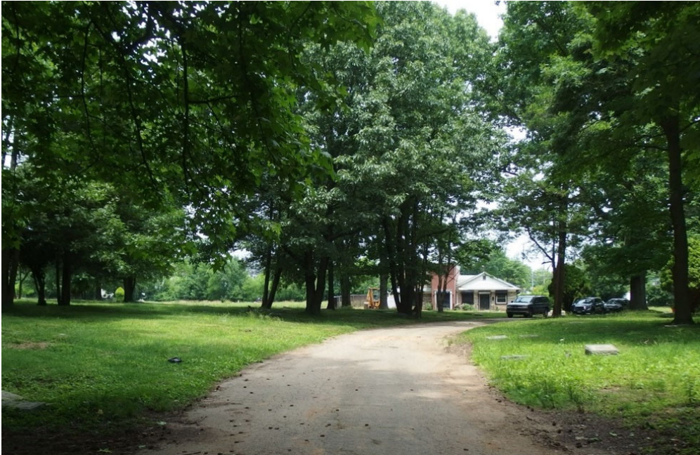
View north toward office building along Oak Drive LPC, June 2024