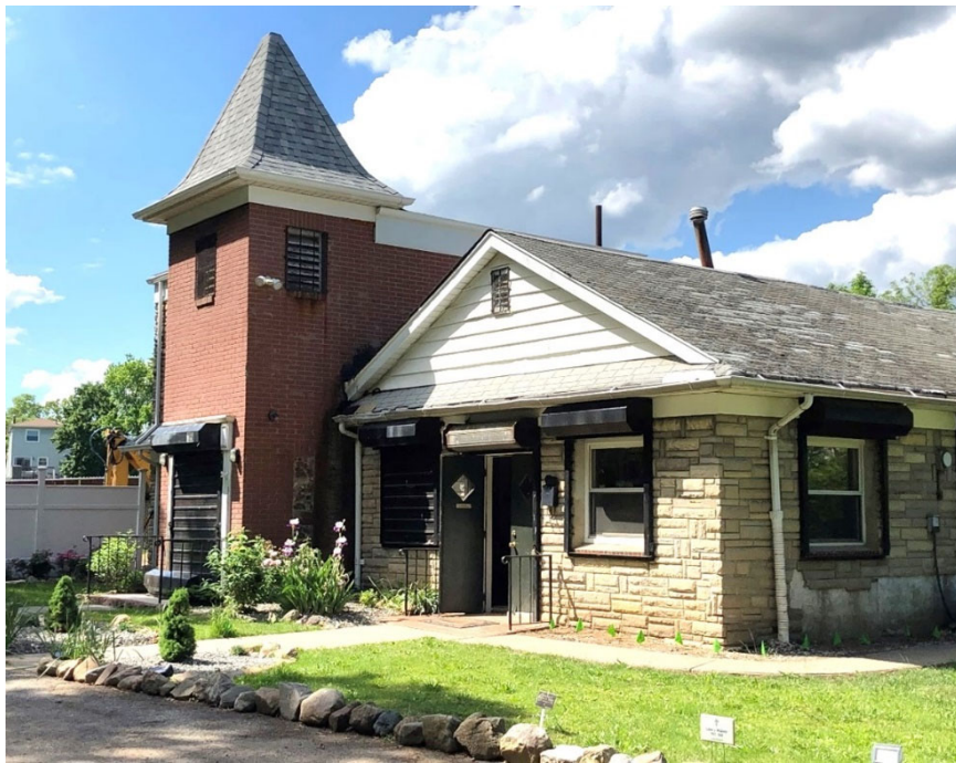
Office Building LPC, June 2024