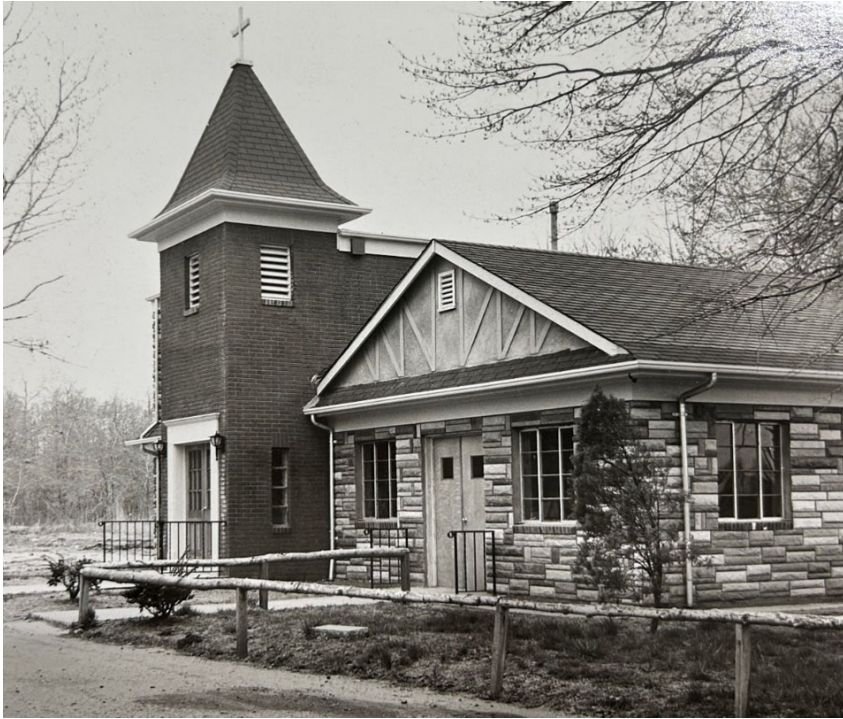
Office Building Cemetery Archives, 1961