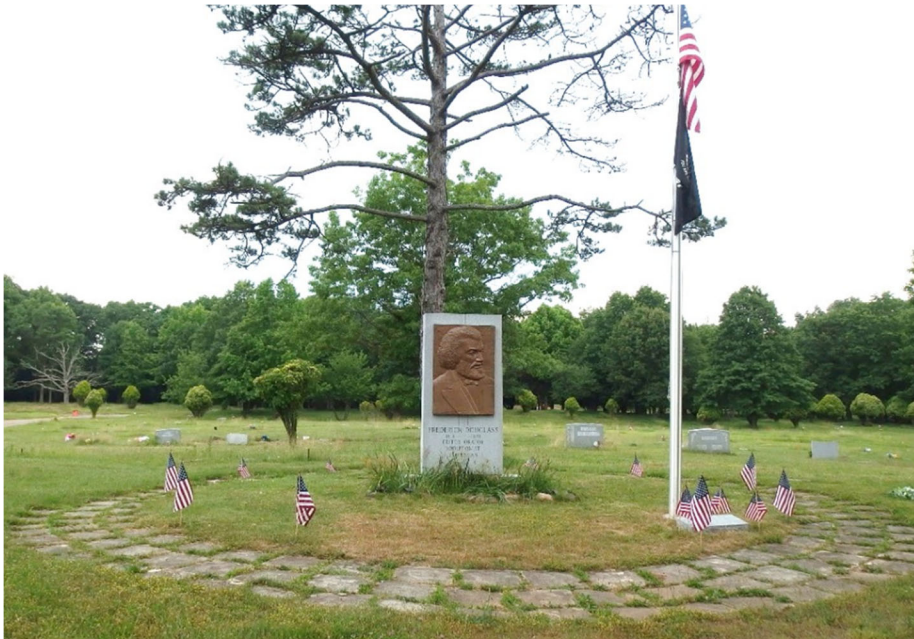
Frederick Douglass monument LPC, June 2024