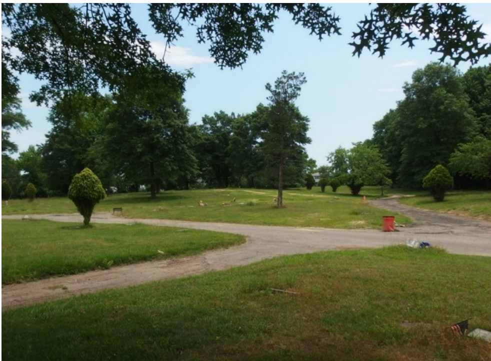
Same view looking southeast LPC, June 2024