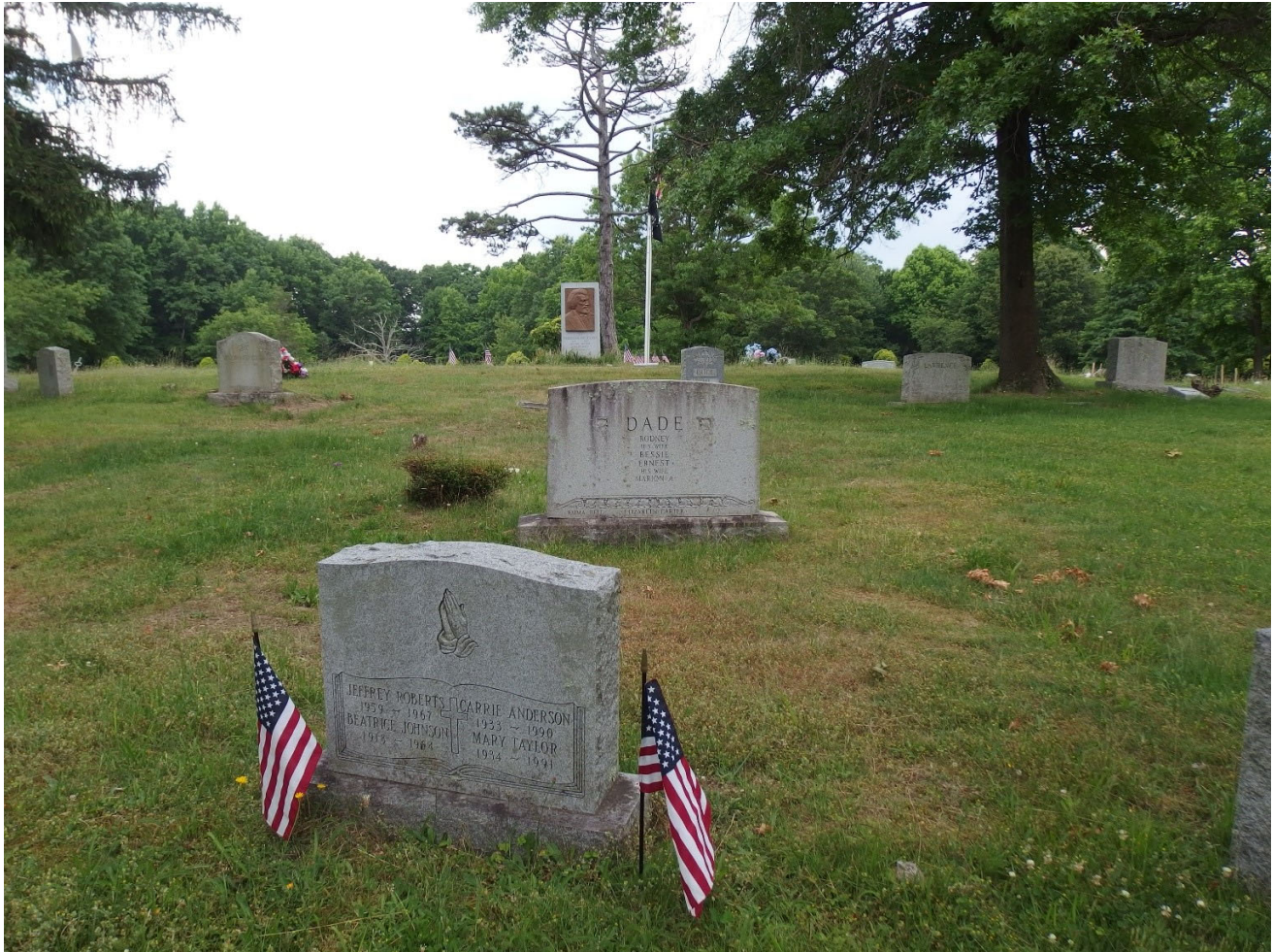
View looking west toward the Frederick Douglass monument LPC, June 2024