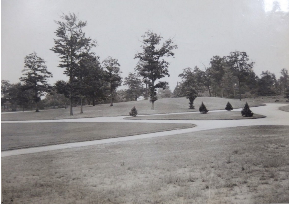
View southeast from Section C-D Road Cemetery Archives, 1935