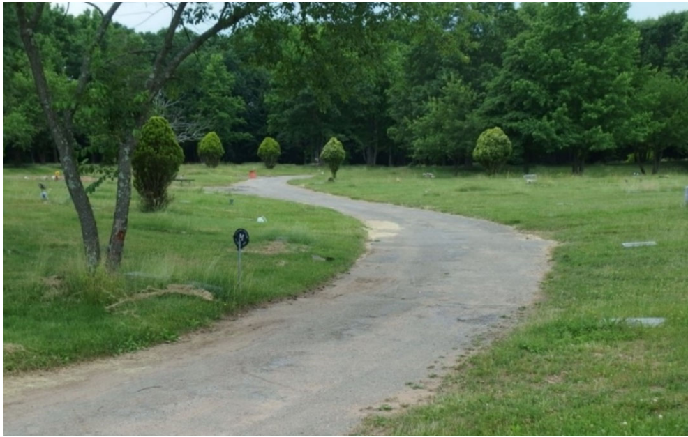
View west along South Drive LPC, June 2024