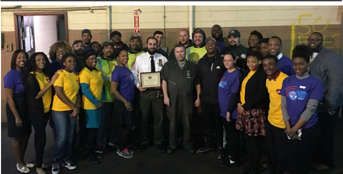
Thanks to the many volunteers from the Adventist Youth Ministries who served lunch to workers in BK 8 and BK 9 as part of their day of compassion.