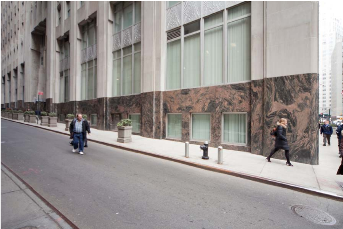
Cities Service Building Pine Street, looking east, looking west Photo: Christopher D. Brazee, 2011