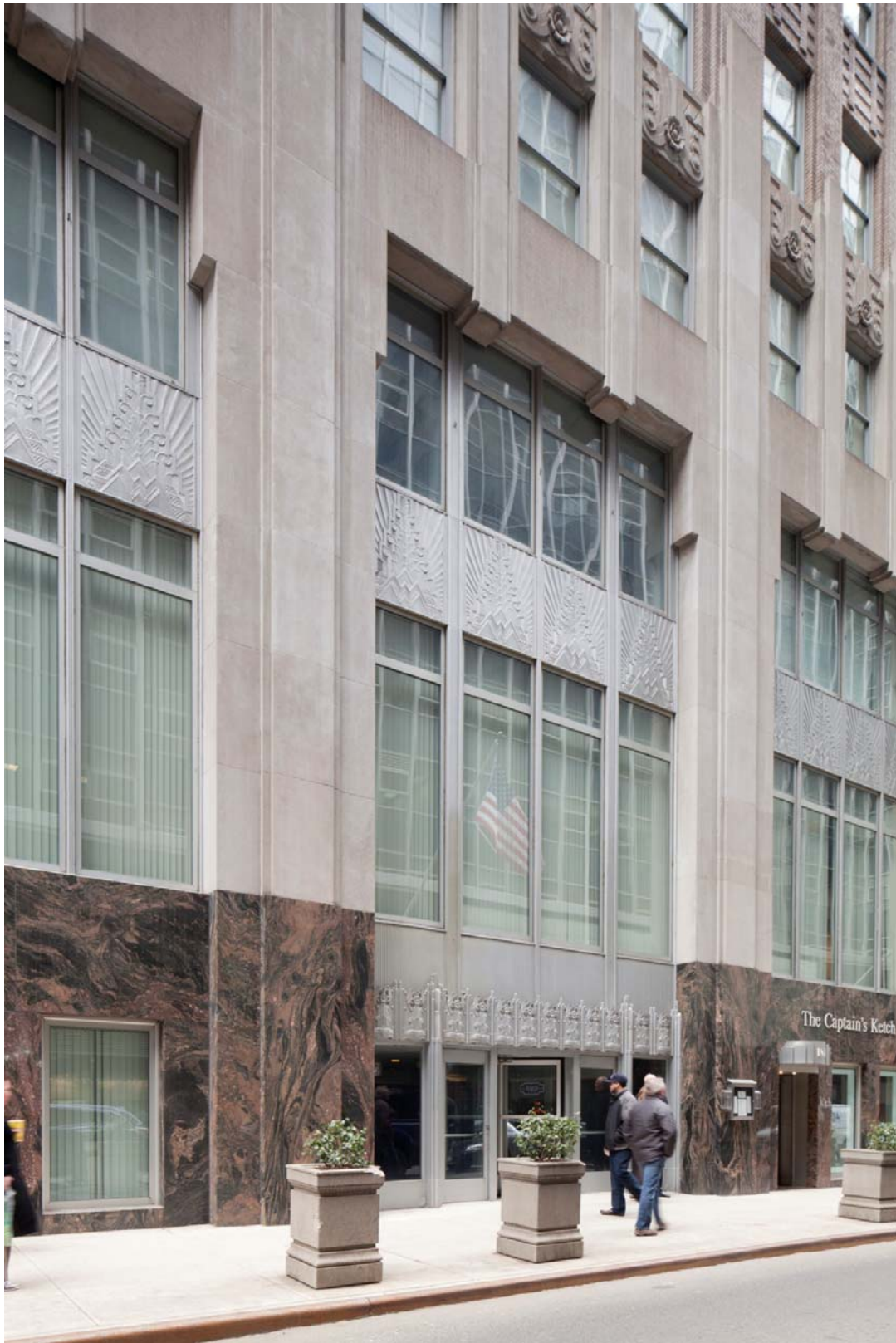
Cities Service Building Pearl Street entrance