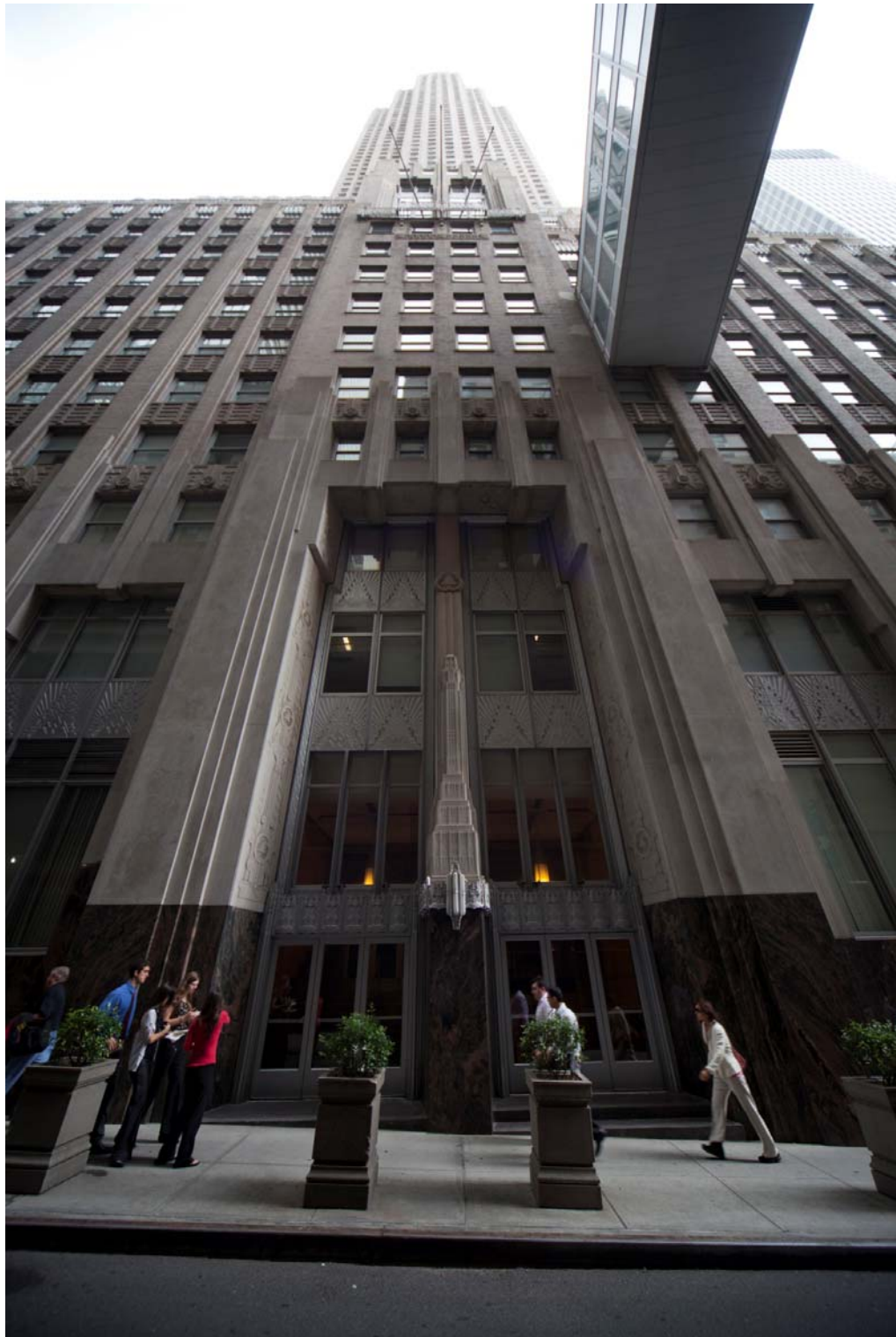
Cities Service Building Pine Street, east entrance Photo: Christopher D. Brazee, 2011