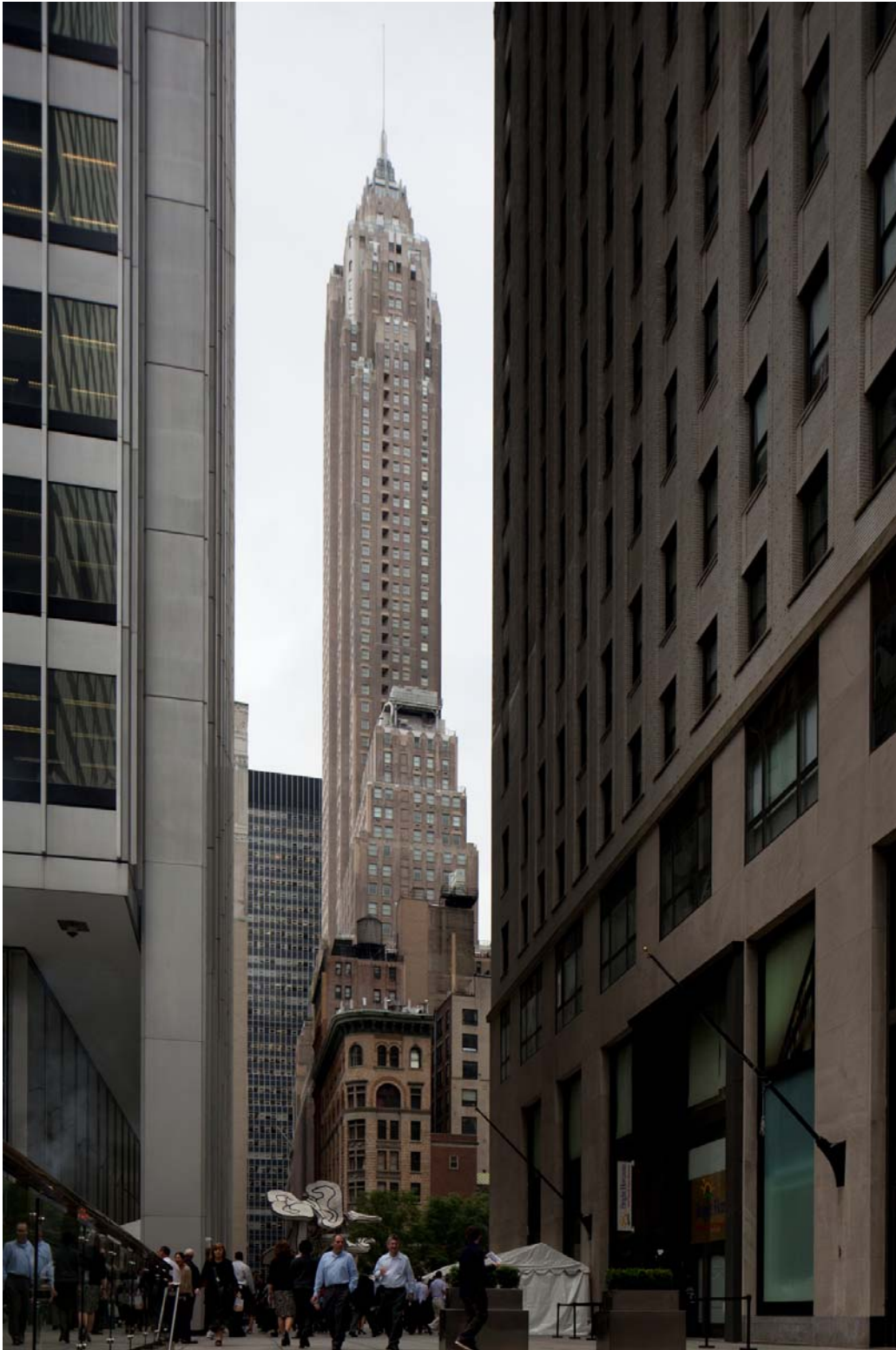
Cities Service Building 70 Pine Street (aka 66-76 Pine Street, 2-18 Cedar Street, 171-185 Pearl Street) Borough of Manhattan Block 41, Lot 1 West façade from Nassau Street