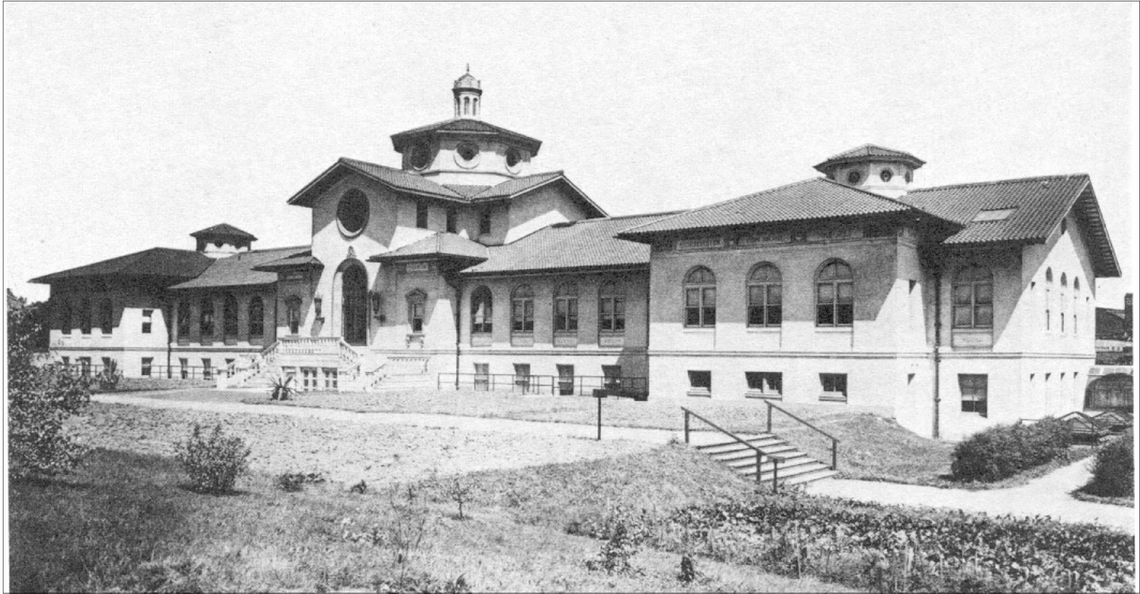
Laboratory Administrative Building, Brooklyn Botanic Garden Façade Toward Garden