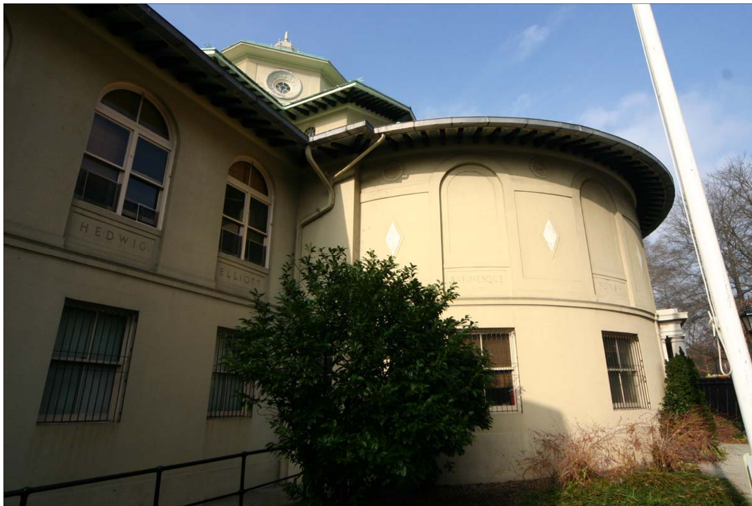
Laboratory Administrative Building, Brooklyn Botanic Garden Façade Toward Street