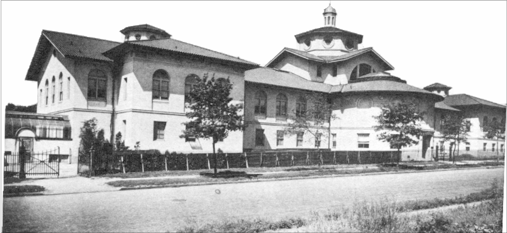
Laboratory Administrative Building, Brooklyn Botanic Garden Façade Toward Street