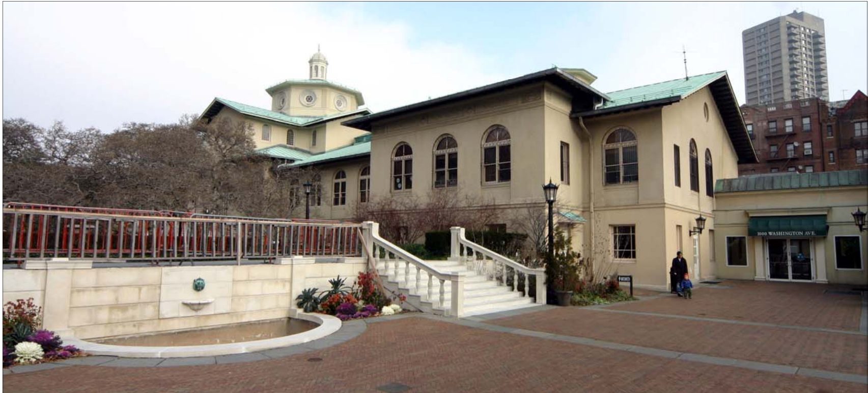
Laboratory Administrative Building, Brooklyn Botanic Garden Façade Toward Garden