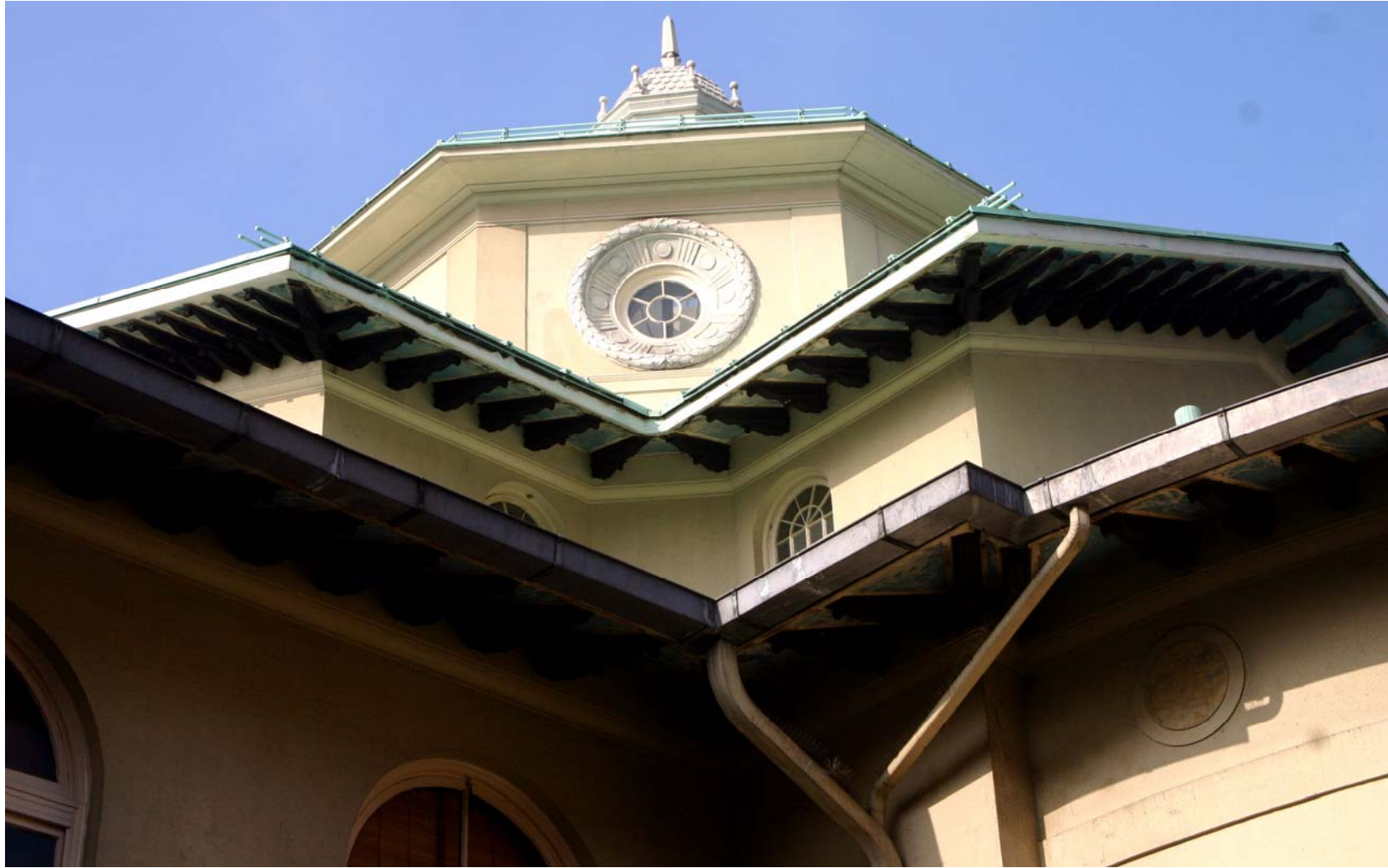
Laboratory Administrative Building, Brooklyn Botanic Garden Cupola Detail