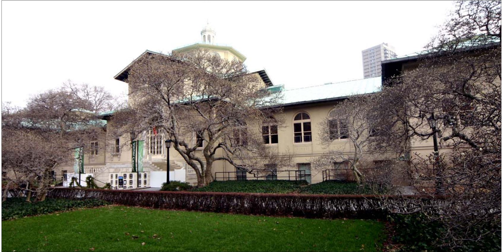
Laboratory Administrative Building, Brooklyn Botanic Garden Façade Toward Garden