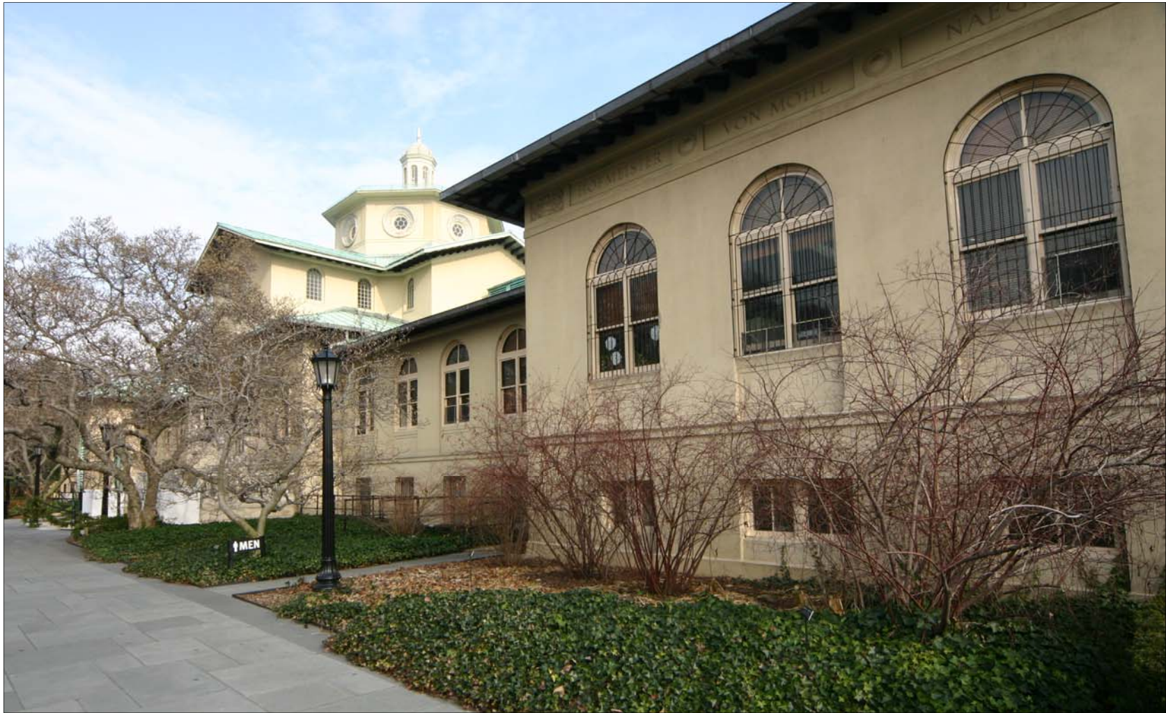
Laboratory Administrative Building, Brooklyn Botanic Garden Façade Toward Garden