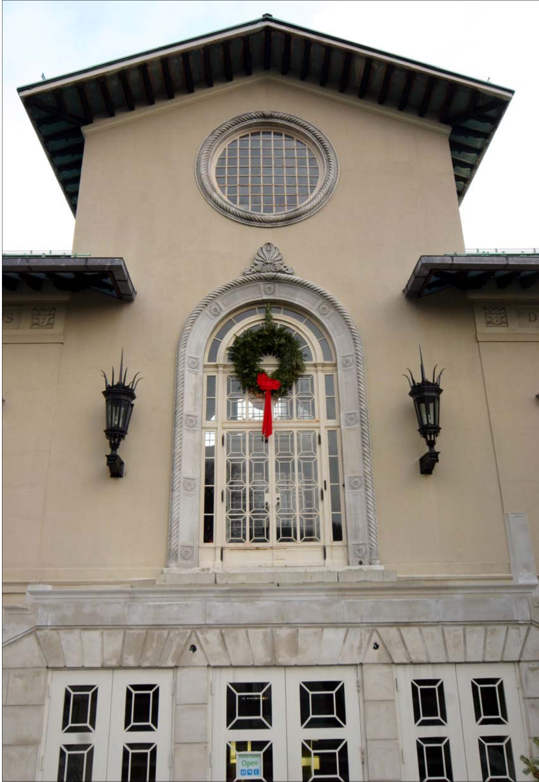
Laboratory Administrative Building, Brooklyn Botanic Garden