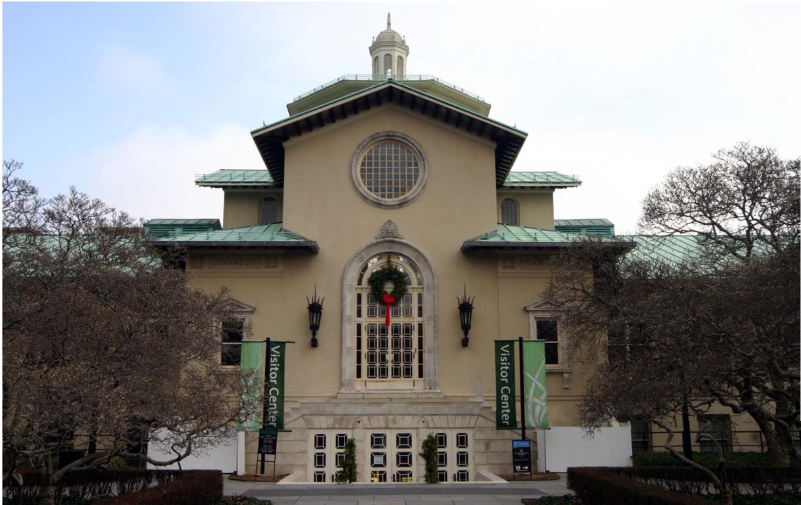
Laboratory Administrative Building, Brooklyn Botanic Garden Façade Toward Garden