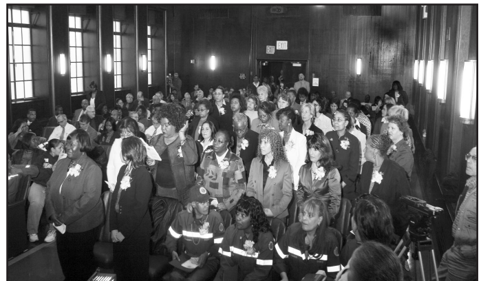
Civilian Women also honored for their contributions to the DSNY.